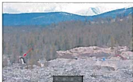
Katuska Water Diversion.jpg 235K