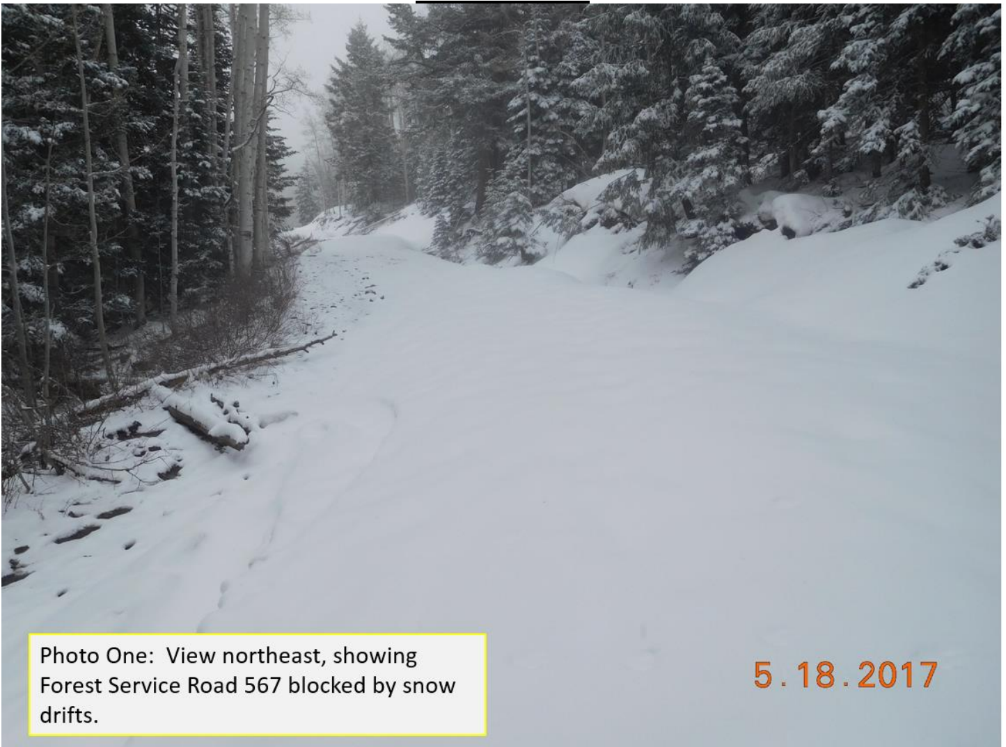
Photo One: View northeast, showing Forest Service Road 567 blocked by snow drifts.