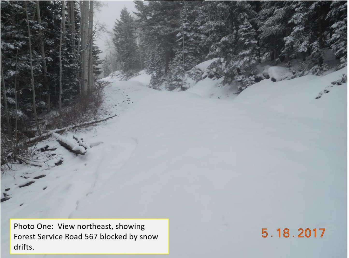
Photo One: View northeast, showing Forest Service Road 567 blocked by snow drifts.