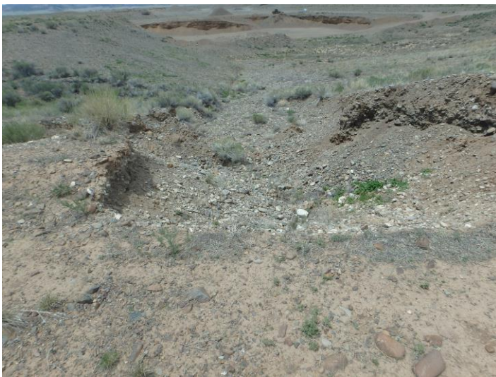
Erosion feature on east side