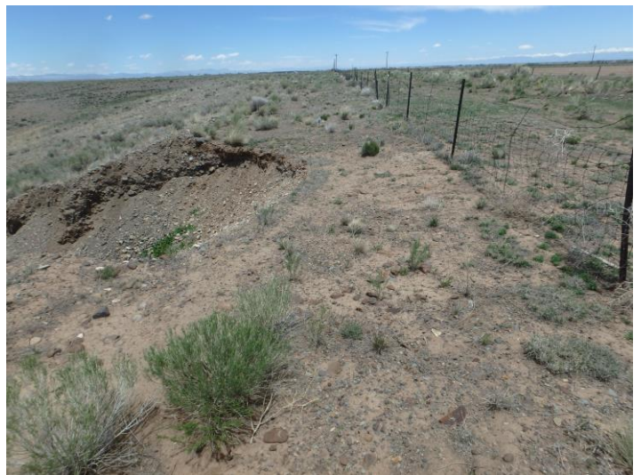
Erosion feature on east side