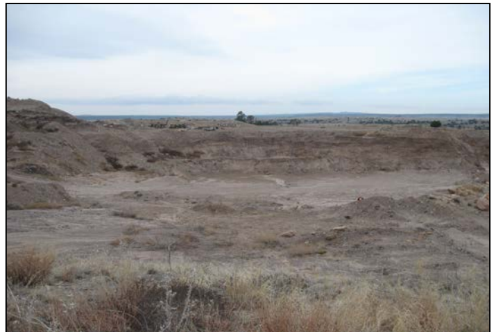
4. Overview of pit, photo taken facing west.