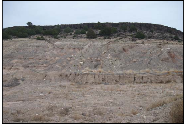
2. Eastern pit wall.