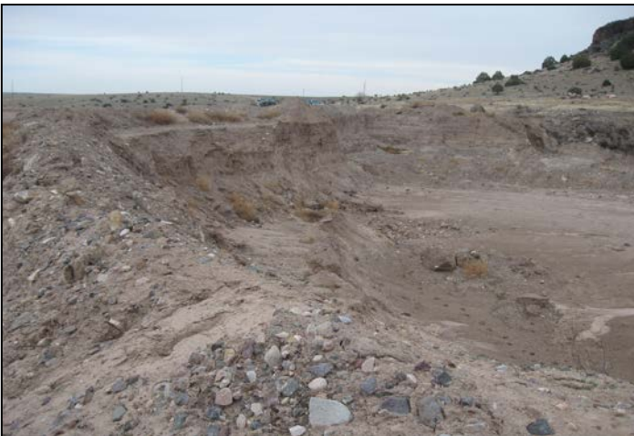
3. Overview of pit, photo taken facing north.