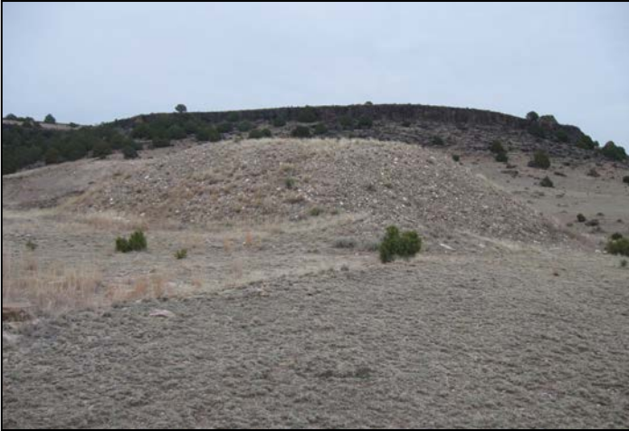
1. Topsoil stockpile.