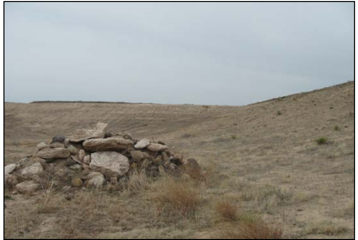
2. Overview of pit floor, facing south.