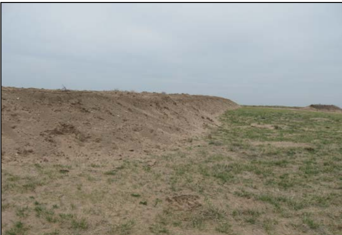
3. Topsoil stockpile.