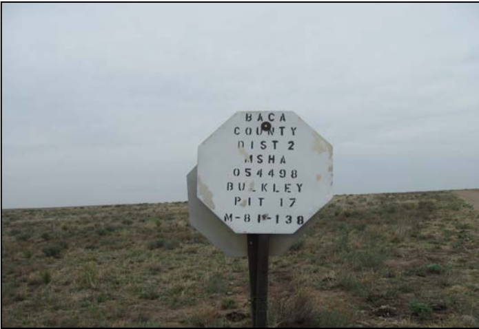
1. Permit sign at site entrance.