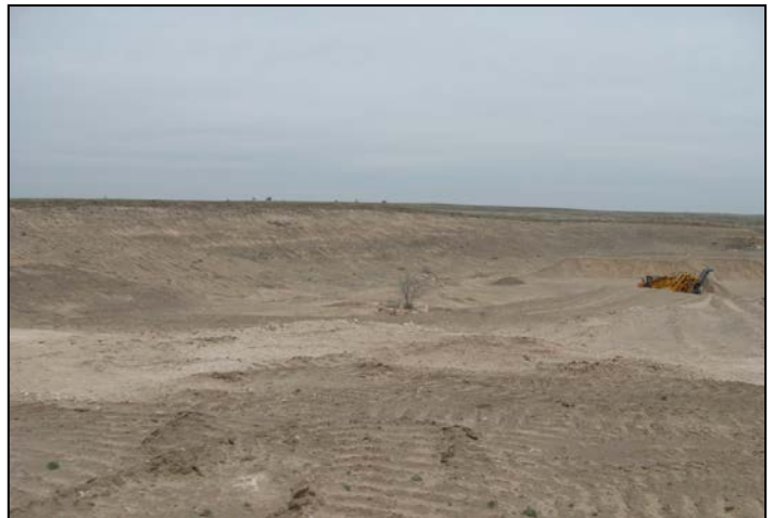
4. Overview of pit, facing north.