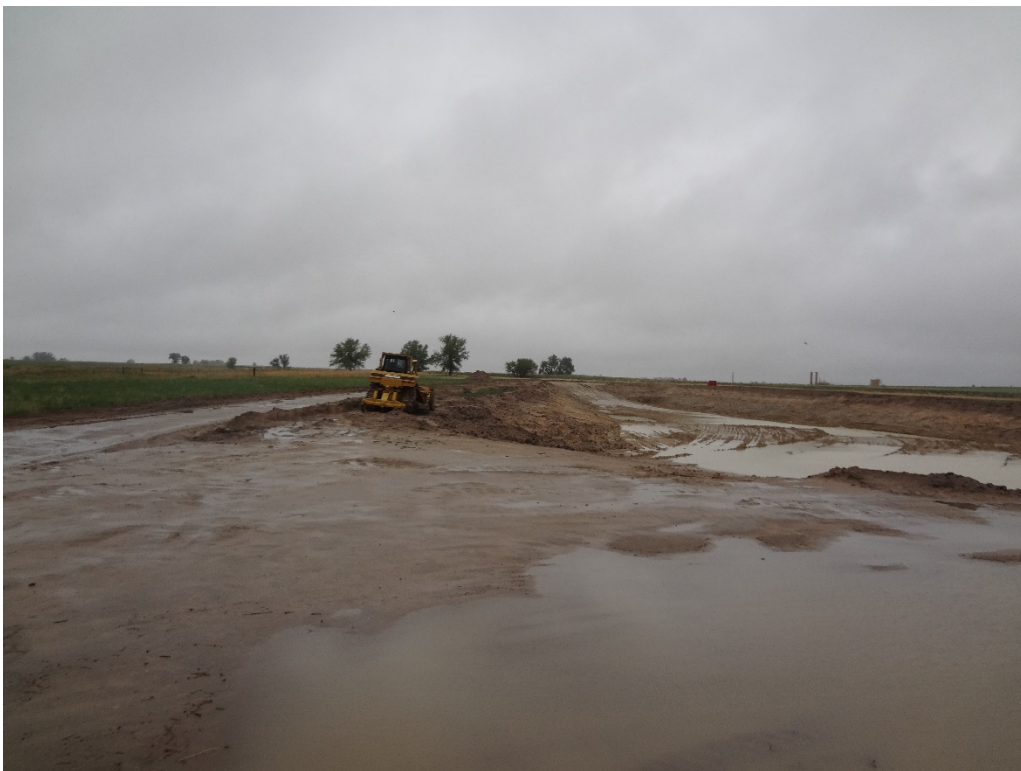
View of the site from the NE corner of pit looking south