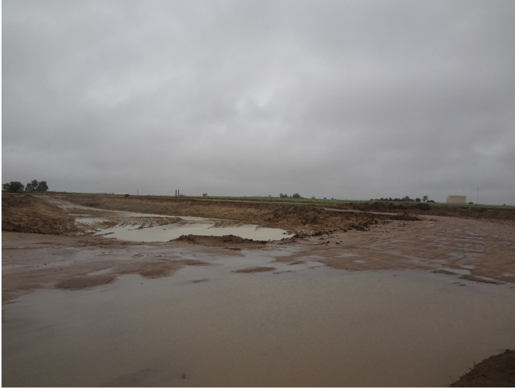
View of the site from the NE corner of pit looking southwest