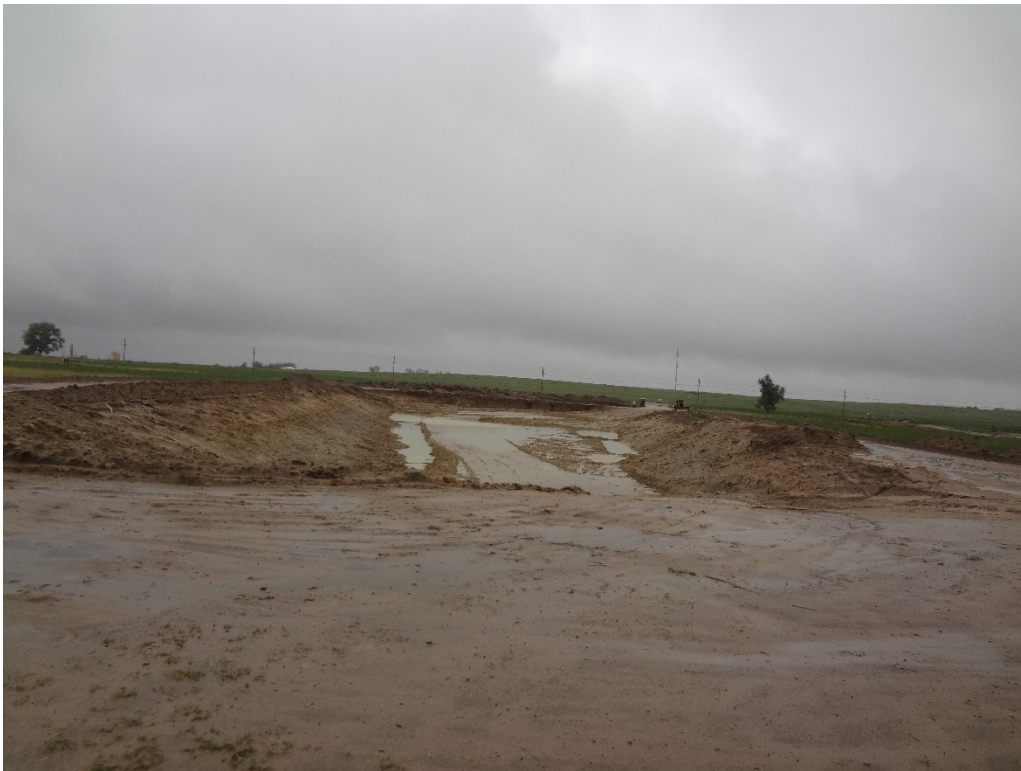
View of the site from the south end of pit looking north