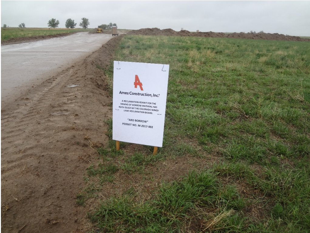
Ard Property Borrow mine sign