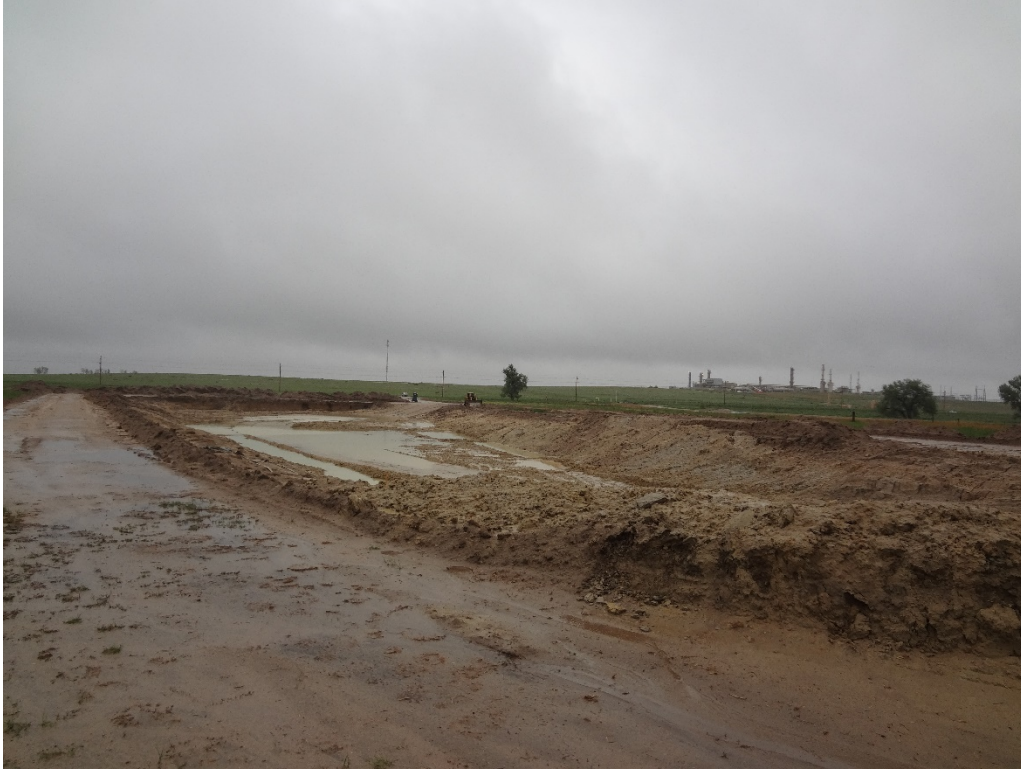
View of the site from the SW corner of pit looking northeast