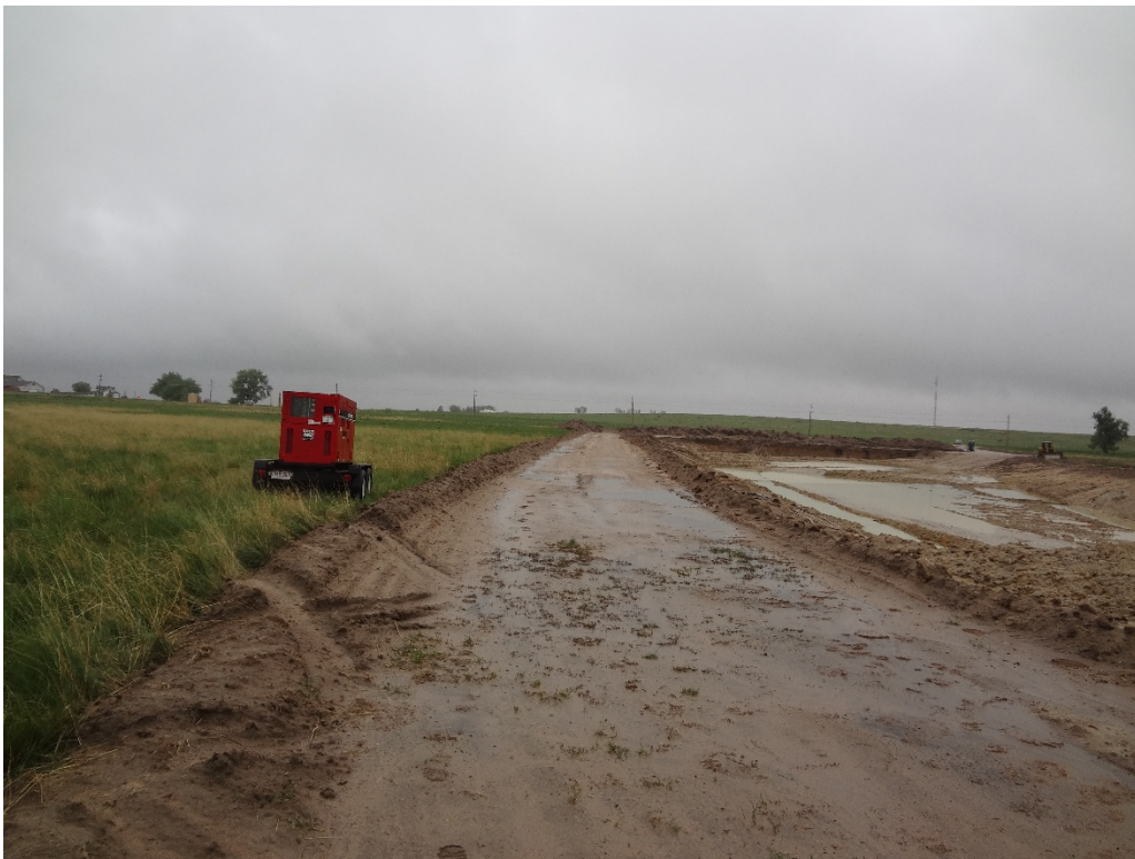
View of the site from the SW corner of pit looking north