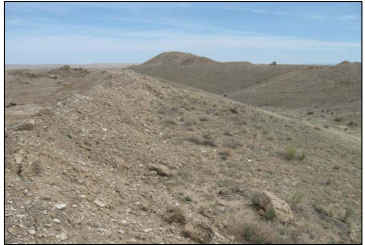
2. Perimeter berms.