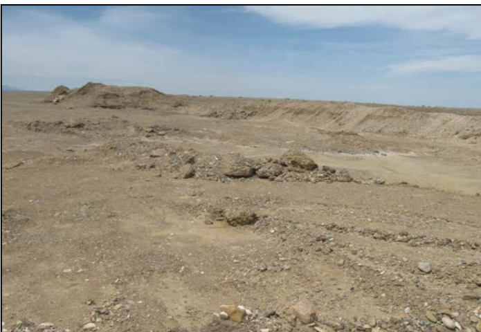
3. Mining area within Phase 3.