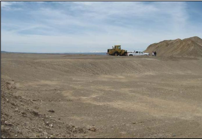
1. Mining slopes graded to 3H:1V.