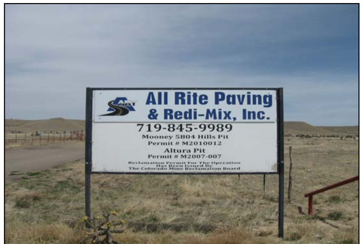
4. Permit sign at site entrance.