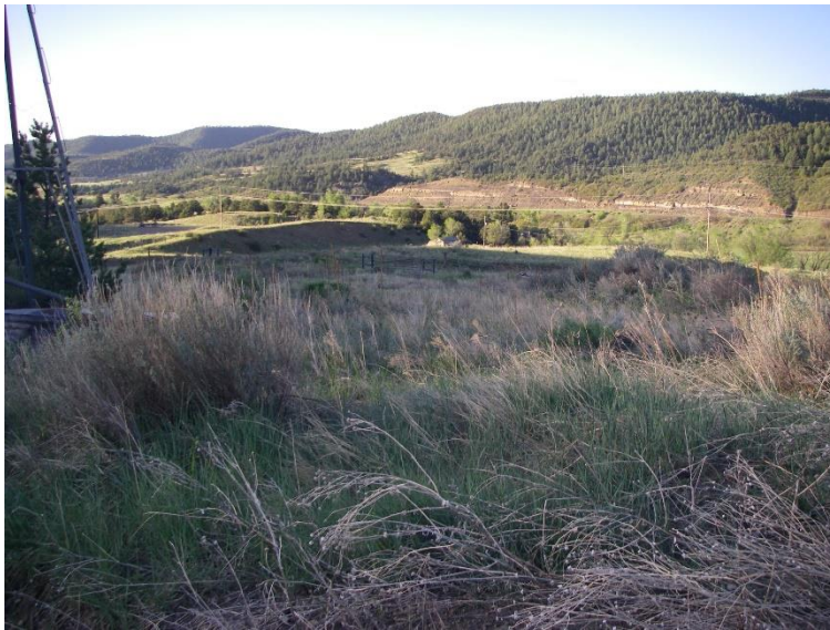
Lower part of reclaimed road

Number of Partial Inspection this Fiscal Year: 9