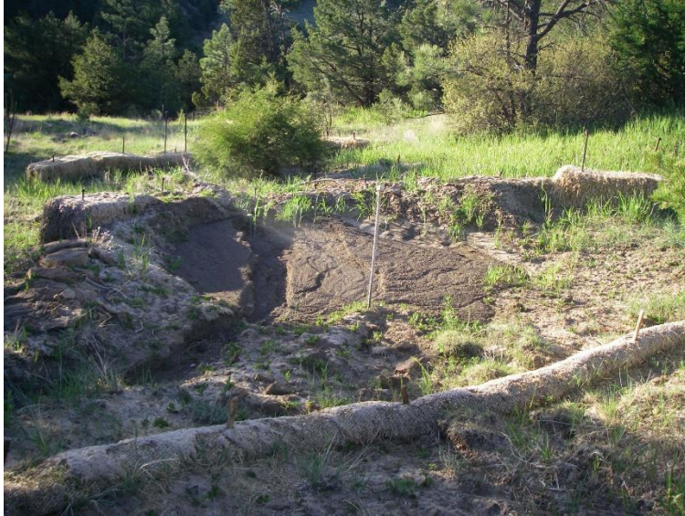
Washed out BMPs