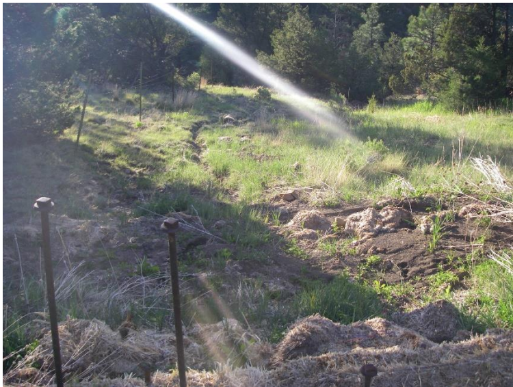
Area below BMPs

Number of Partial Inspection this Fiscal Year: 9