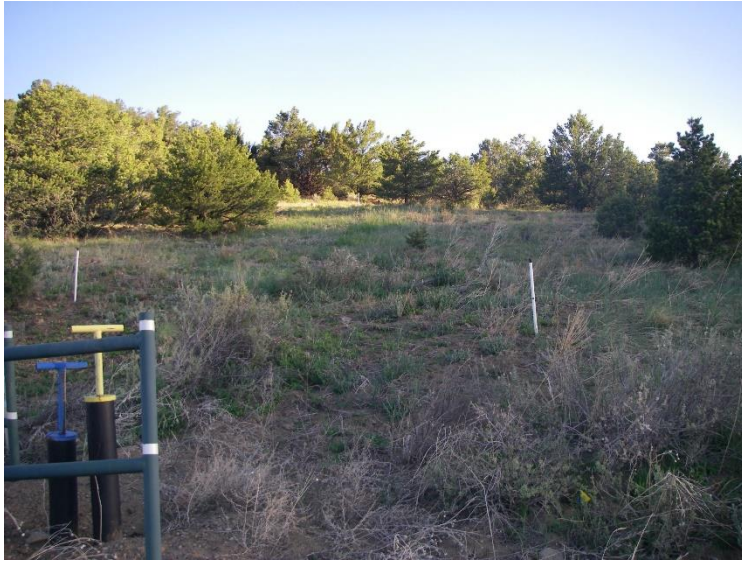
Reclaimed road to pad