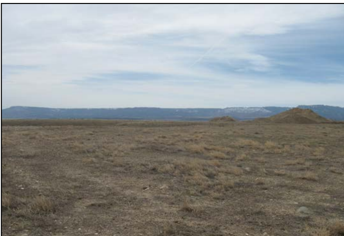
3. Remaining product stockpiles.