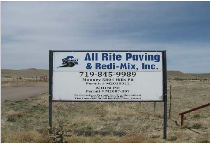
1. Permit sign at site entrance.