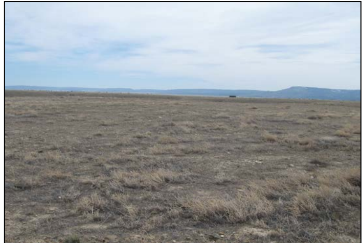
2. Overview of the top of the mesa.