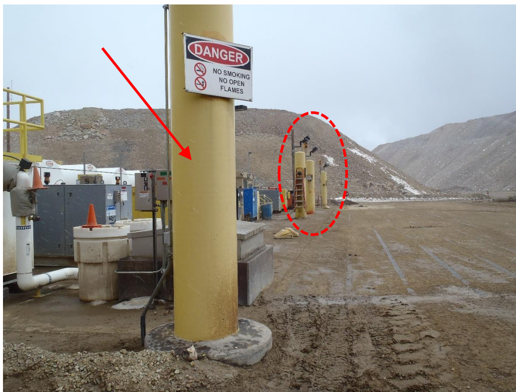
Photo 9. Large bollards protecting fuel tanks from mine equipment.