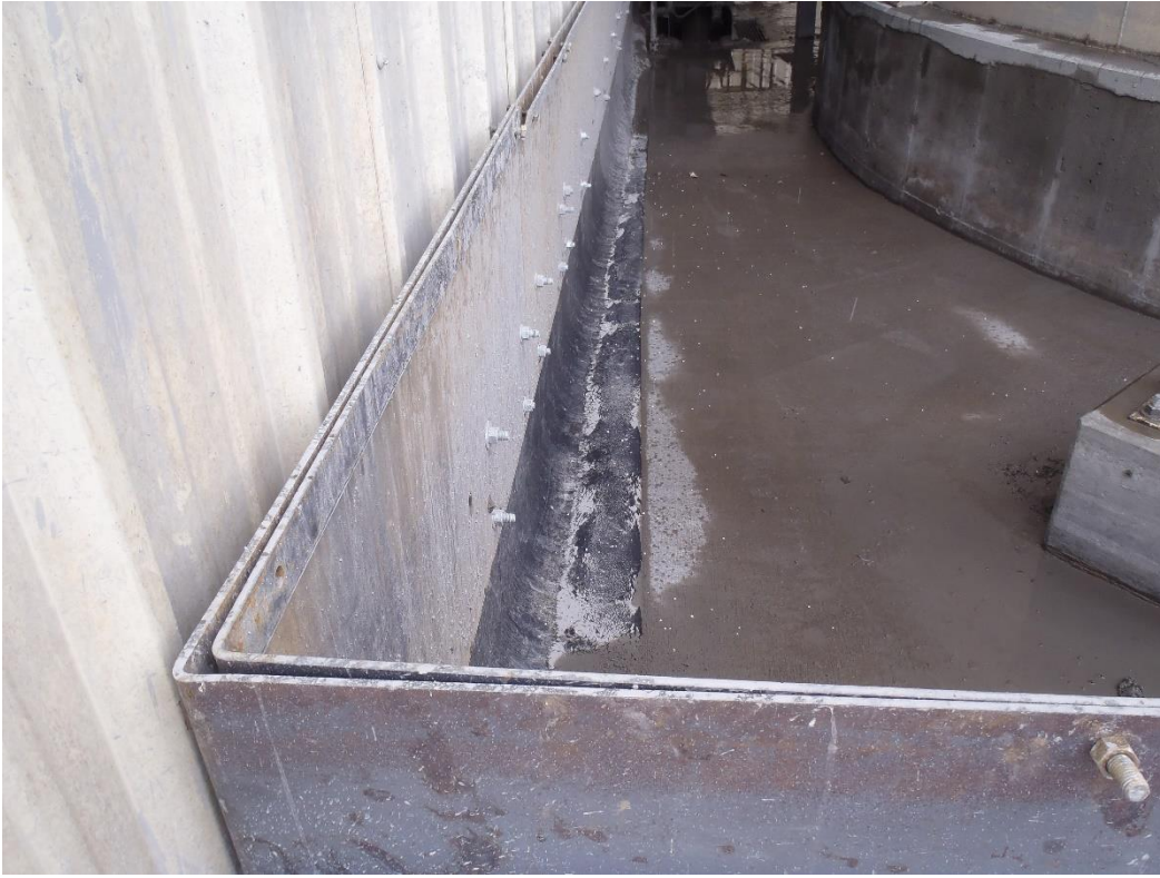
Photo 1. Vat leach tank secondary containment construction (steel plate & rubber membrane).