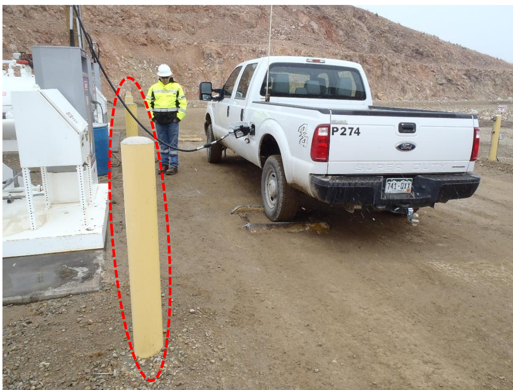
Photo 8. Standard bollards protecting fuel tanks from light trucks.