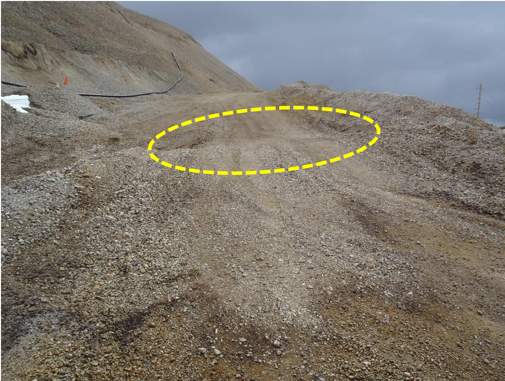
Photo 5. NW toe of AGVLF access road Xing – possible, but ineffective water bar (looking SW).