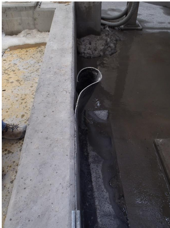
Photo 2. Vat leach tank secondary containment construction (rubber membrane).