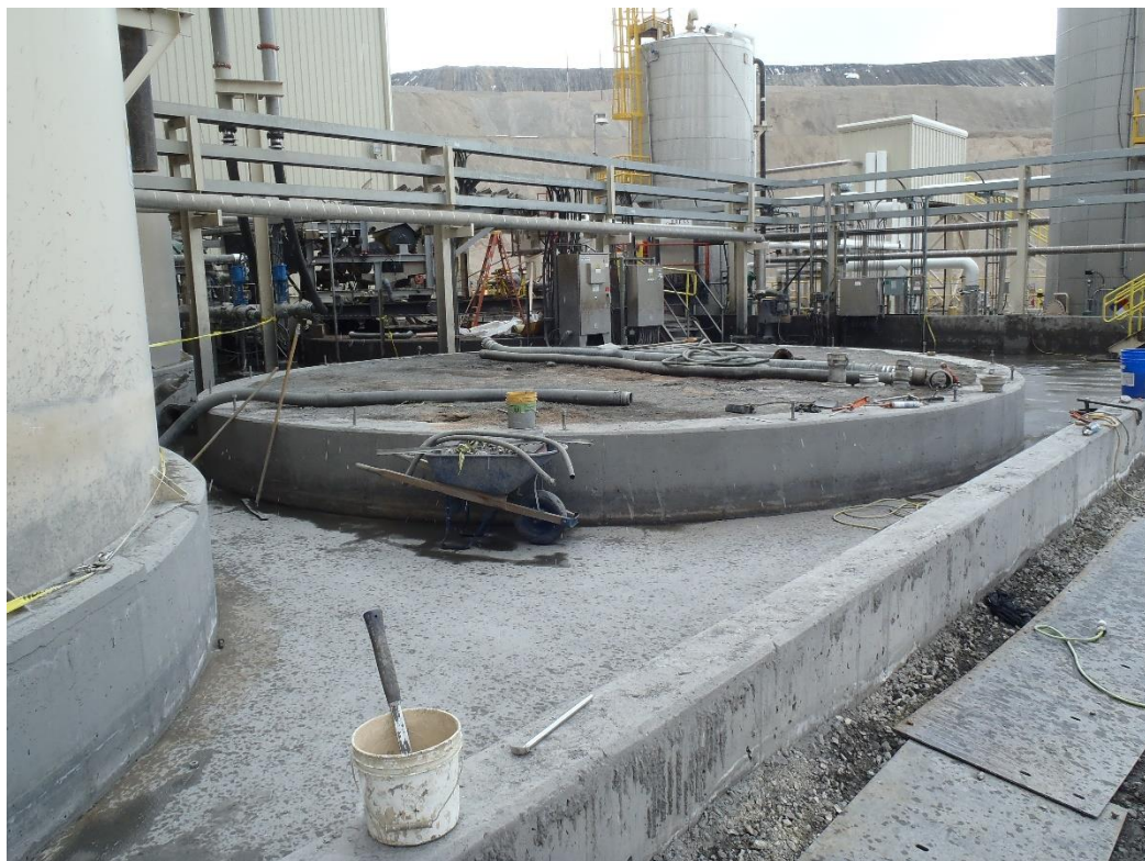
Photo 4. Clear secondary containment.