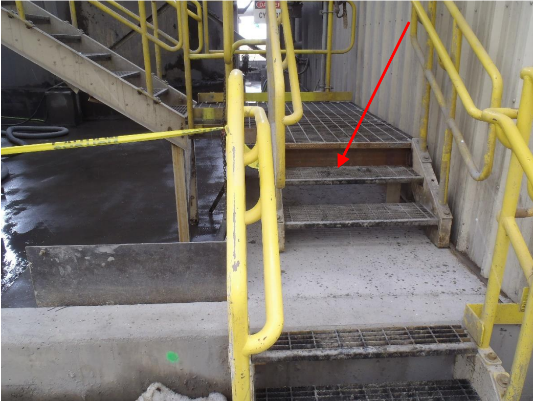
Photo 3. Southeast stairway been modified to accommodate the containment extension.