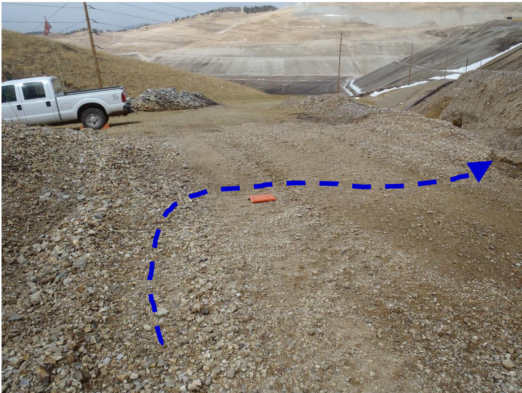
Photo 6. NW toe of AGVLF access road Xing – possible, but ineffective water bar (looking NE).