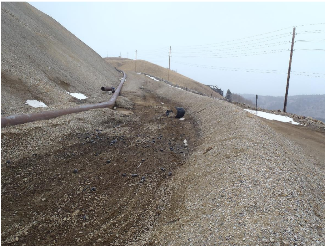
Photo 7. Completed repairs to stormwater intercept channel near AGVLF water tank.