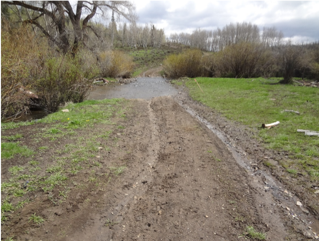
View of unimproved access road crossing at Indian Creek