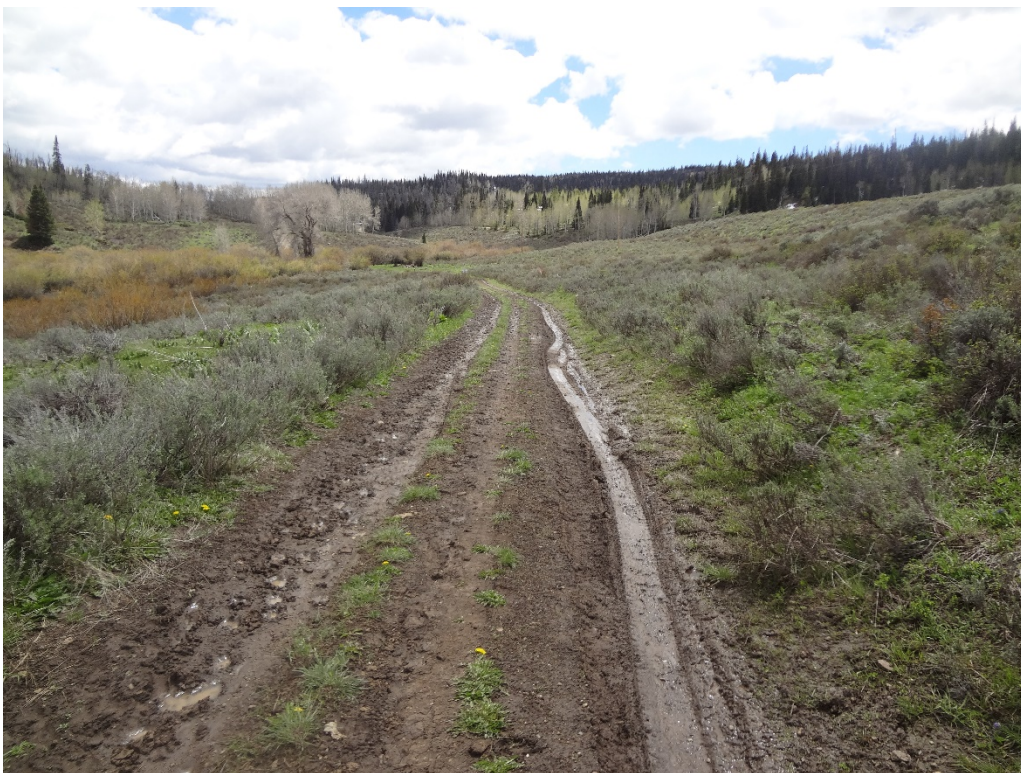
View of the unimproved access road southeast of CR 53