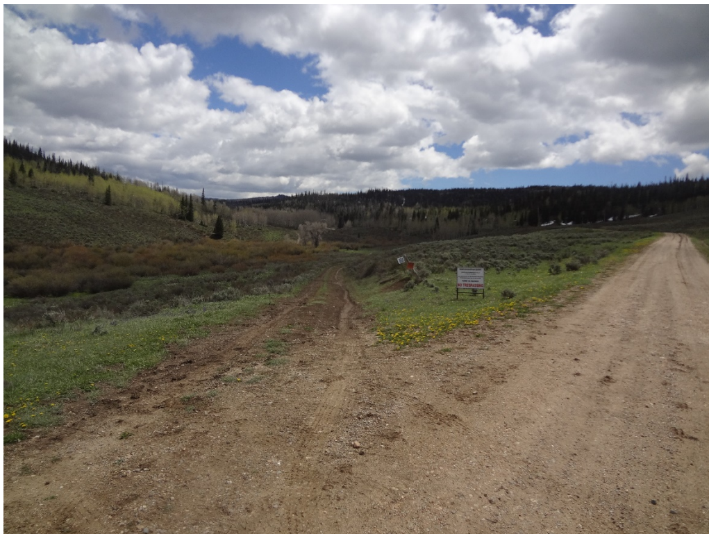
View of unimproved access road from CR 53 looking southwest