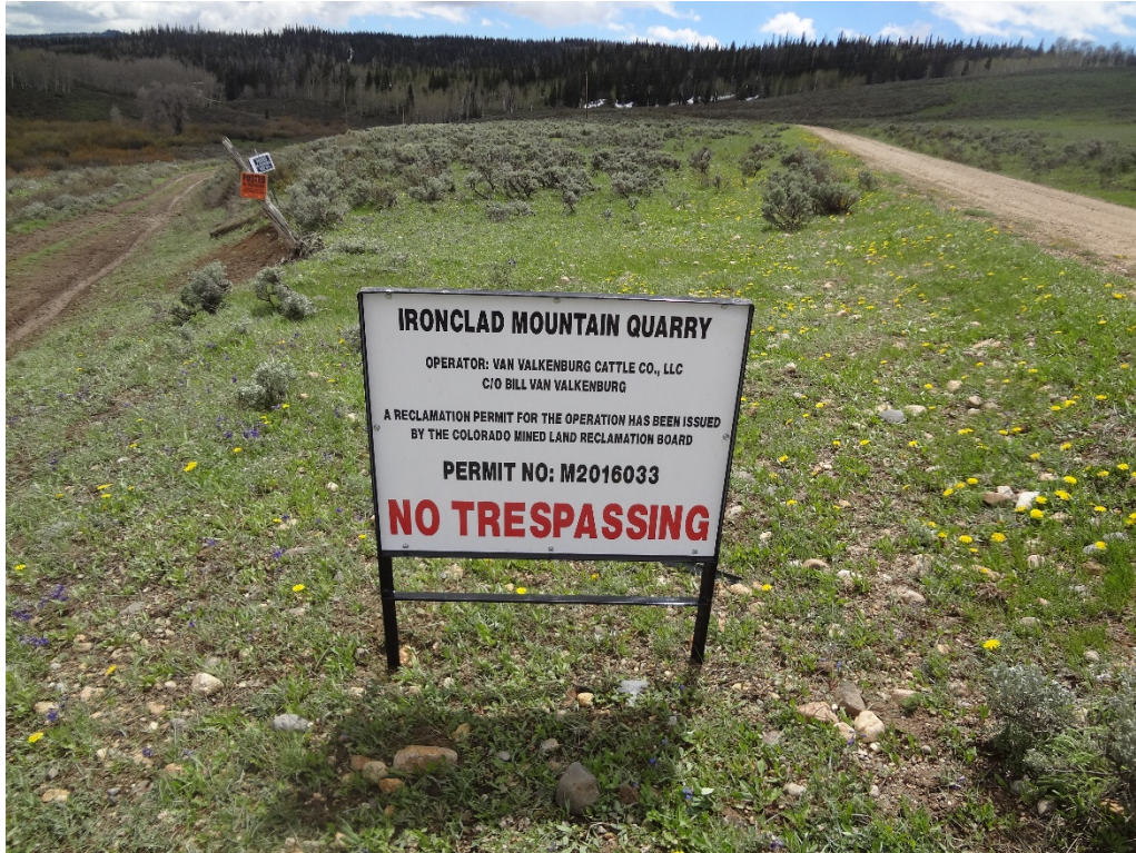
Van Valkenburg Quarry mine sign