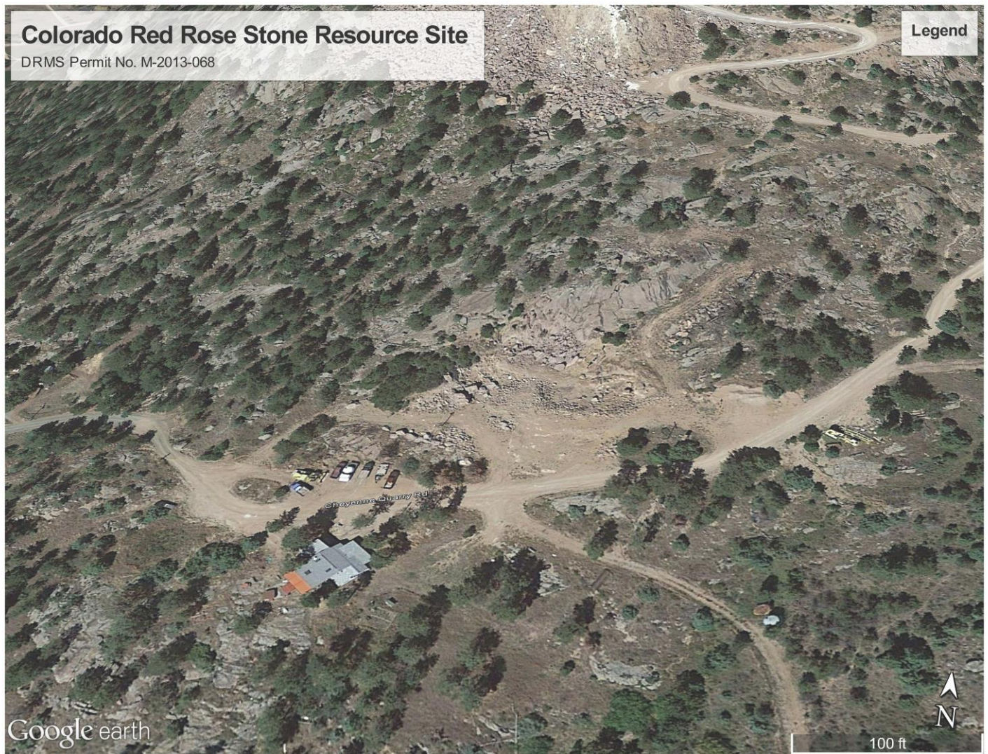
Figure 1. Photograph dated 9/7/2016