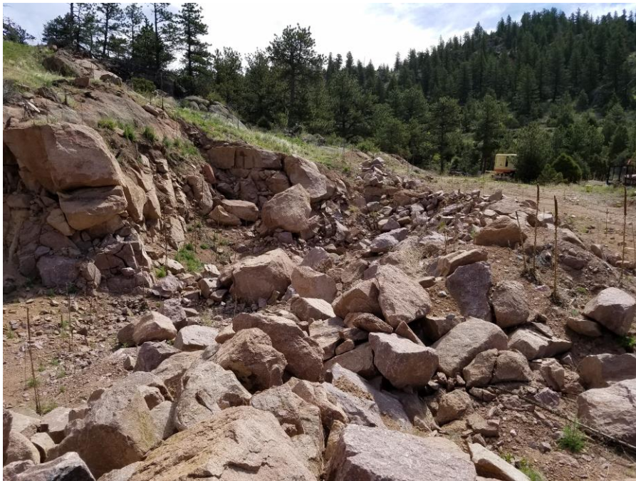
Figure 3. From above the road looking east.