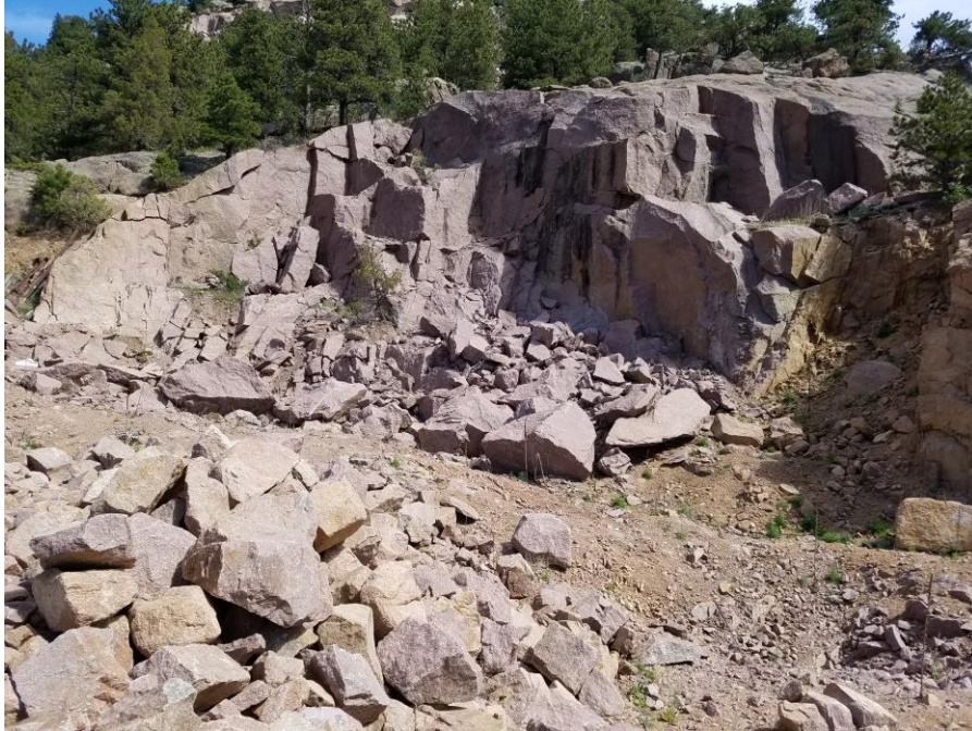
Figure 2. View of highwall from above the road looking north.