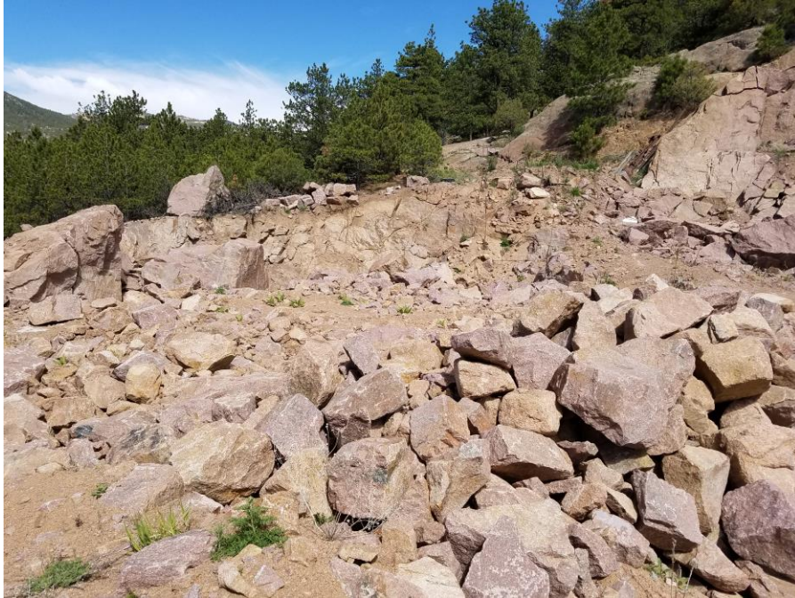
Figure 4. From above the road looking west.