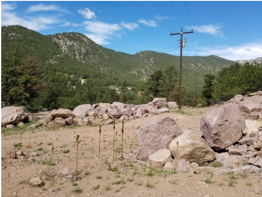
Figure 5. From above the road looking southwest.