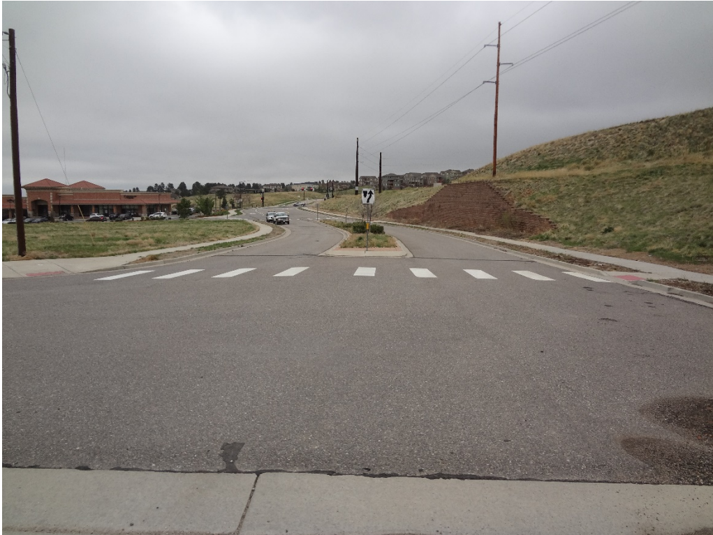
Pine Bluffs Way looking north from south end of road