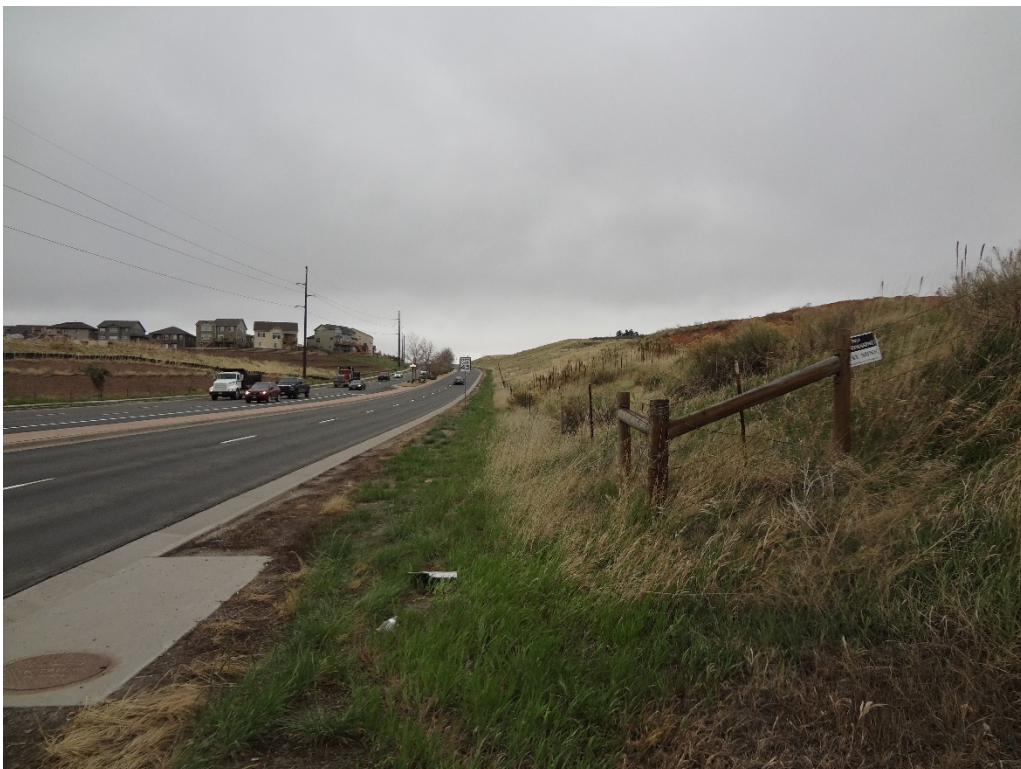
Hess Road looking east from the northwest corner of the permit boundary