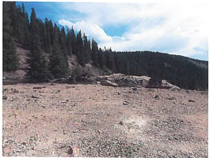
Figure 2: Garibaldi Waste Dump