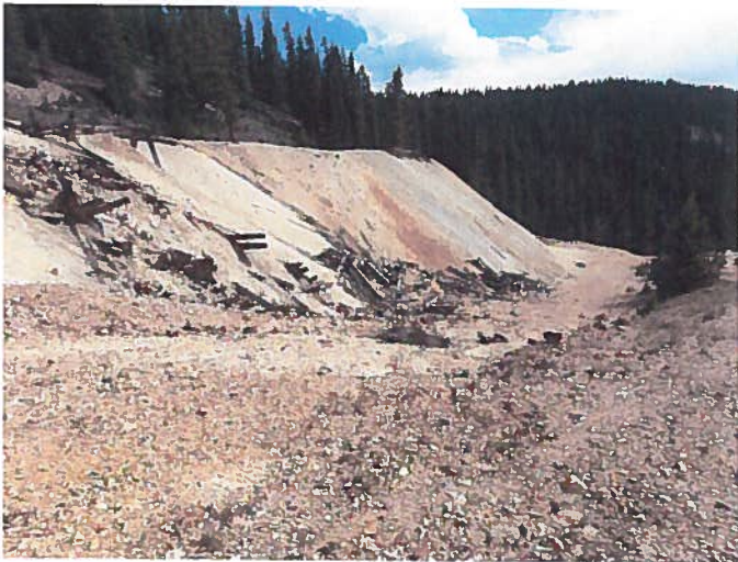
Figure 3: Garibaldi Waste Dump