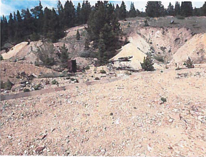
Figure 1: Garibaldi Waste Dump