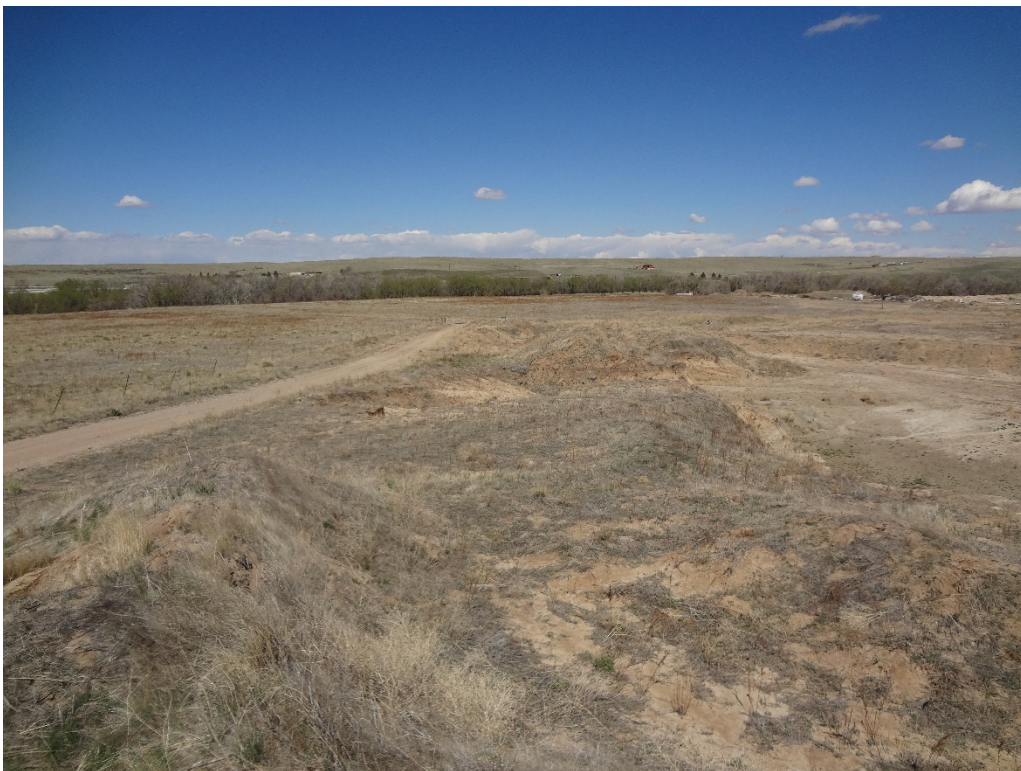
View of the western portion of the south pit highwall looking west