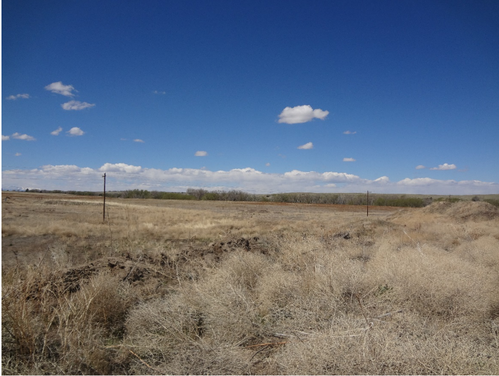
View of the site from the northeast corner looking southwest