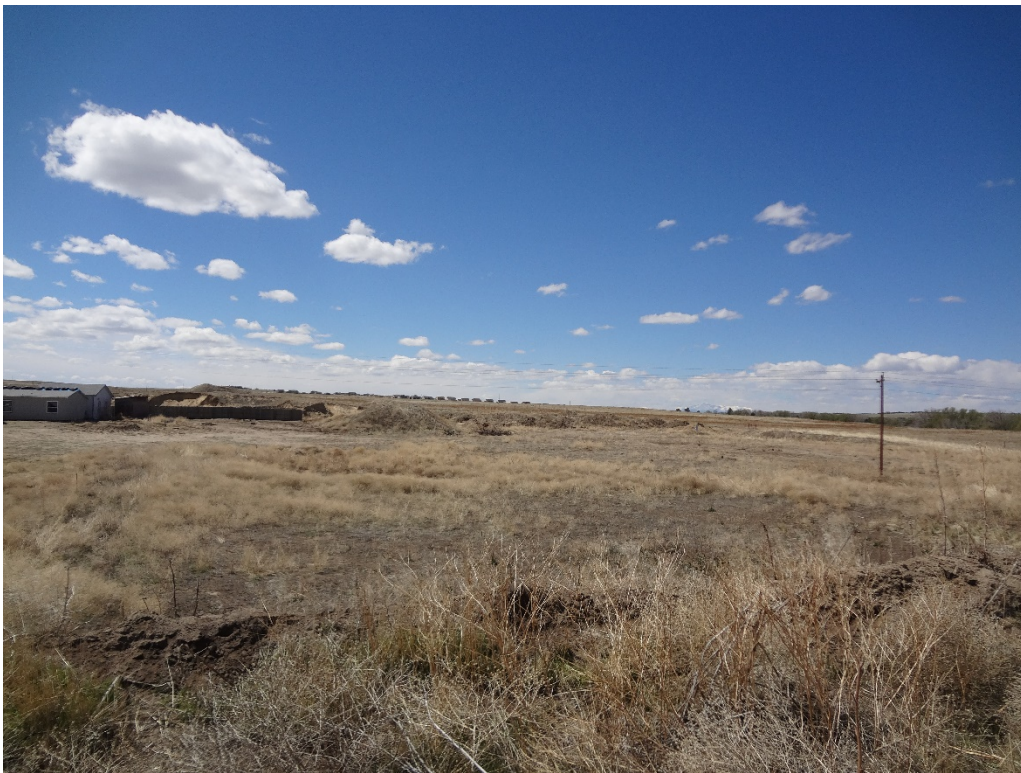
View of the site from the northeast corner looking south