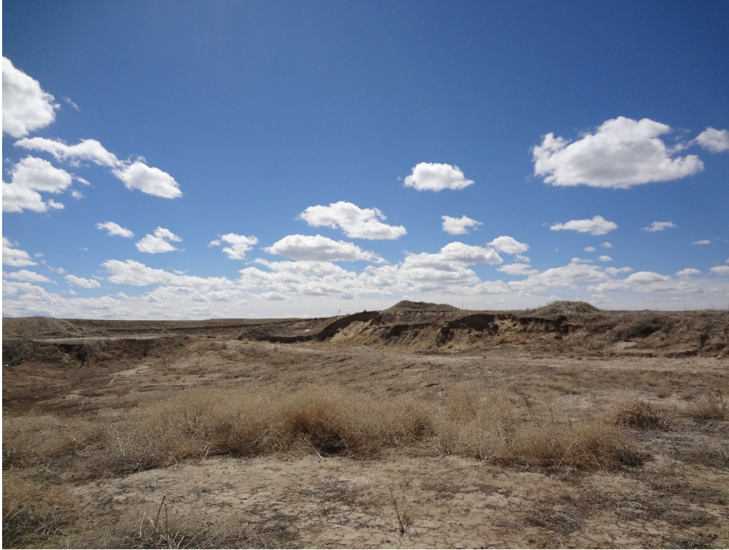
View of the south pit highwall from the pit floor looking southeast