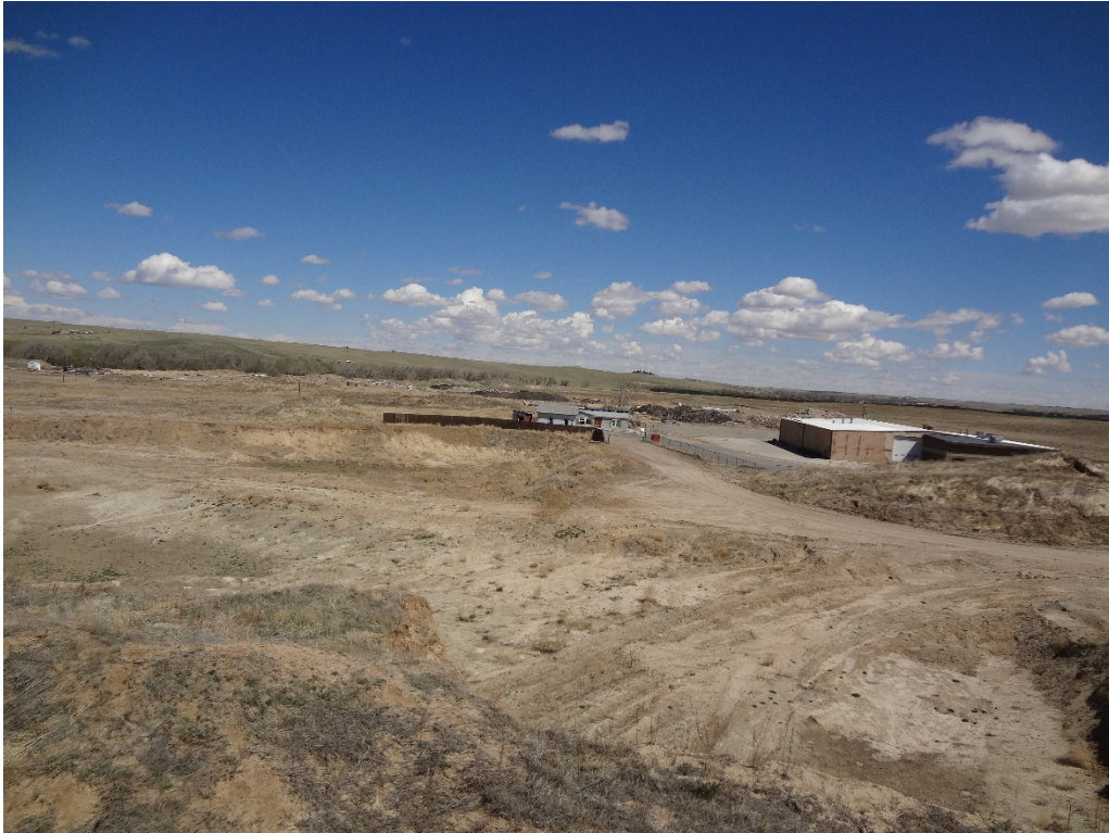
View of site from the SE corner looking north