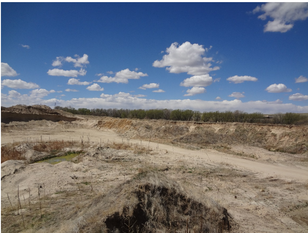
View of site from middle of pit floor looking southwest