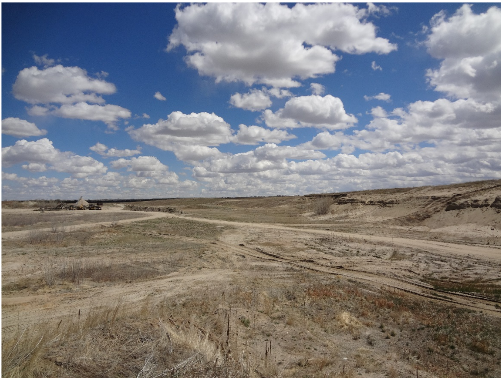
View of site from middle of pit floor looking northeast