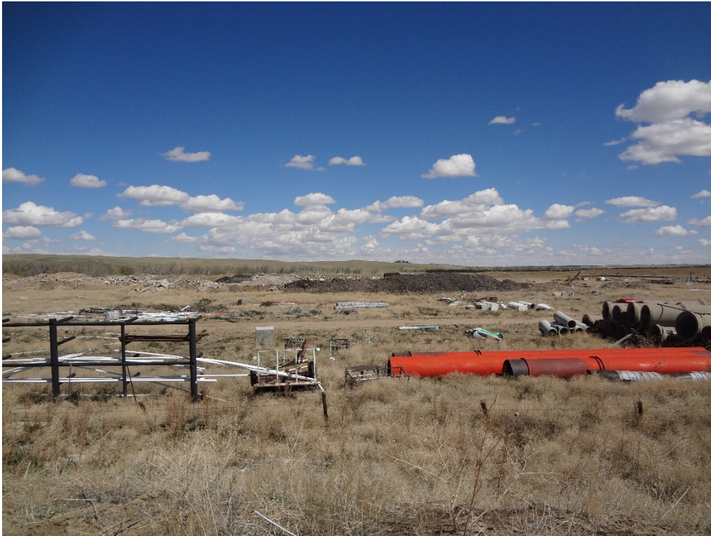
View of construction storage yard from the south boundary looking north