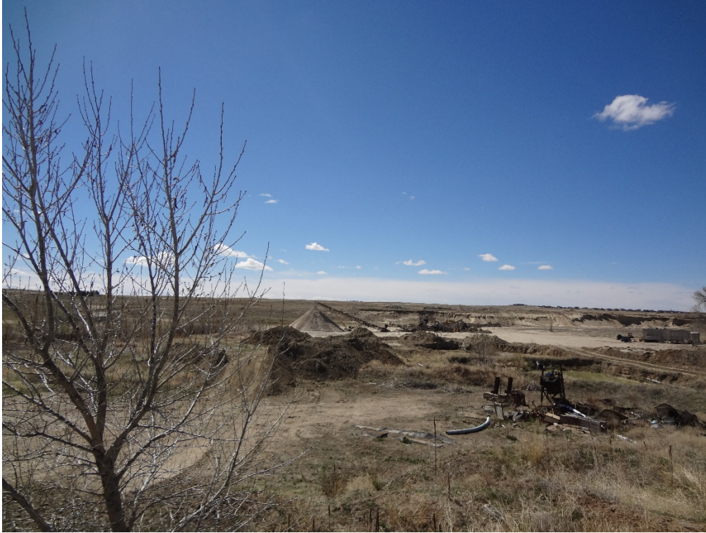
View of site from north topsoil stockpile looking south