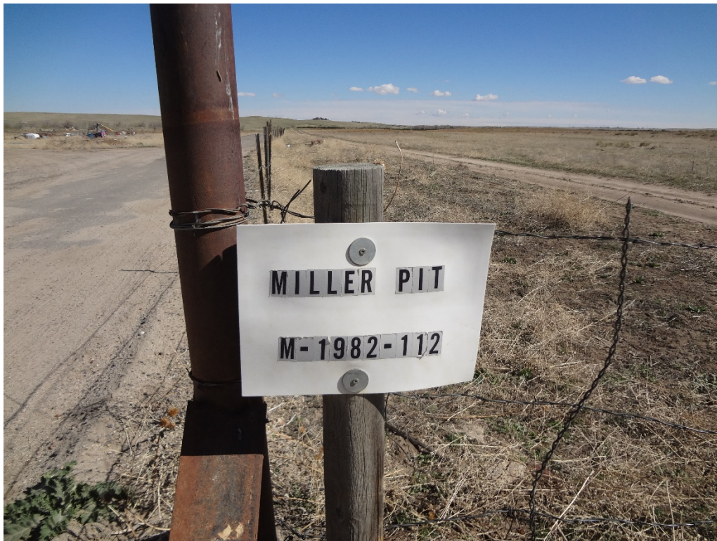
Miller Gravel Pit mine sign