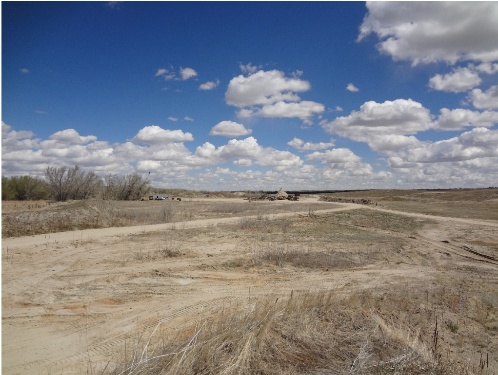
View of site from middle of pit floor looking north