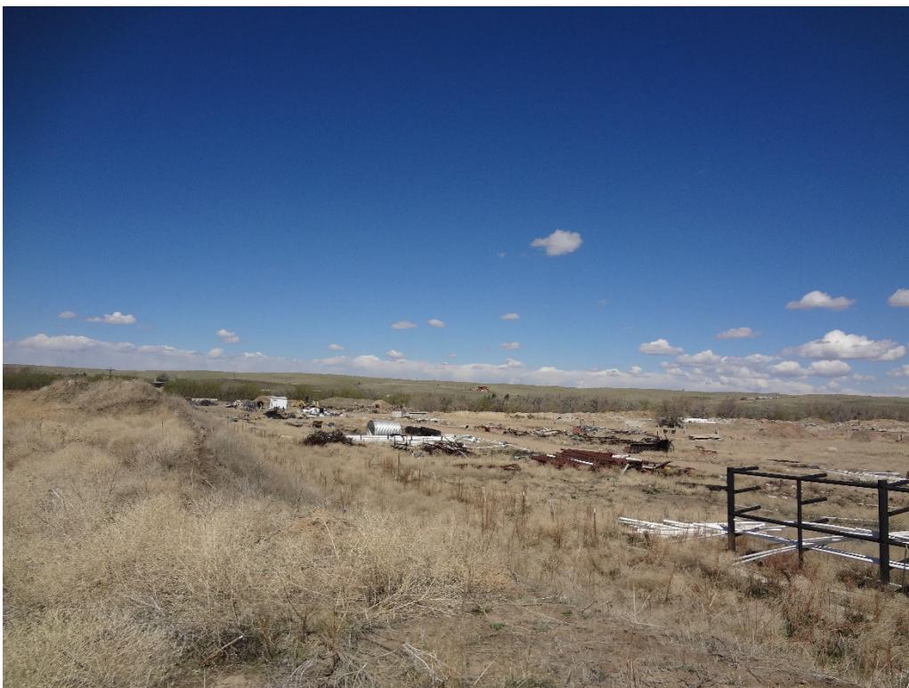
View of construction storage yard from the south boundary looking NW