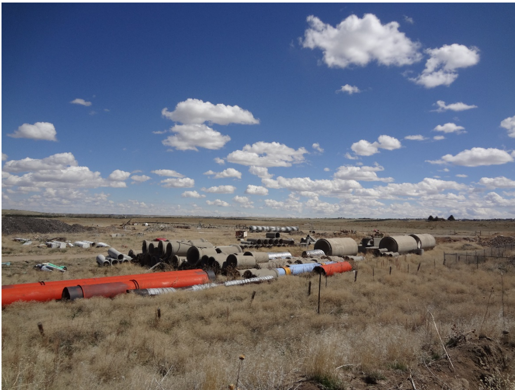
View of construction storage yard from the south boundary looking NE