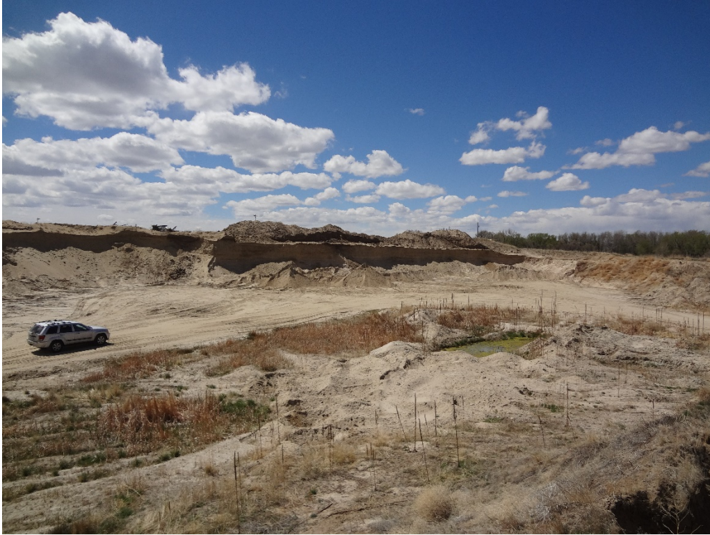
View of site from middle of pit floor looking south