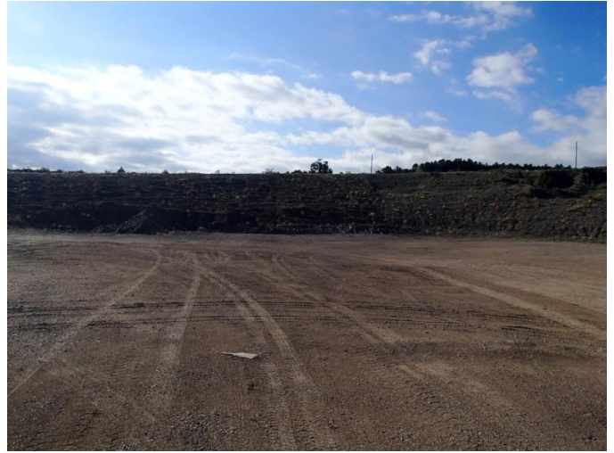
Figure 2: View towards the southeast end of the pit.