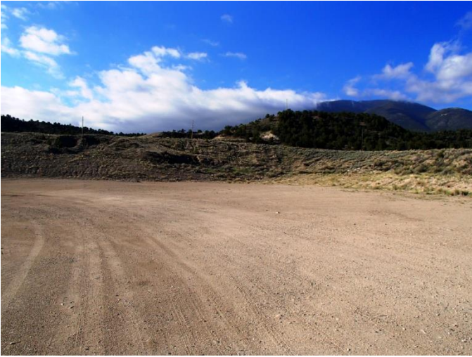
Figure 1: View from the entrance to the site, facing south.