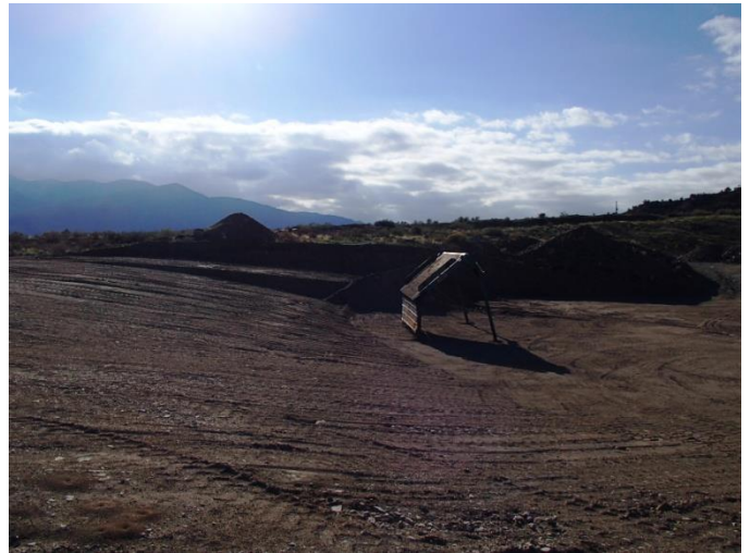
Figure 4: View toward the east end of the pit.