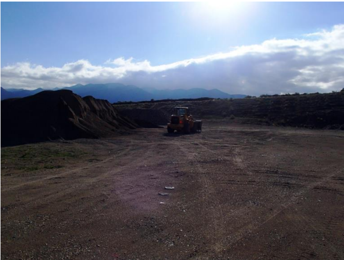
Figure 3: View toward the east end of the pit.