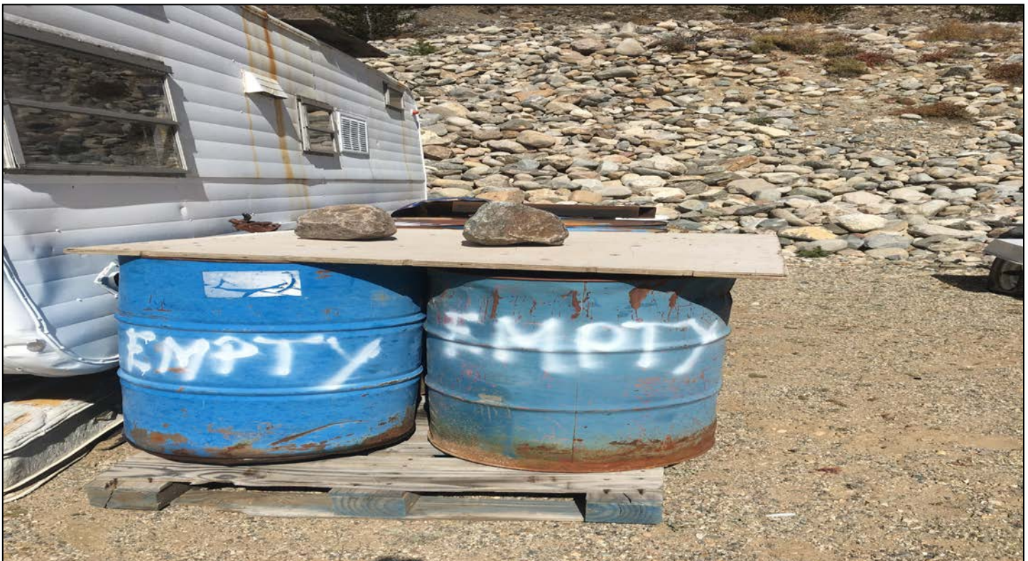
2. Labeled 55 gallon drums.