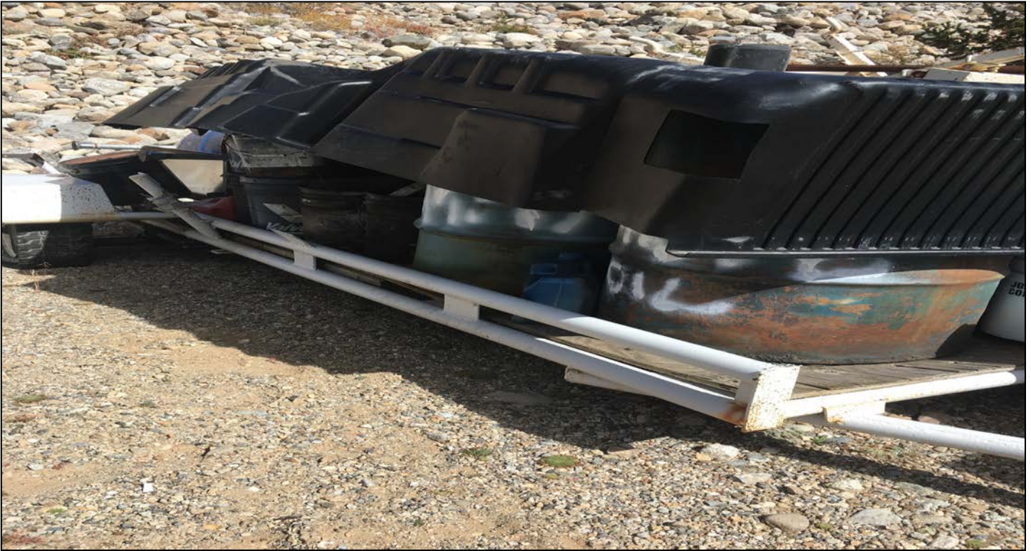
3. Labeled 55 gallon drums.