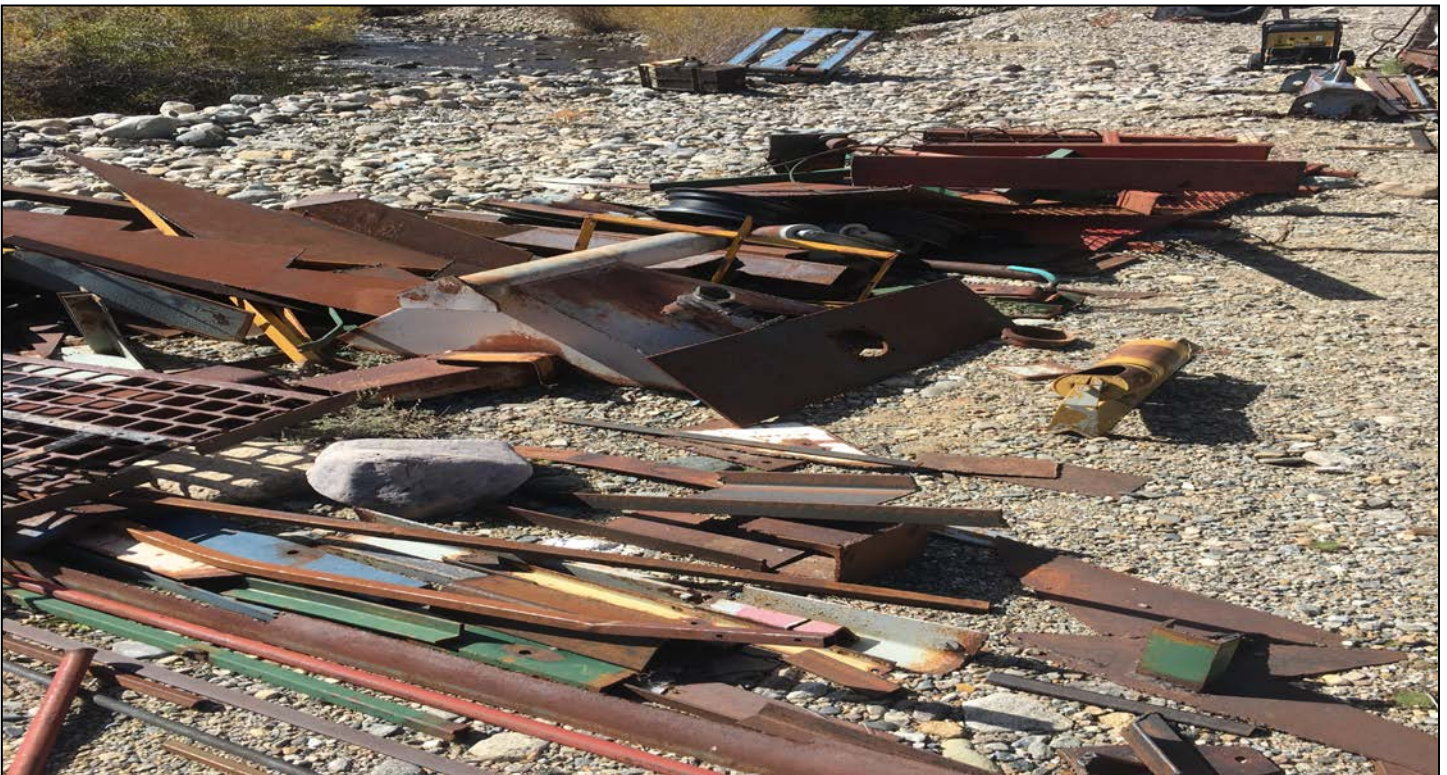
4. Scrap metal.