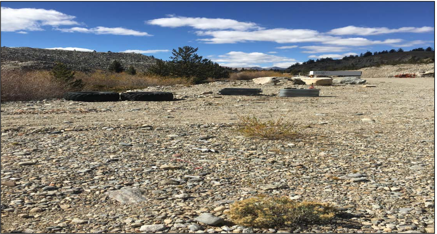
1. Area cleared of refuse.