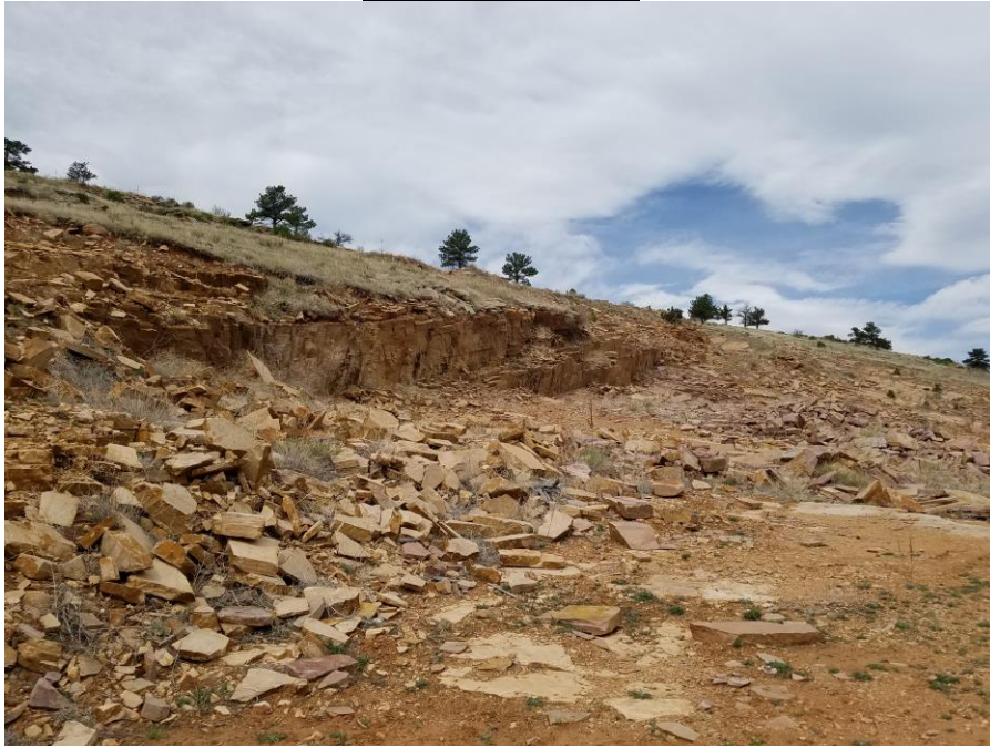
Figure 1. Working face at the west end of the affected area.