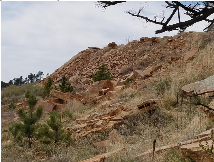
Figure 2. From the east end of the affected area looking south at the base of the 1st bench.