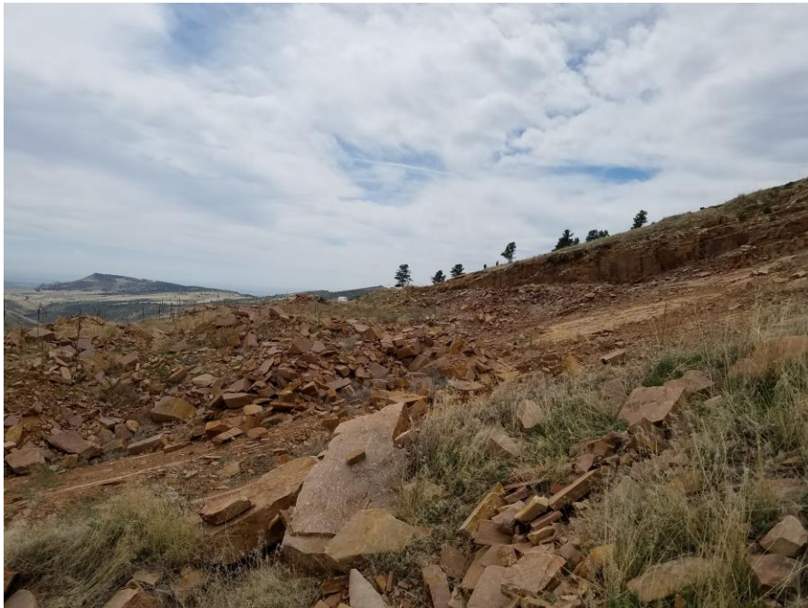
Figure 4. From on top of the 3rd bench looking south.