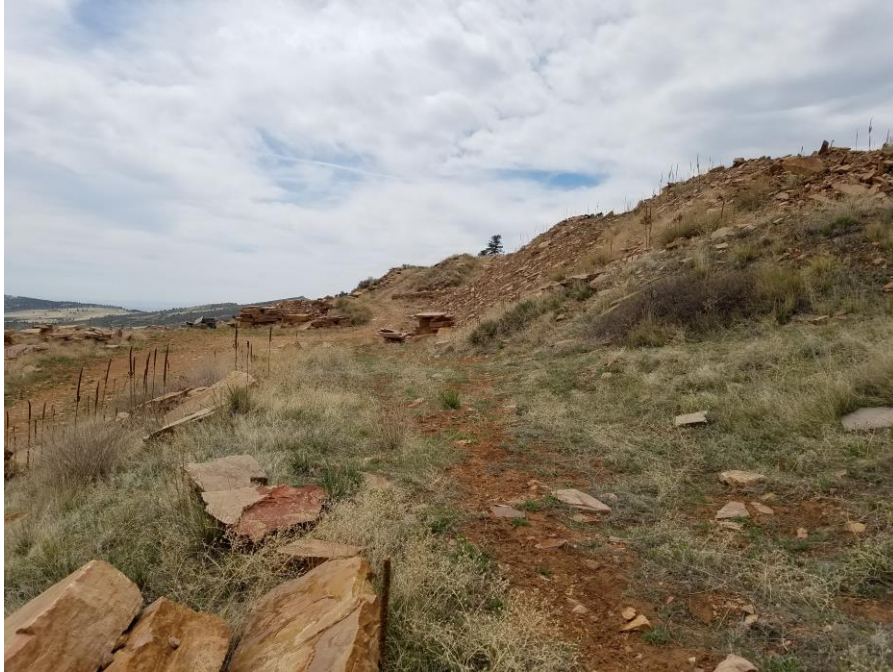
Figure 3. From the base of the 2nd bench on the access road looking south.