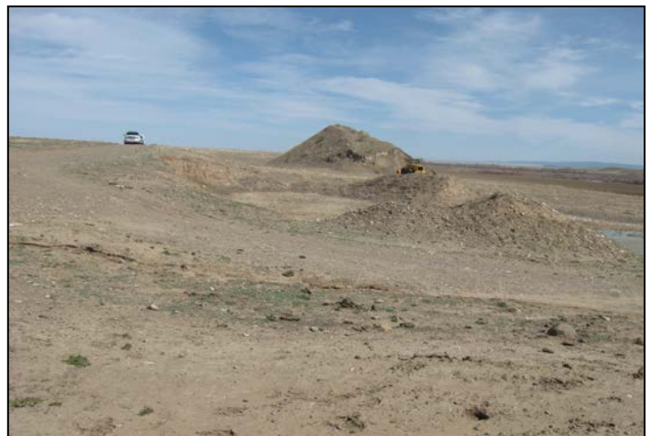
4. West Pit.