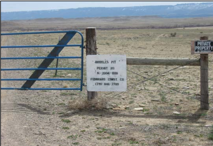
1. Permit sign at site entrance.