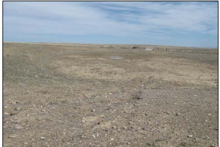
2. East pit.