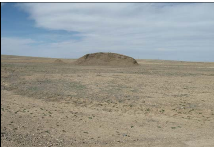
3. Storage area.