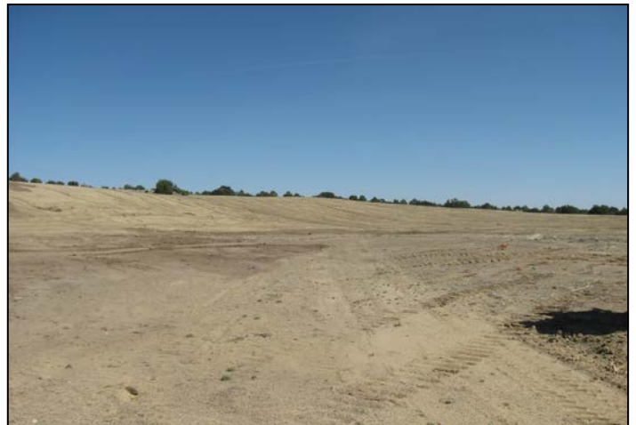
4. Overview of reclaimed site.