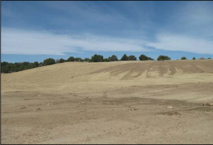
1. Reclaimed slope, photo taken facing west.