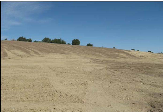
3. Former highwall area.