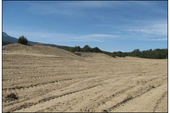
2. Reclaimed pit floor.