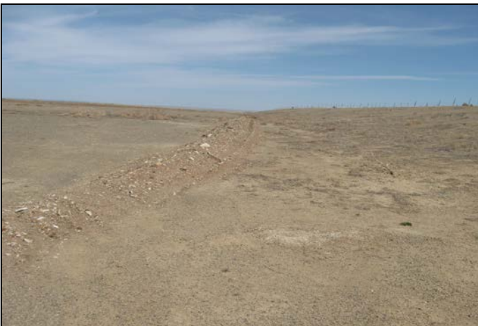
5. Graded slope along eastern permit boundary.