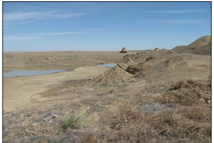
4. Additional areas requiring grading.