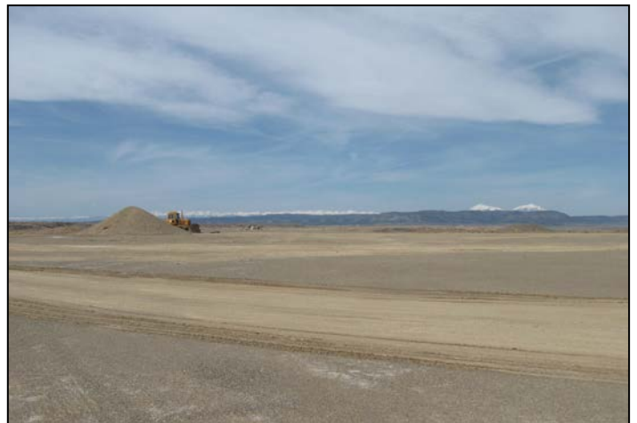
6. Overview of pit floor.