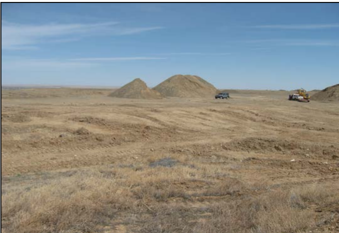
3. Overview of mine site from southern limit of affected area.