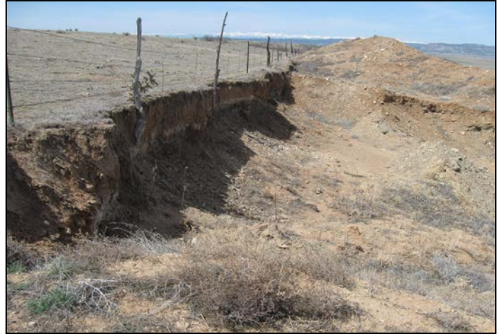
2. Unreclaimed slope along southern portion of affected area.