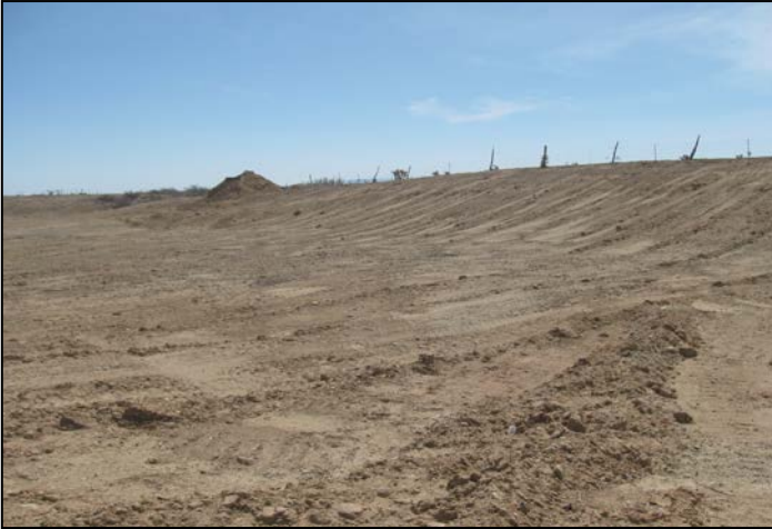
1. Reclaimed slope along southern portion of affected area.