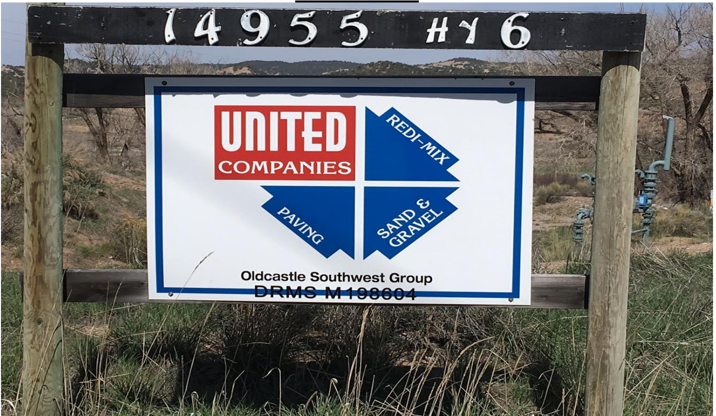
Sign with incomplete permit number, should read M-1986-104.