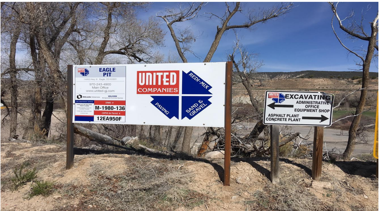
Sign with Chambers Pit permit number.