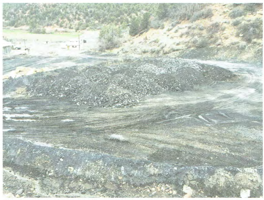
Pic. 2 -Material stockpiled material at base of embankment.