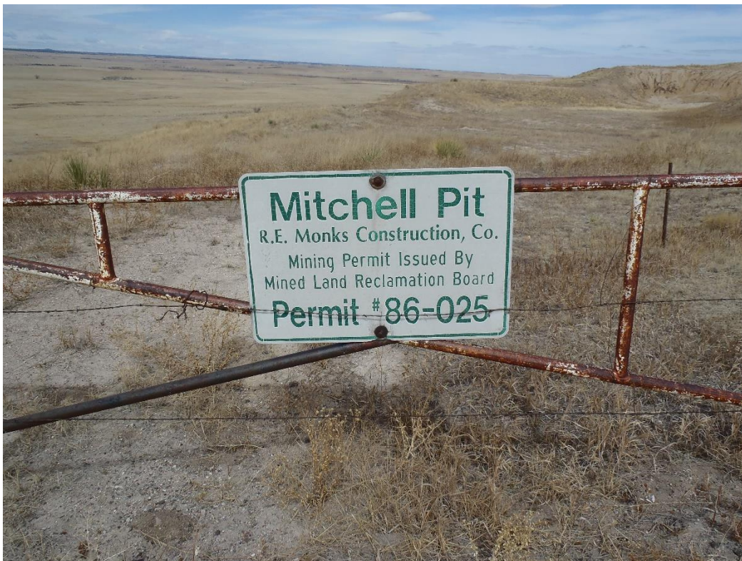
Photo 3. Permit sign.