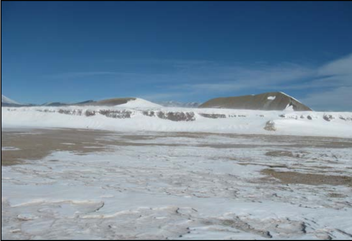
1. View of pit floor, photo taken facing west.