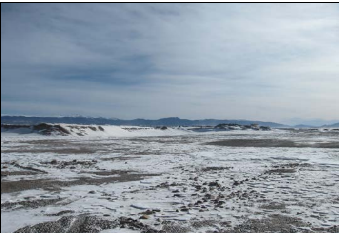
3. View of pit floor, photo taken facing north.