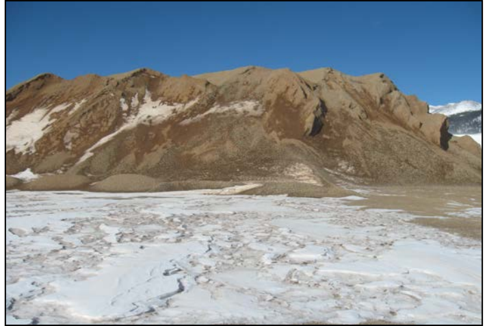
2. Product stockpile within pit.