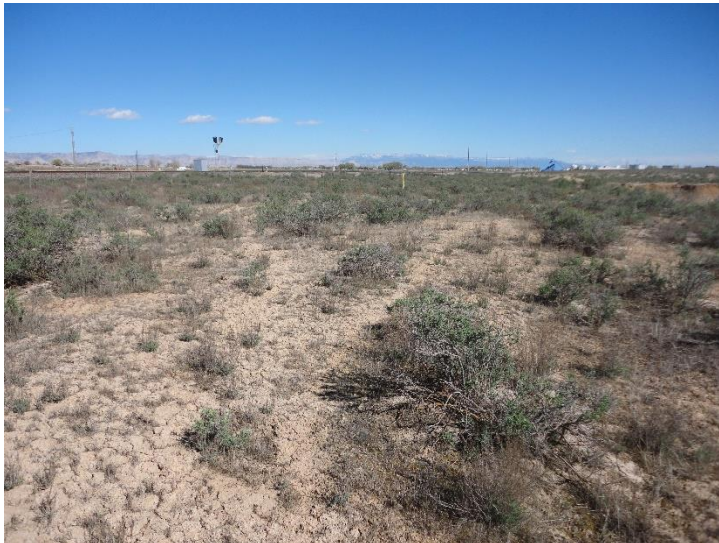
Photo 2: North end of permit area looking eastward. No mining related activity has occurred on the permitted area.

Number of Partial Inspection this Fiscal Year: 1