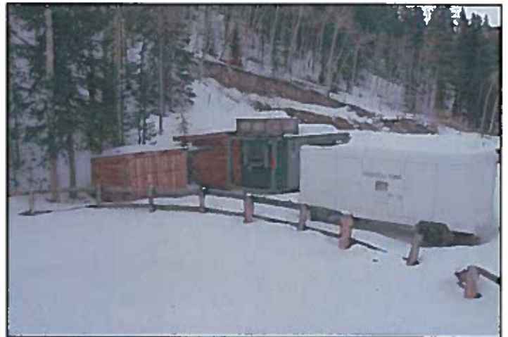
2. Office/parts/safety room.