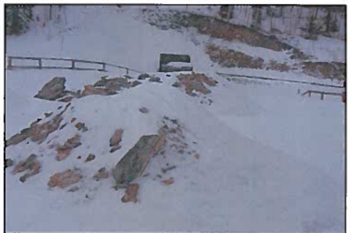
4. Waste rock stockpile.