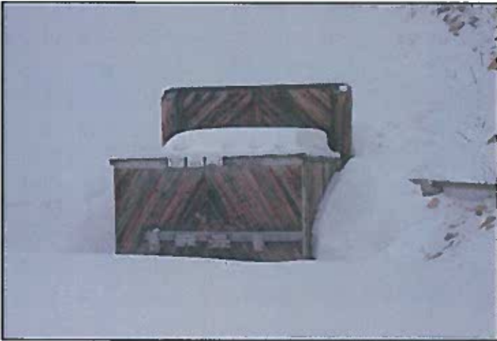
1. Portal with closure.