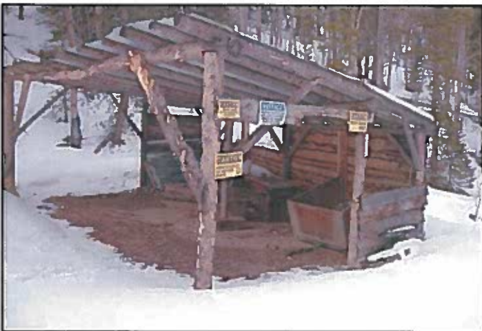
3. Saw mill.