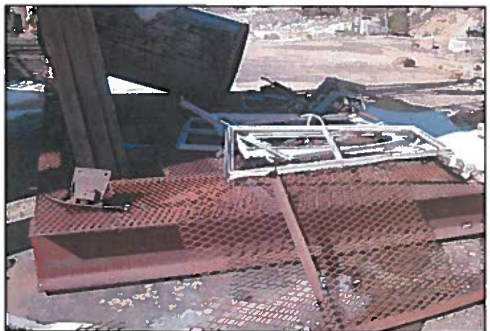
4. Franklin Shaft steel grate with refuse on top.