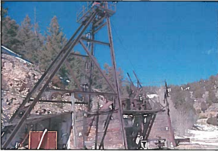
1. Freighter's Friend Shaft.