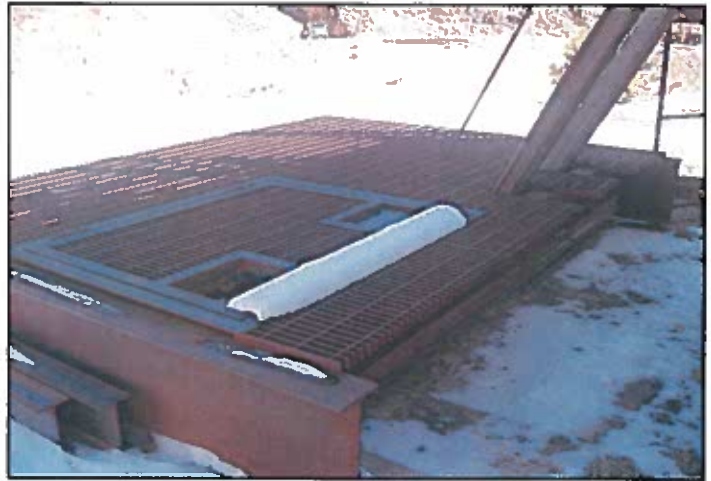
2. Steel grate on Freighter's Friend Shaft.