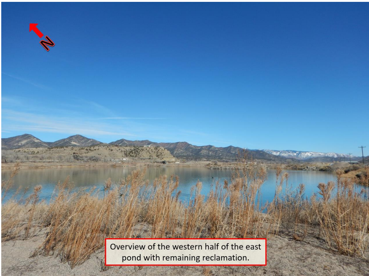
Overview of the western half of the east pond with remaining reclamation.