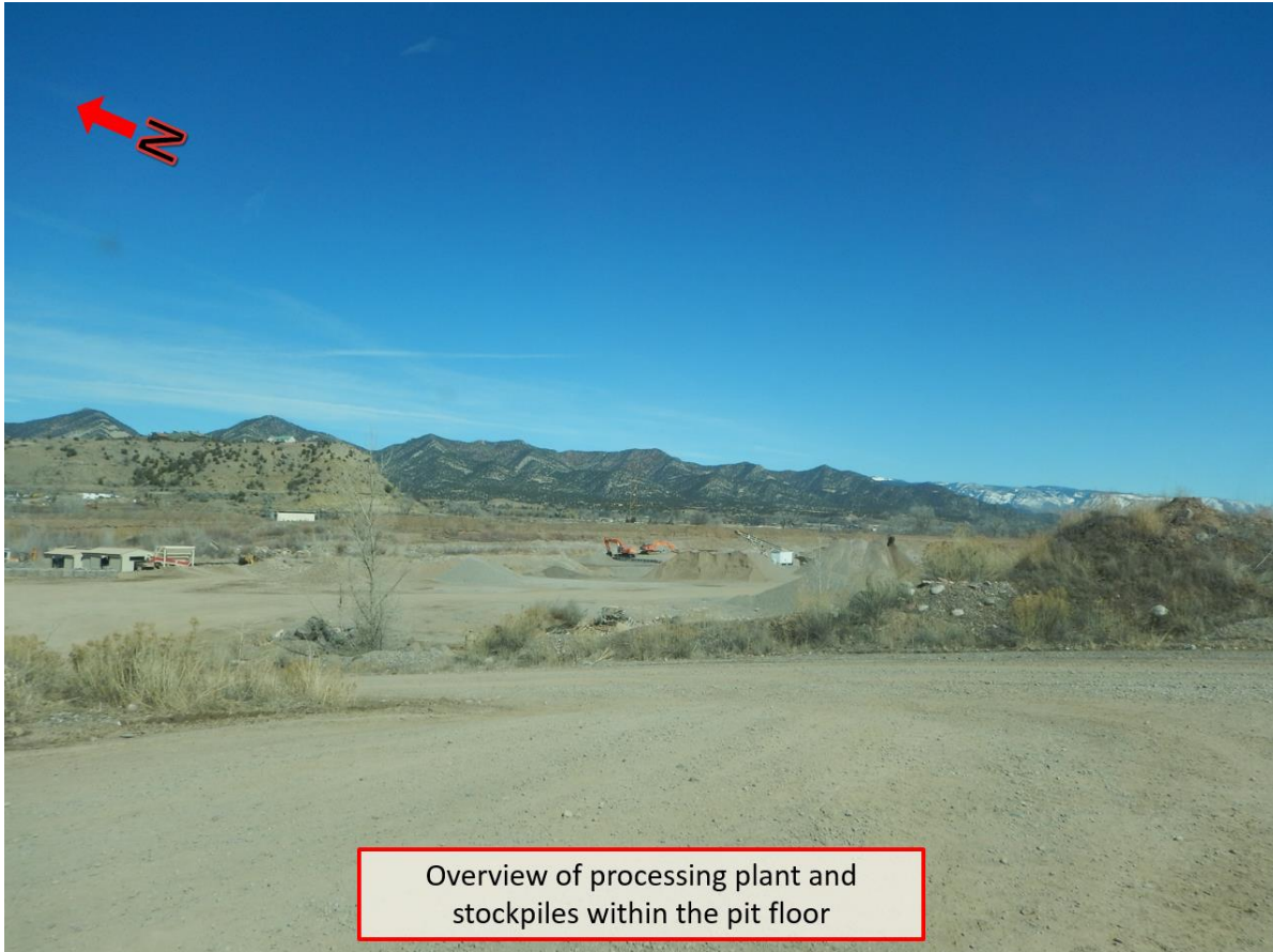
Overview of processing plant and stockpiles within the pit floor