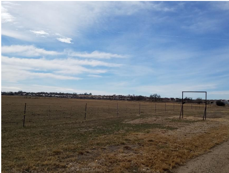
Figure 2. From the northwest corner of the site looking southeast.