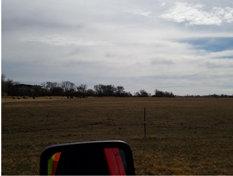
Figure 1. From the northwest corner looking east.