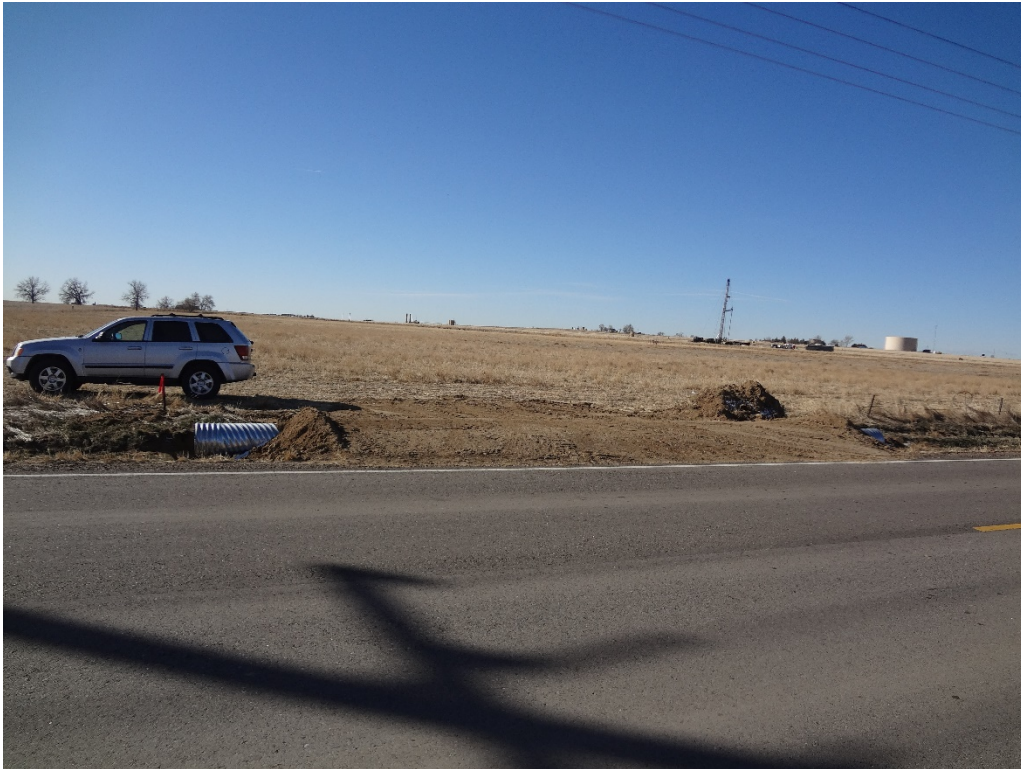
Ard Property Borrow 111 site entrance from WCR 50