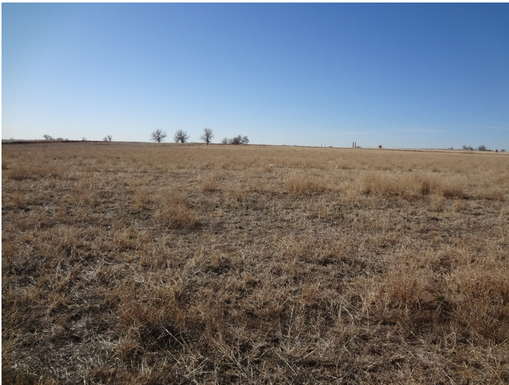
View of site from NE corner looking south