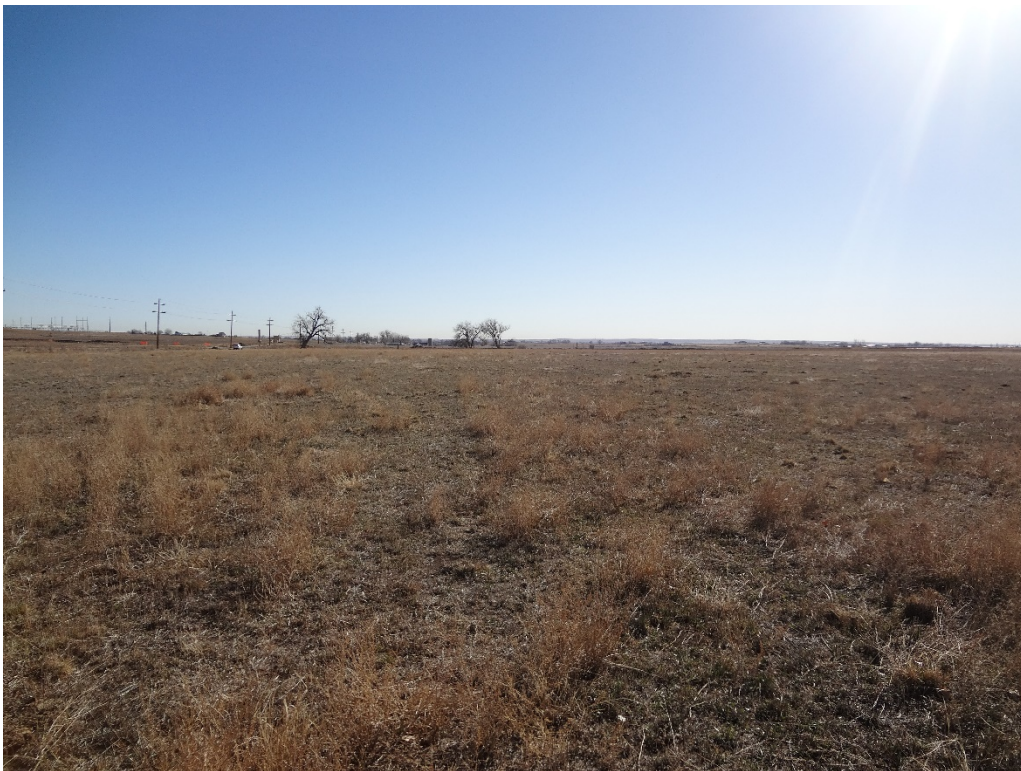
View of site from NW corner looking east