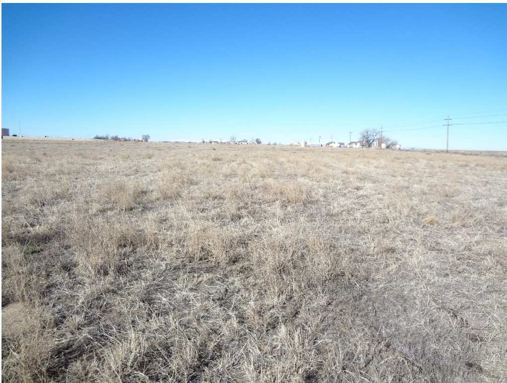
View of site from NE corner looking west