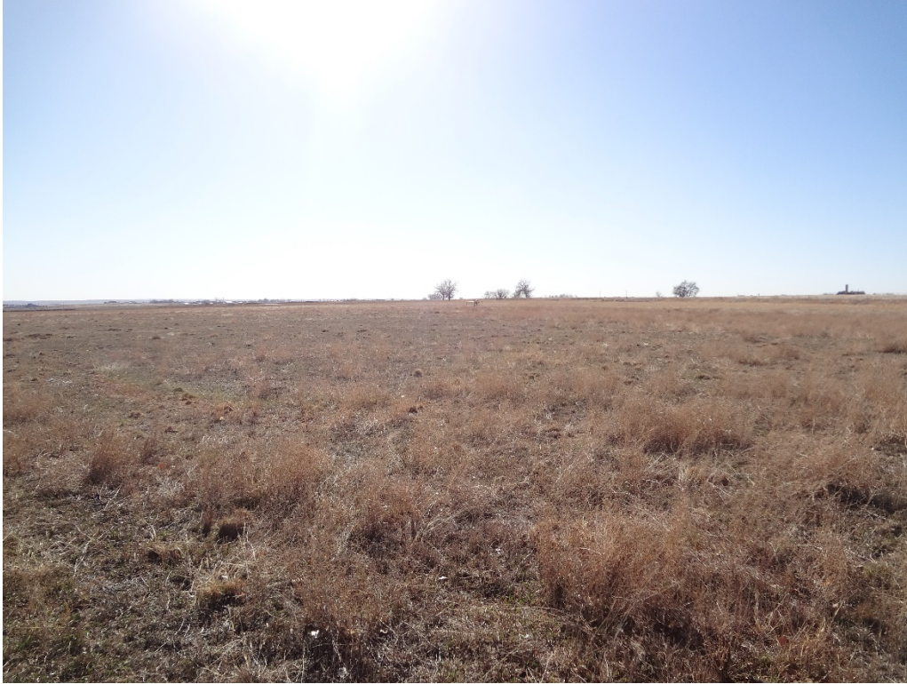
View of site from NW corner looking southeast