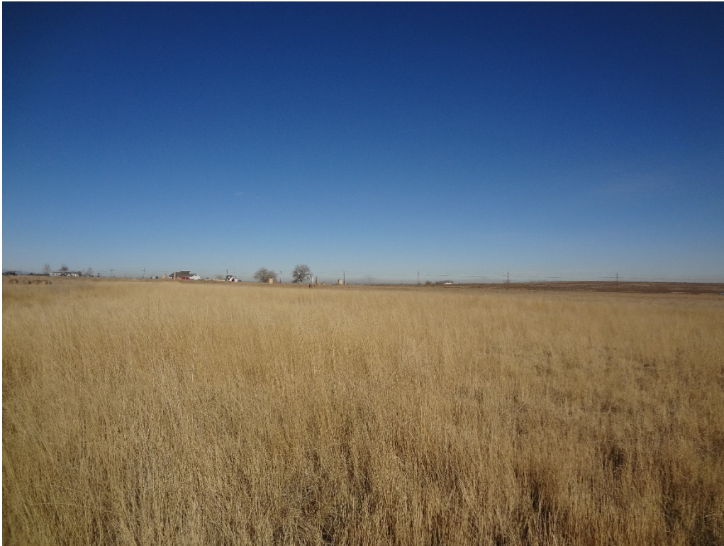
View of site from SE corner looking northwest