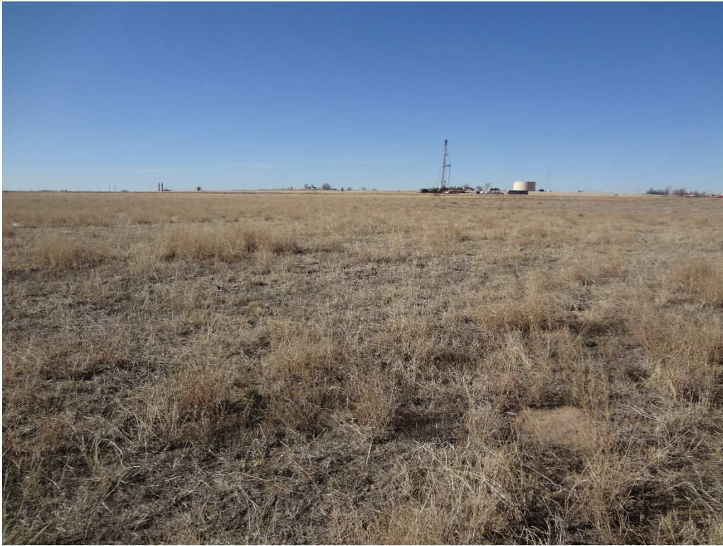
View of site from NE corner looking southwest