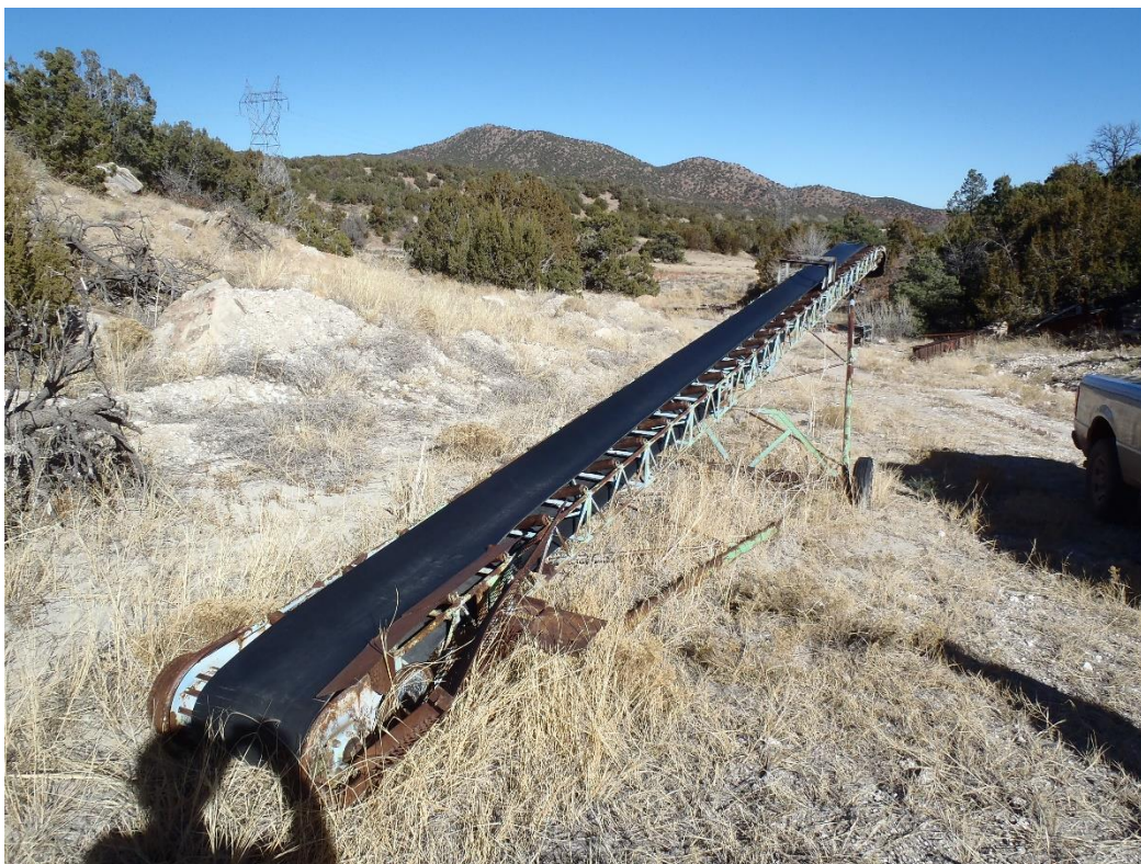
Photo 3. Conveyor.