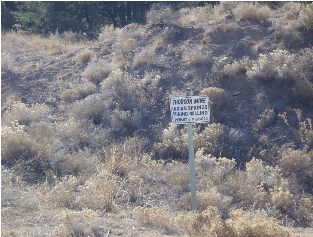
Photo 1. Permit sign.