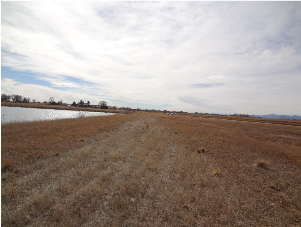
View of west shoreline from the NW corner looking south