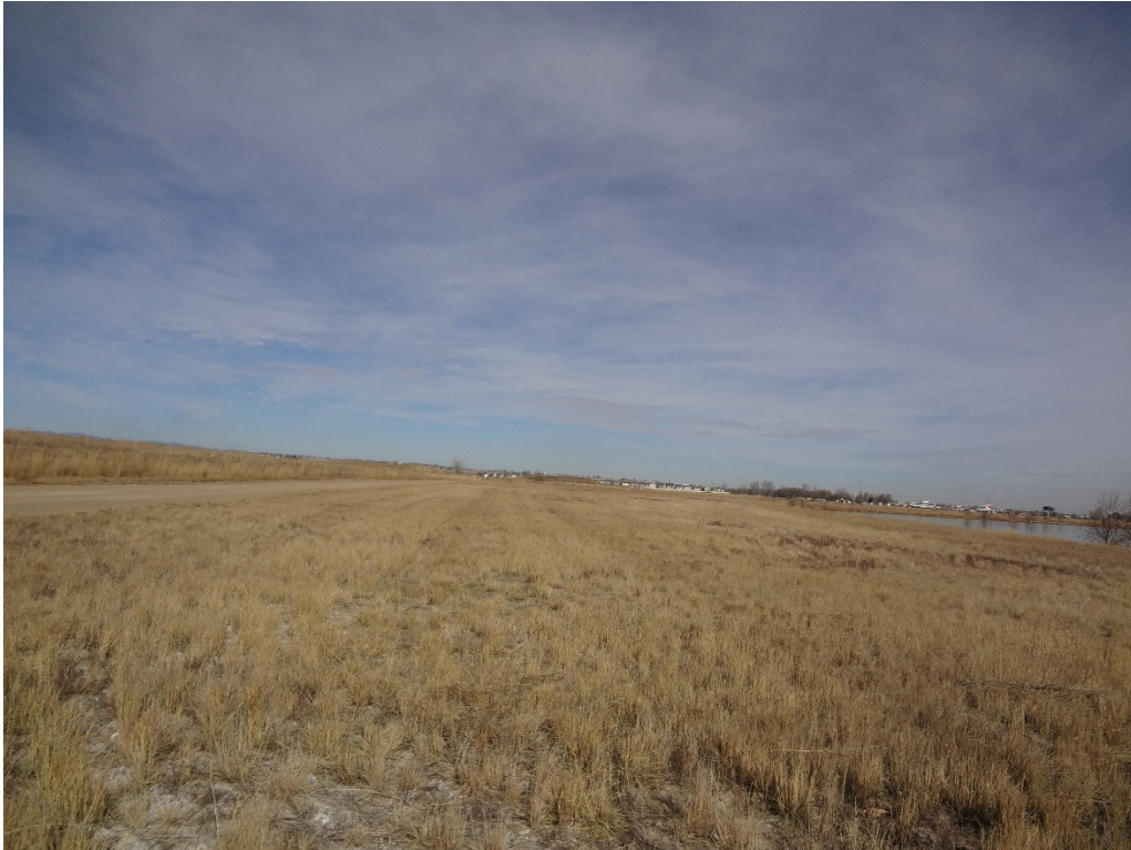
View of west shoreline from the SW corner looking north