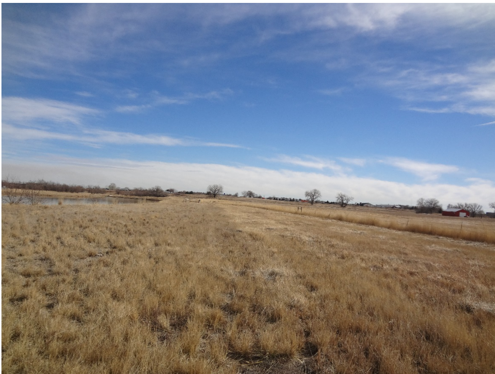
View of south shoreline from the SW corner looking north