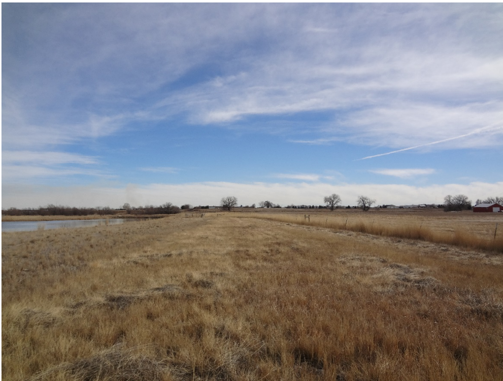
View of south shoreline vegetation looking east