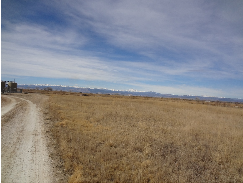
View of vegetation north of oil and gas road looking west