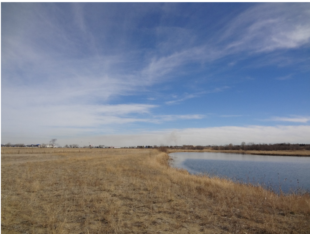
View of north shoreline from the NW corner looking east