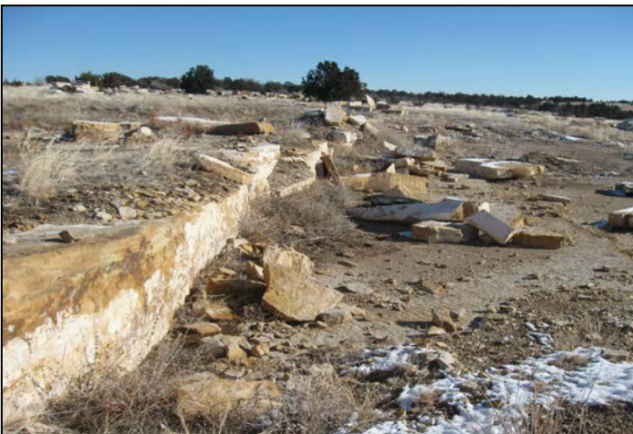
5. Typical bench in quarry.