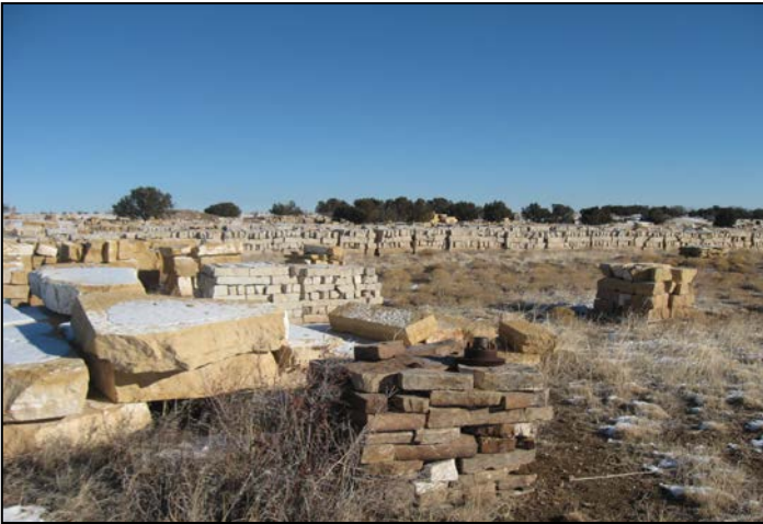
1. Material storage.