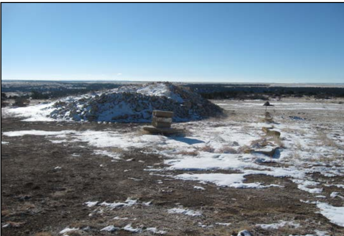
3. Product stockpile.