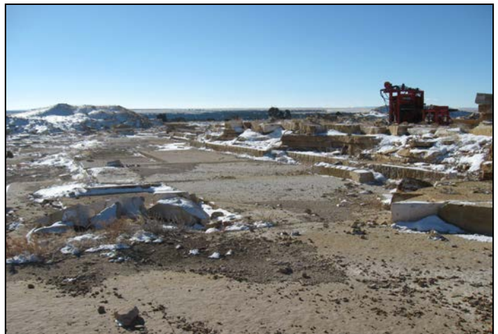
6. Quarry floor.