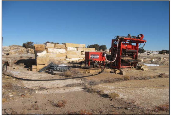
2. Processing area.