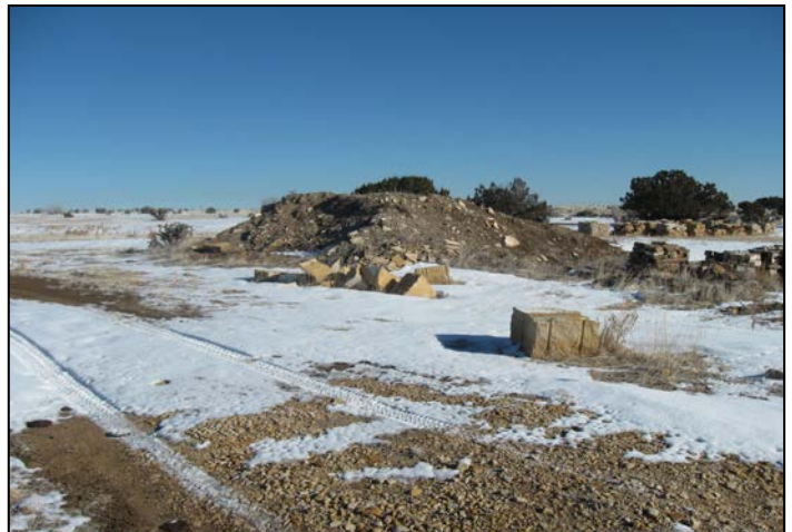
4. Topsoil stockpile.