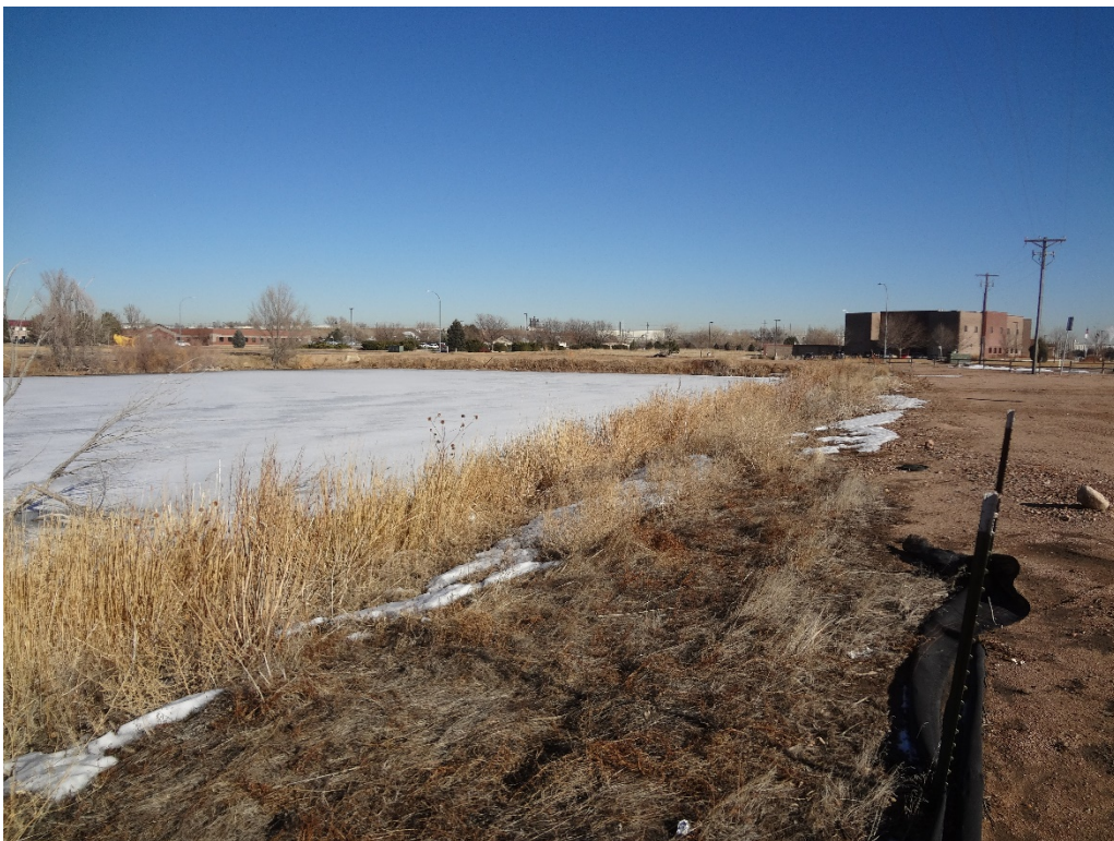
View of small pond located in east end of Cell E from SW corner of pond