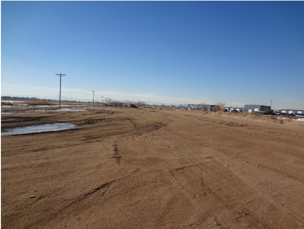
View of Cell E backfill area from east end of cell looking west