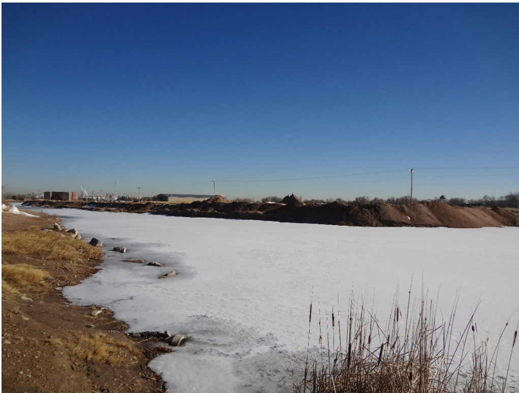
View of Cell E backfill progress looking SE from facilities area