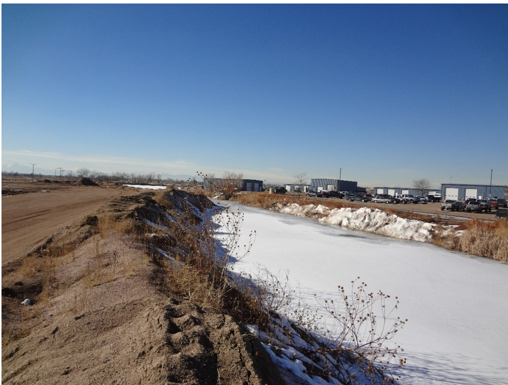
View of Cell E backfill progress looking west