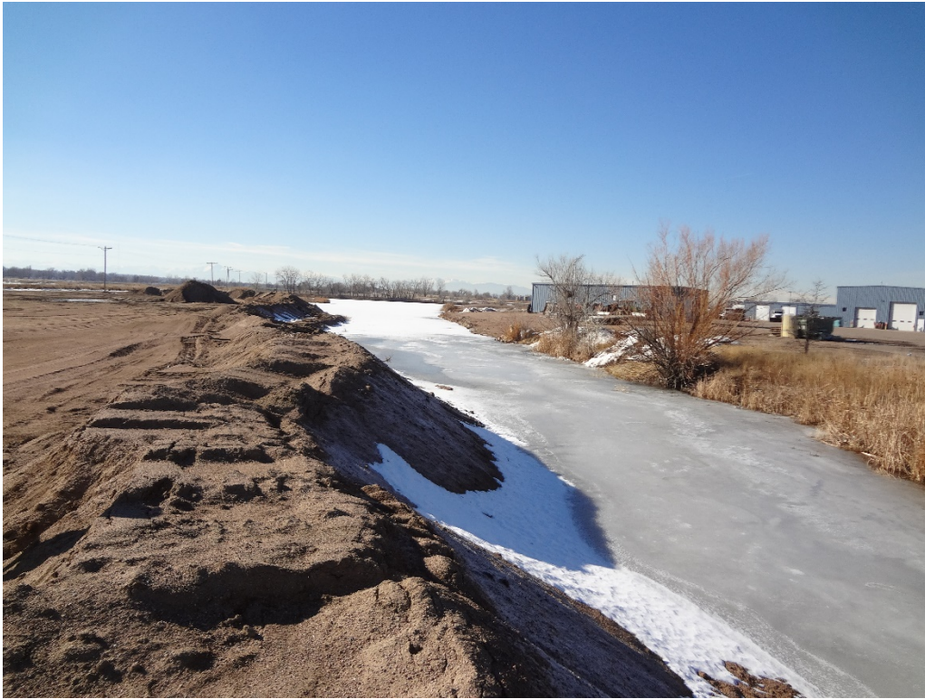
View of Cell E backfill progress looking west