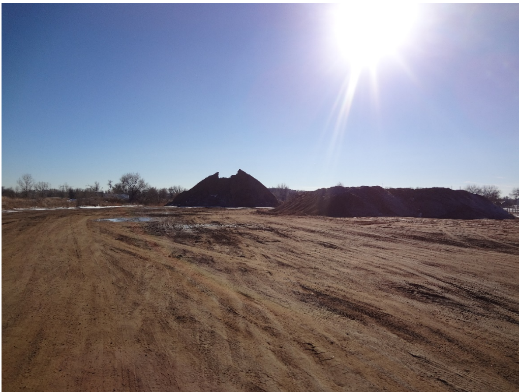
View of Cell D from NE corner looking south