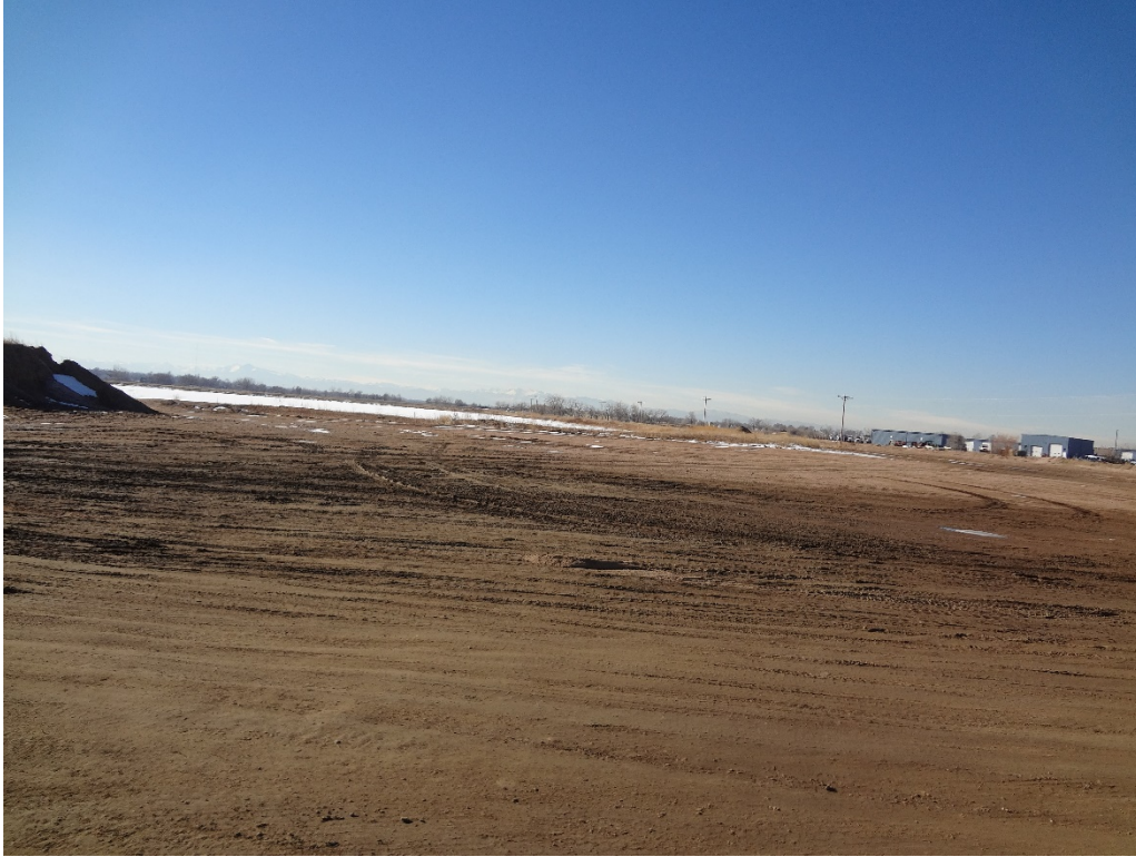
View of Cell D from NE corner looking west