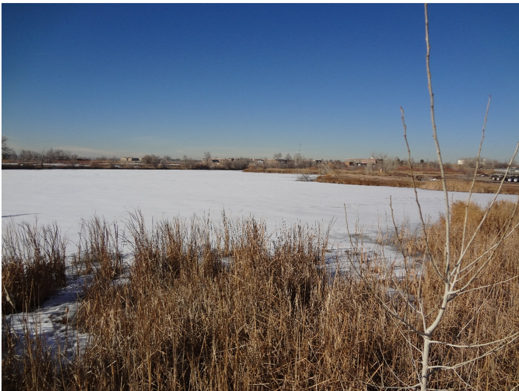
View of Cell B from SE corner of cell looking NW