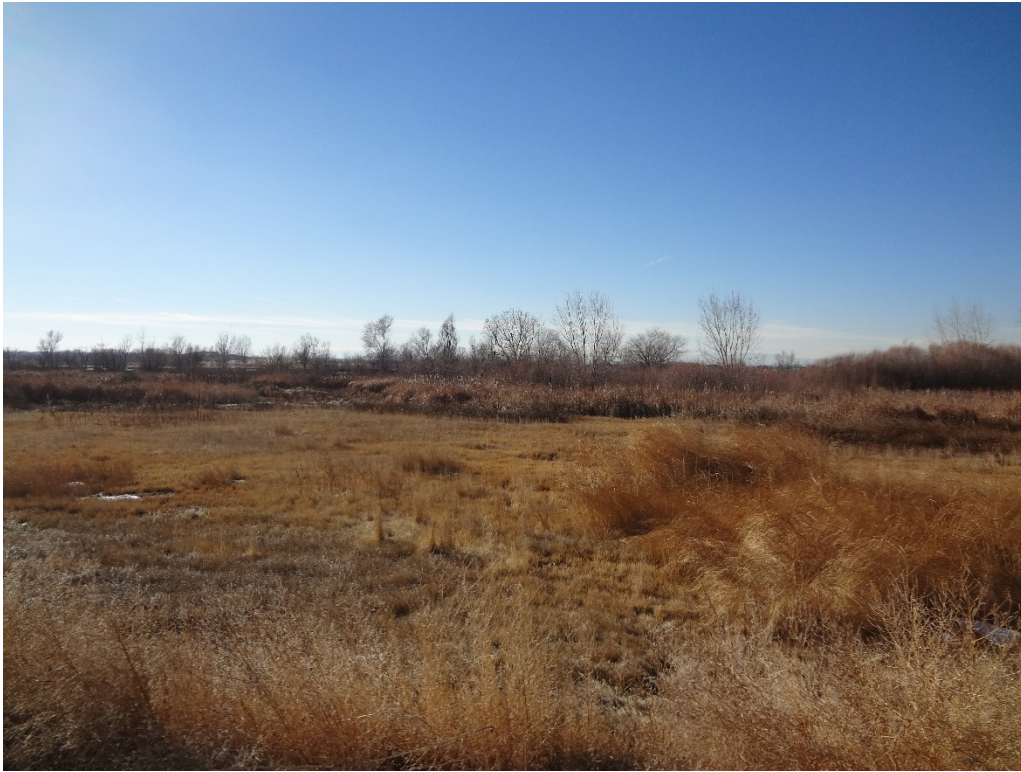
View of Cell B from NE corner of cell looking SW