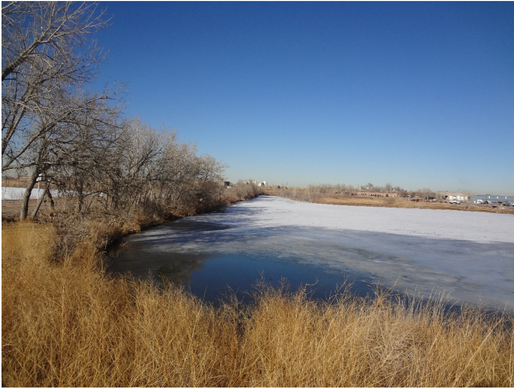
View of Cell B from SW corner of cell looking north