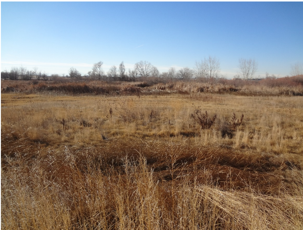
View of Cell B from east side of cell looking west