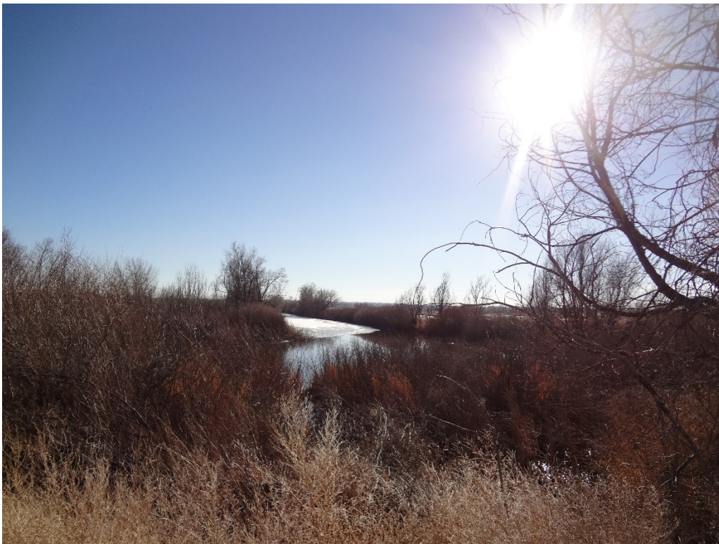
View of Cell B from north end of cell looking south