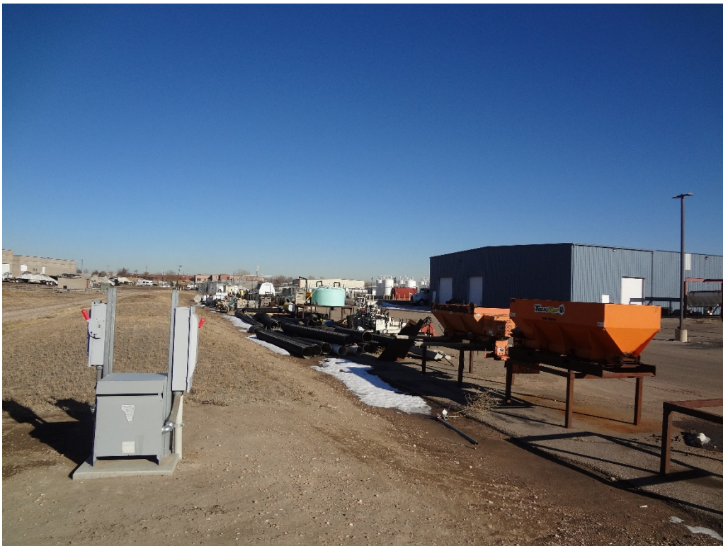
View of Cell A from NW corner of facility area looking NW