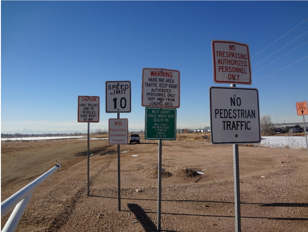
Geisert Pit mine sign