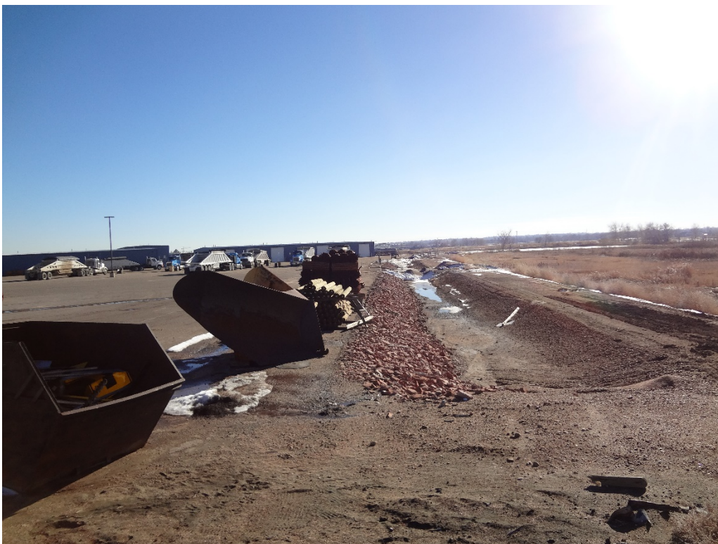
View of Cell A from NW corner of facility area looking south