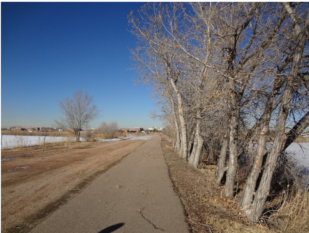
View of path in Cell A from south end of path looking north