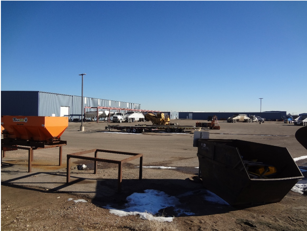
View of Cell A from NW corner of facility area looking east