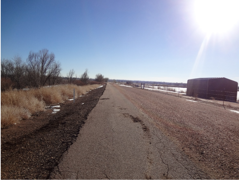
View of path in Cell A from north end of path looking south