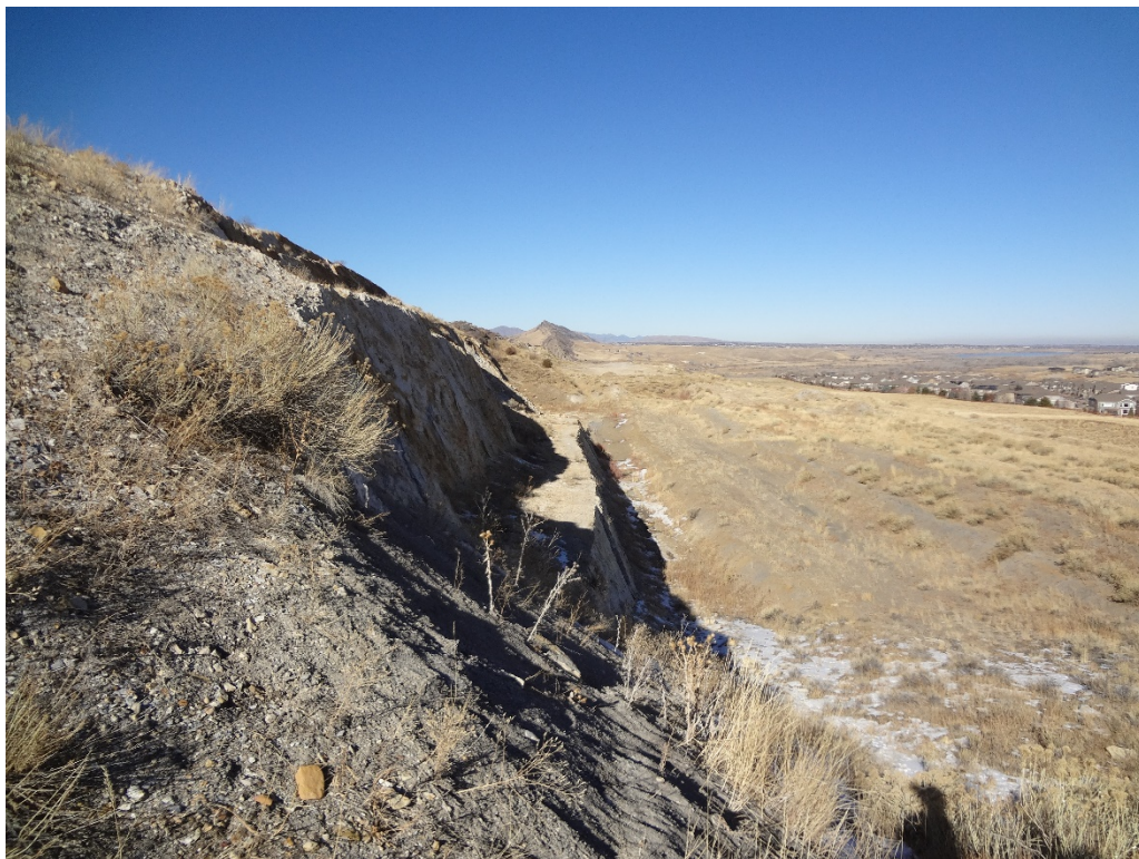
View of lower clay deposits in north mining area looking south