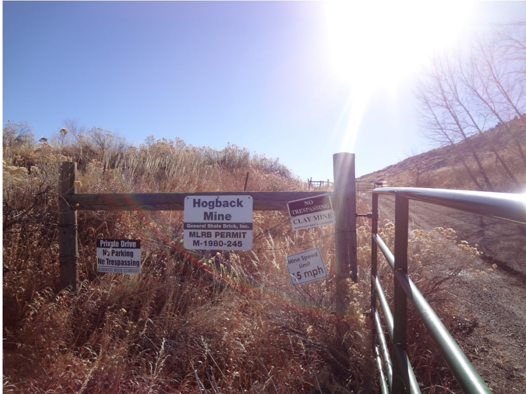
Hogback Mine sign