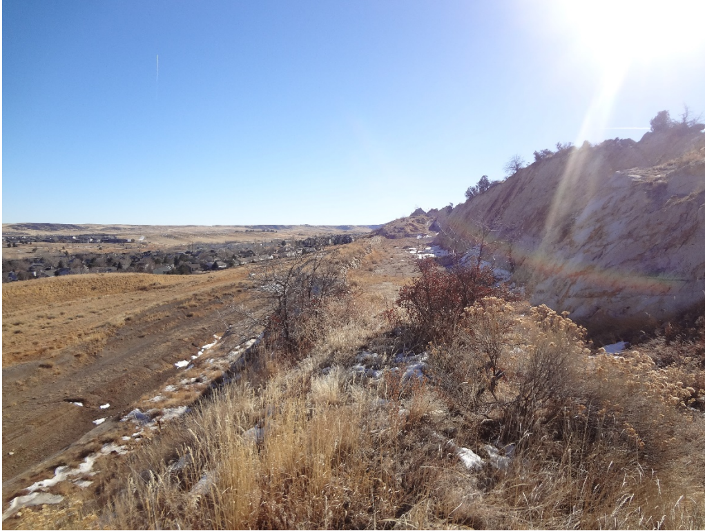
View of upper clay deposits in north mining area looking south