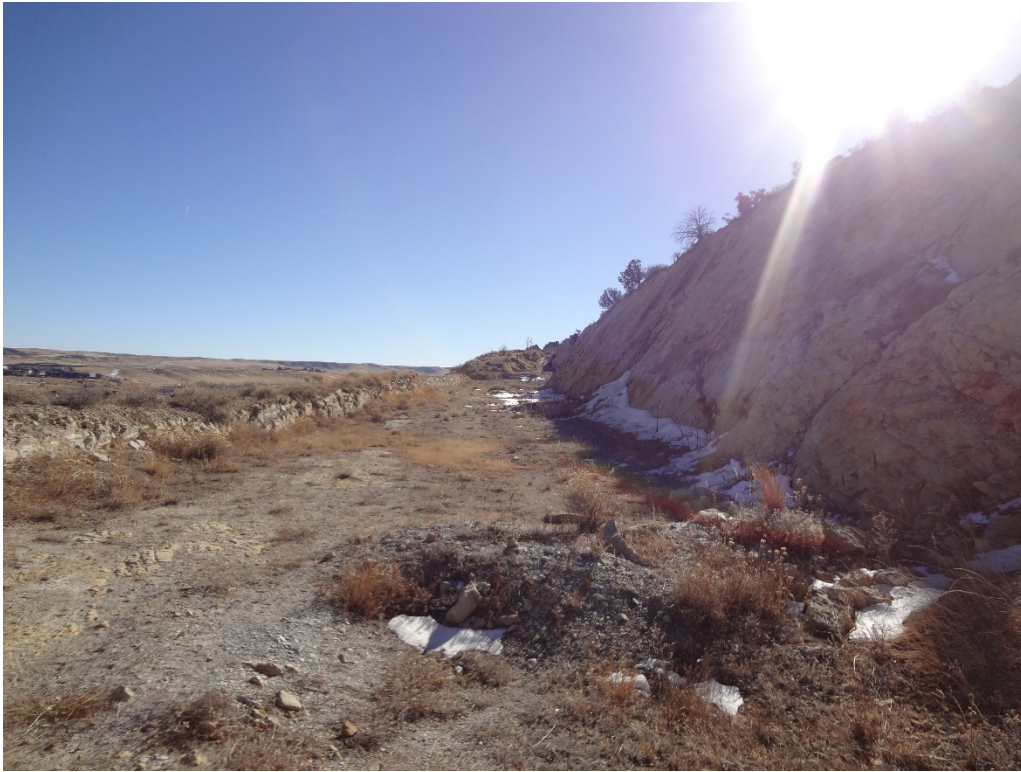
View of upper clay deposits in north mining area looking north