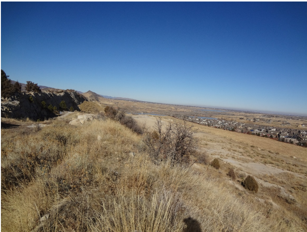
View of stockpile area from the north mining area looking south