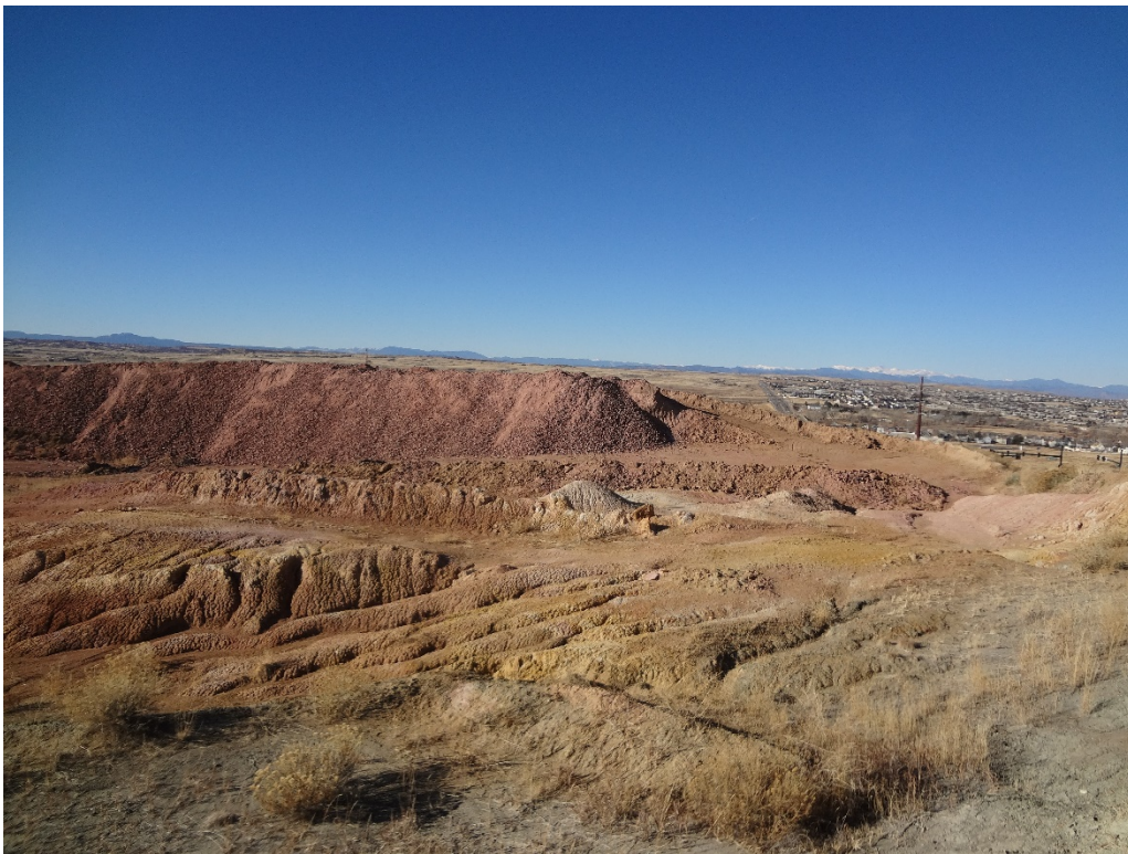
View of pit from the northeast corner of the site looking west