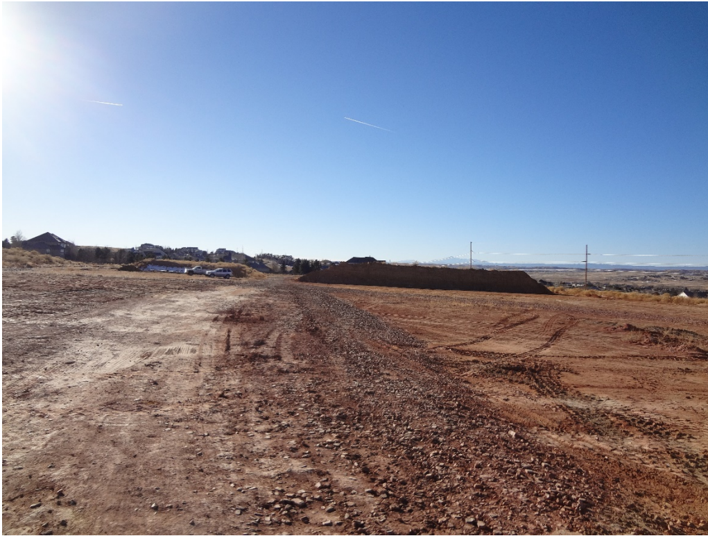
View of stockpile area from north end of pad looking south