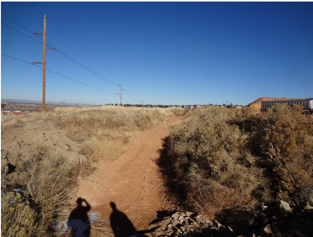
View of stormwater pond located between stockpile pad and topsoil berm