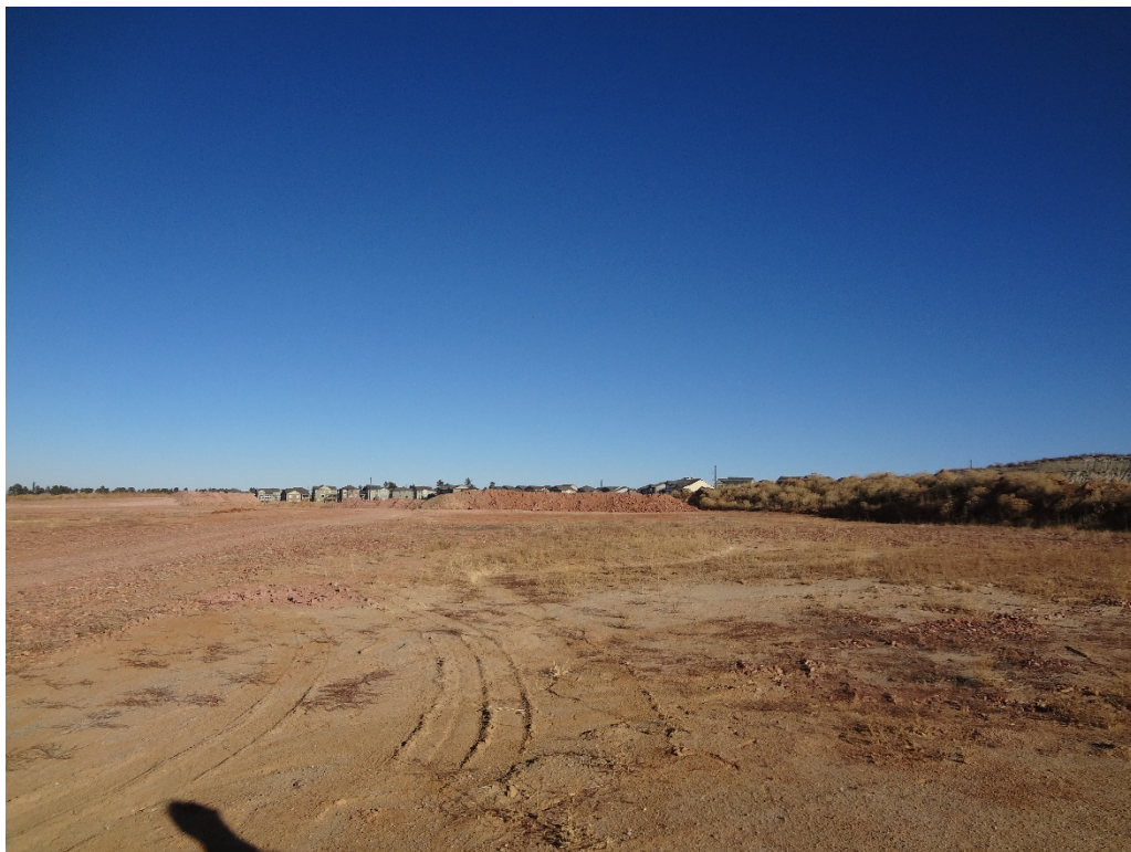
View of stockpile area from south end of pad looking north