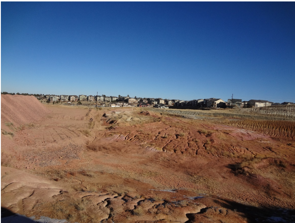
View of pit from north end of pad looking north