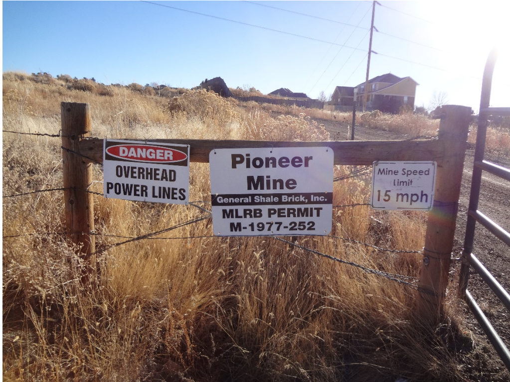
Pioneer Mine sign