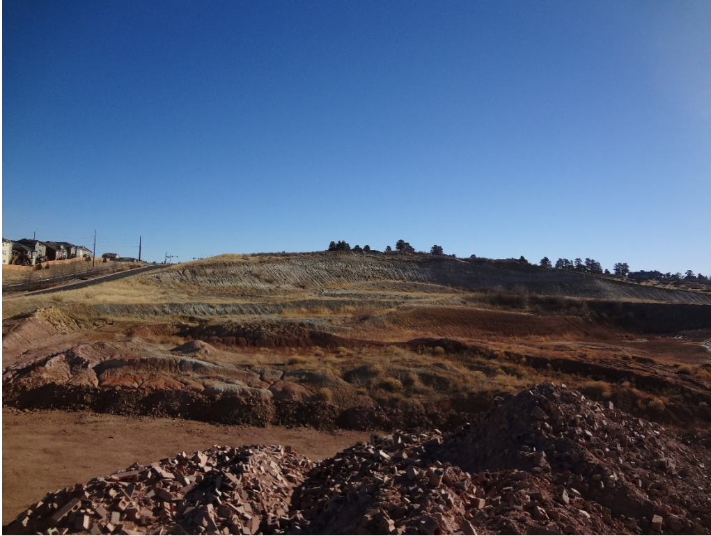
View of pit from the northwest corner of the site looking east