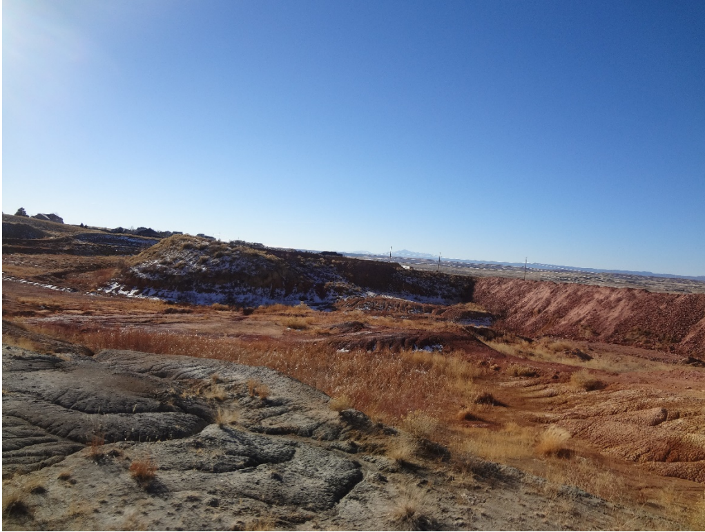
View of pit from the northeast corner of the site looking southeast