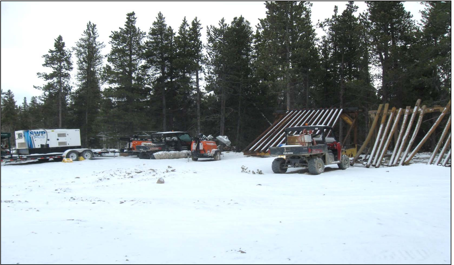
5. Equipment located outside of permit boundary.