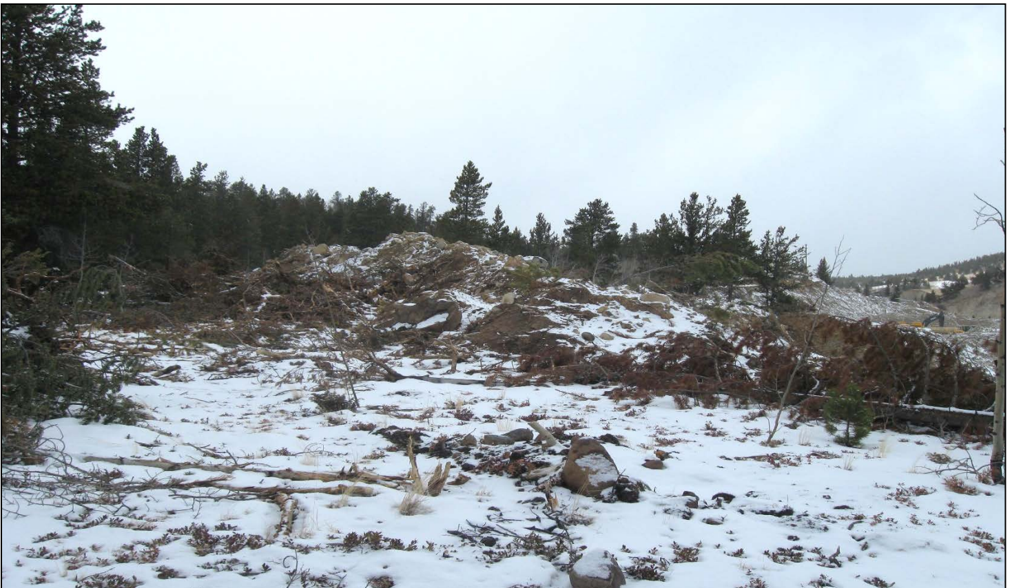
8. Topsoil cleared from areas affected outside of permit boundary.