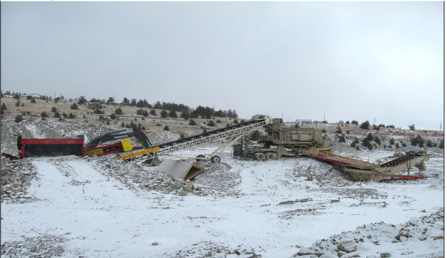
2. Processing equipment.