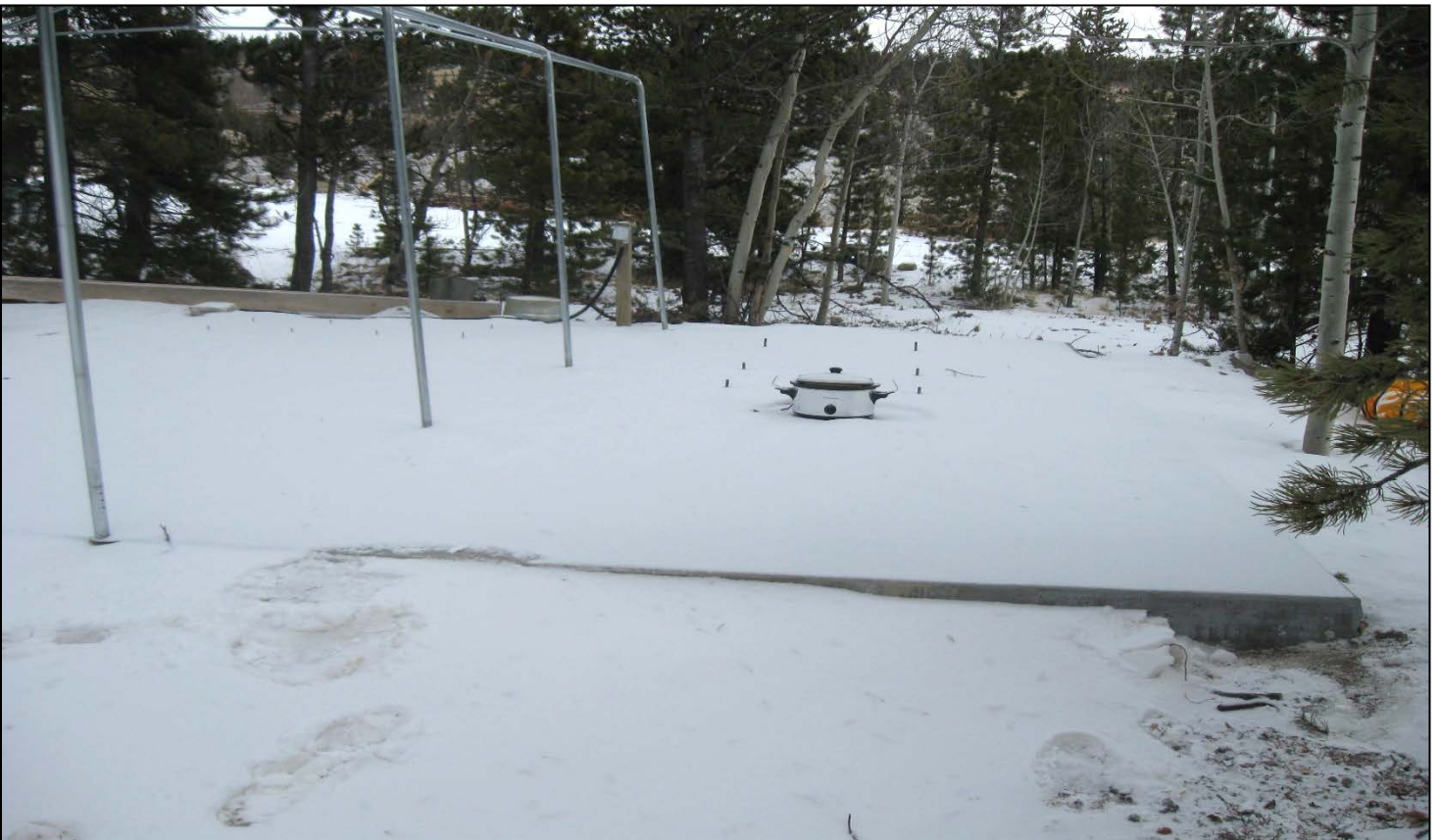
4. Concrete pad located outside of permit boundary.