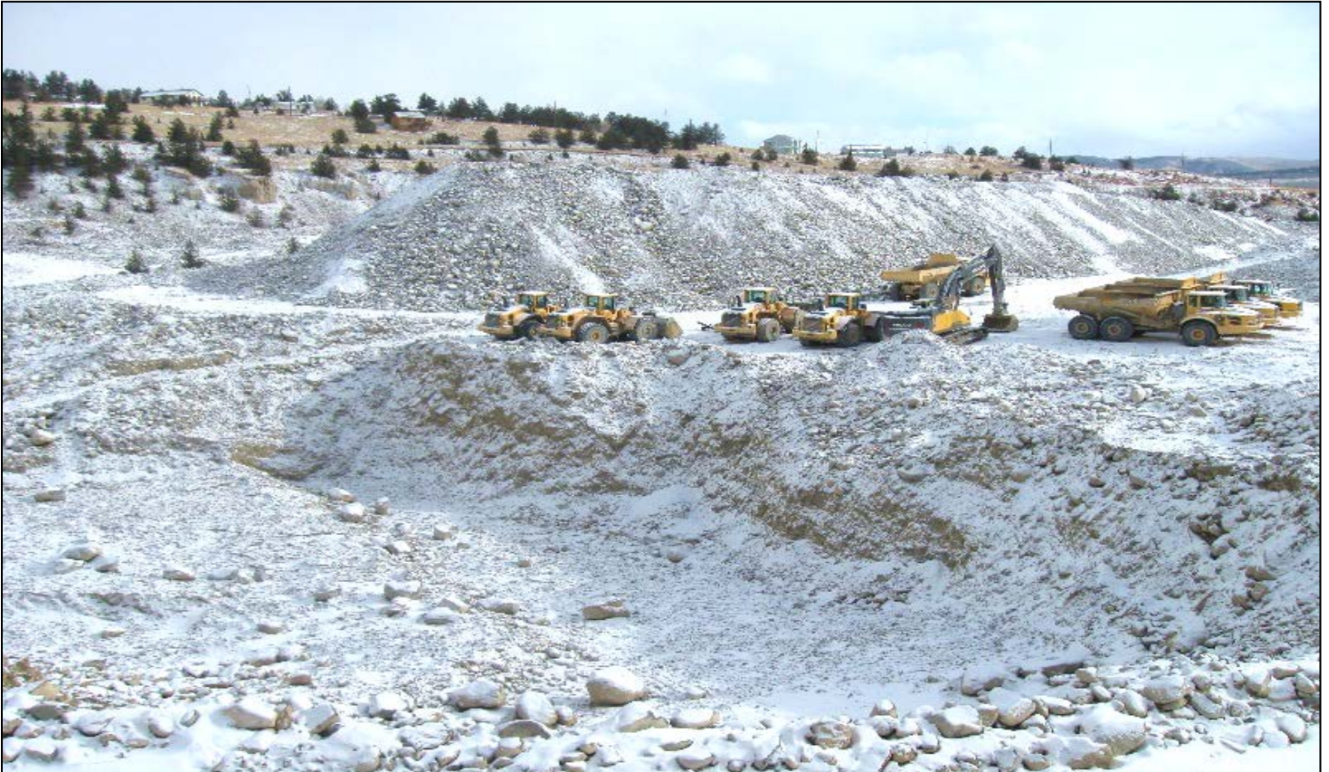
1. Overview of pit.