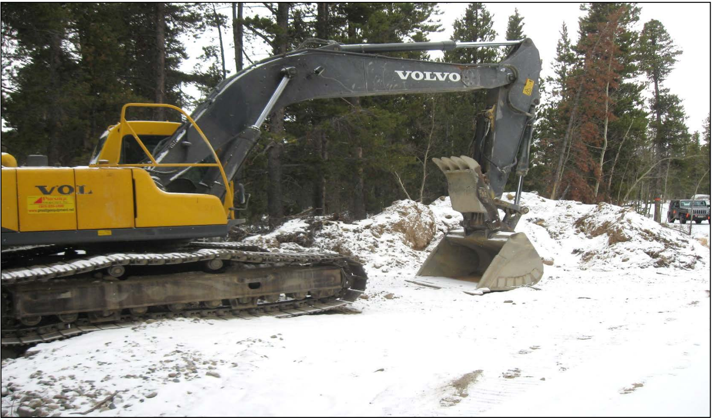
7. Equipment located outside of permit boundary.