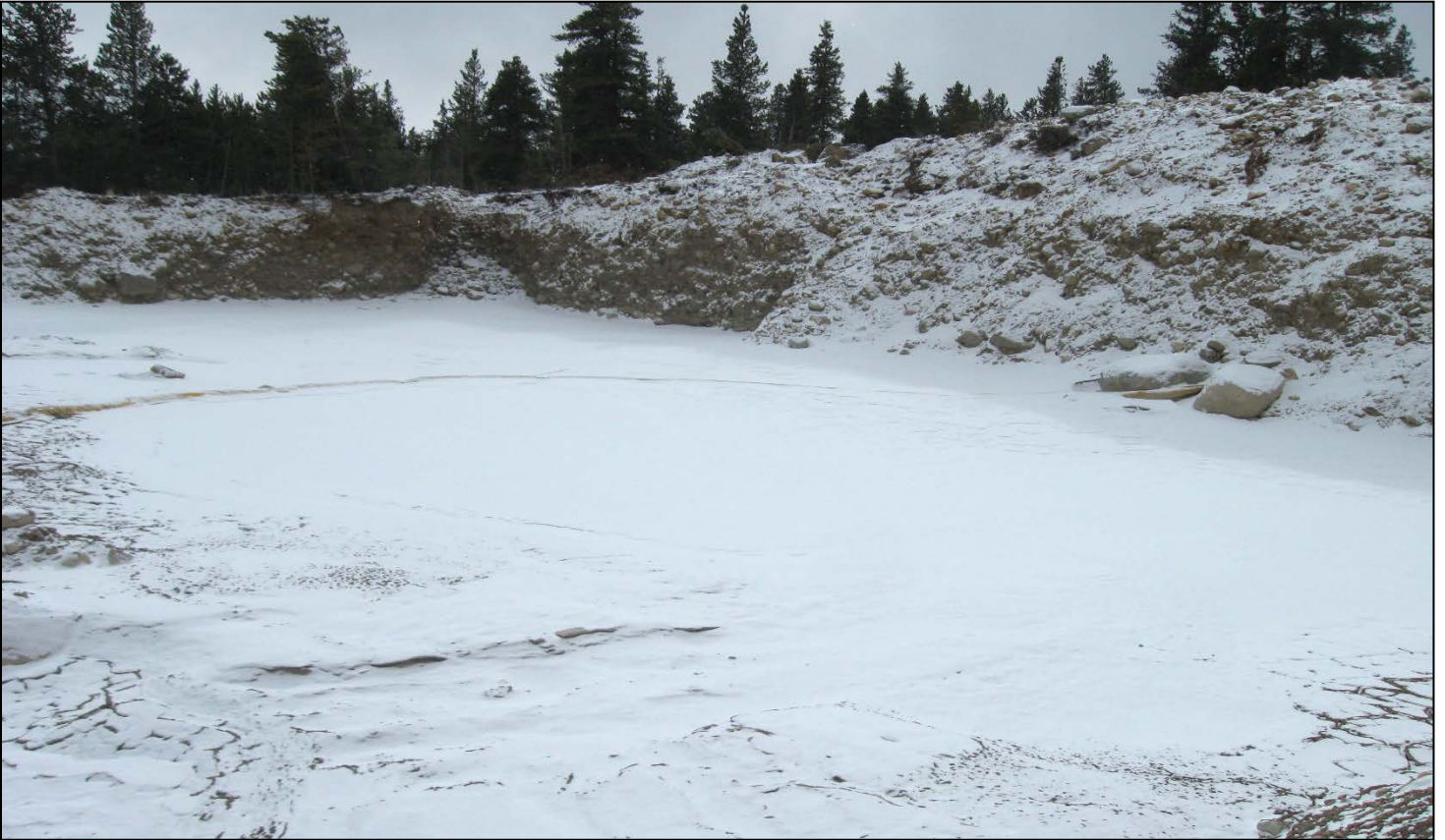
3. Settling pond.