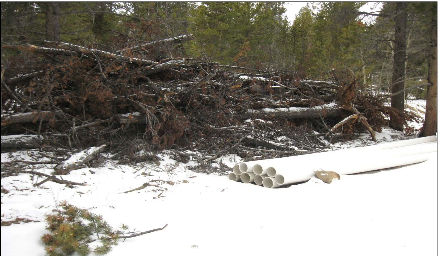
6. Trees removed outside of permit boundary.