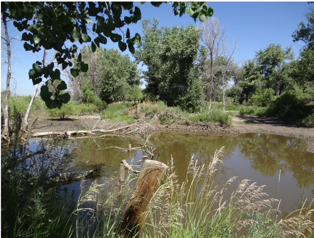
View of 30 foot berm gap looking east