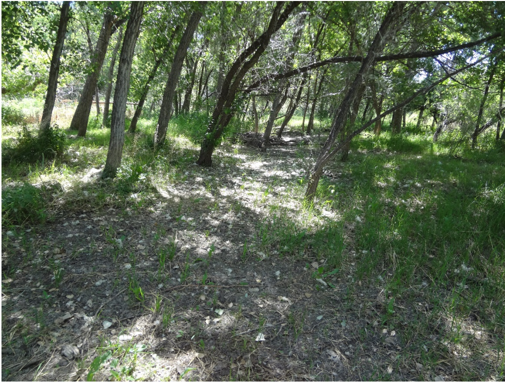
View of northern portion of 15 acre area south of VomBaur residence