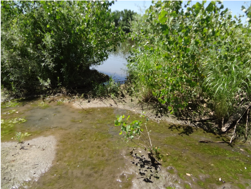
View of one of the breach areas observed east of the repaired berm section