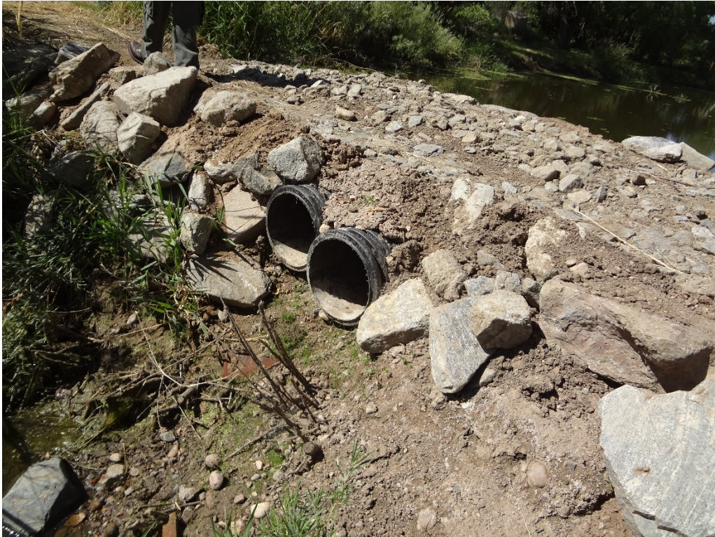
Repaired land bridge south of VomBaur residence