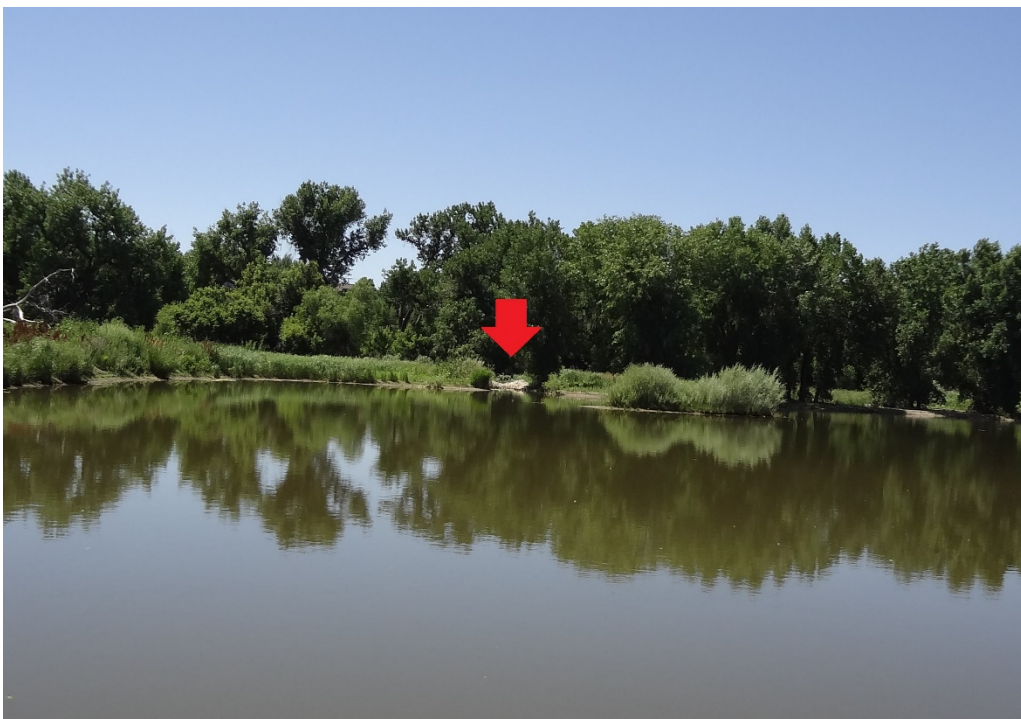
View of spillway in the SE corner of Cell 3 looking south