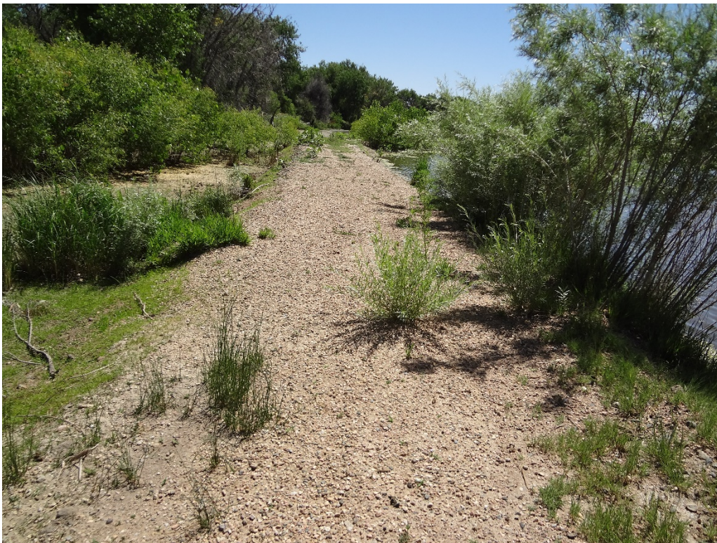
View of 2015 repaired section of the north bank of Cell 3 looking east