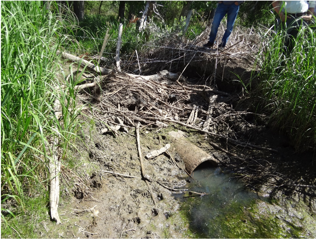
View of culvert on VomBaur property north of Cell 3