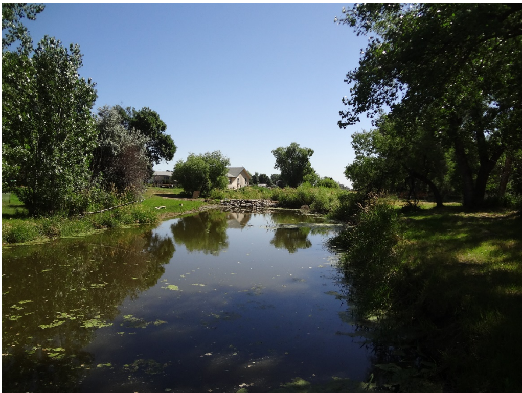
View of west pond looking west from land bridge