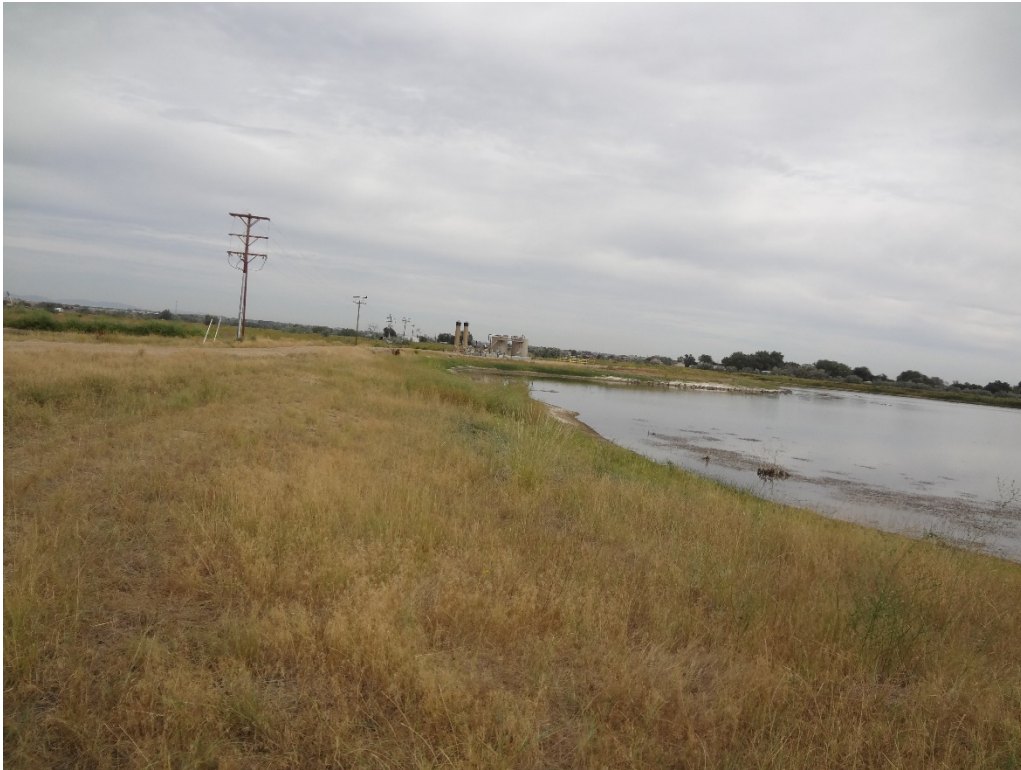
View of CW3 west shoreline from SW corner looking north