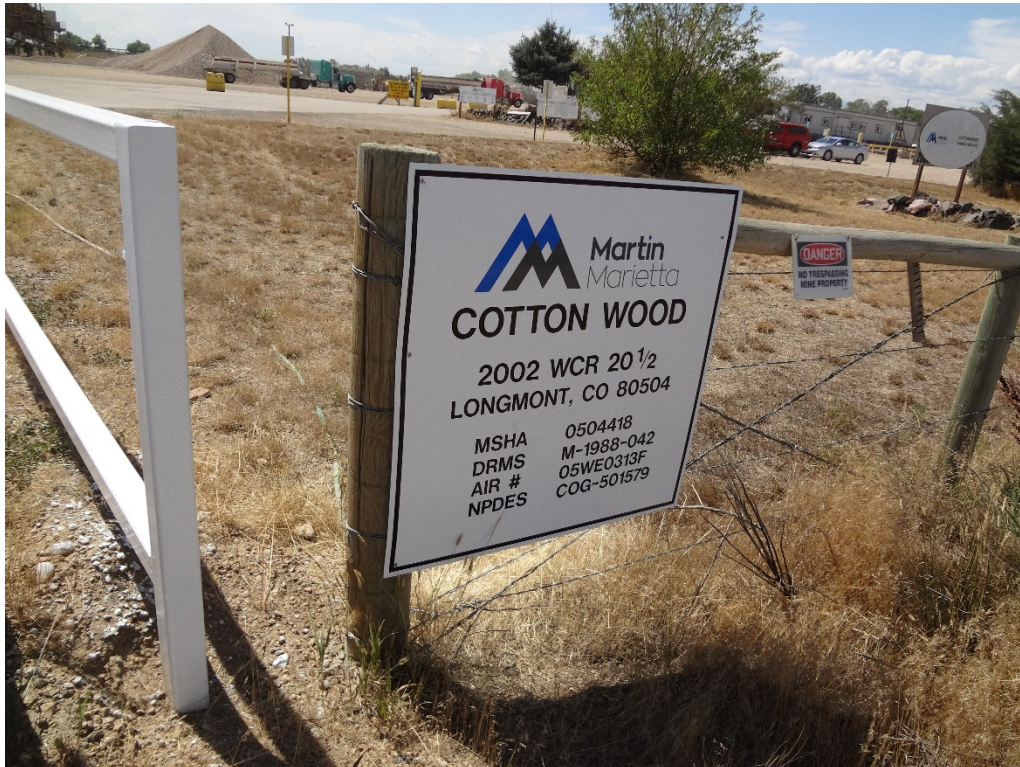
Cottonwood mine sign