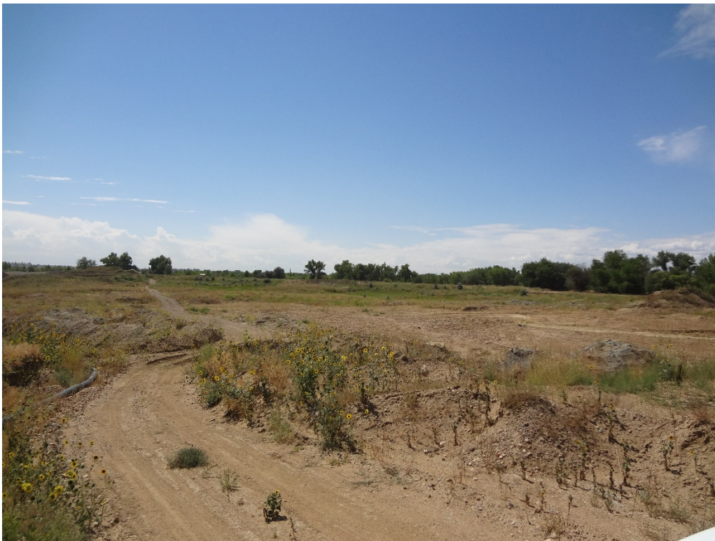
View from NW corner of CW1 looking south