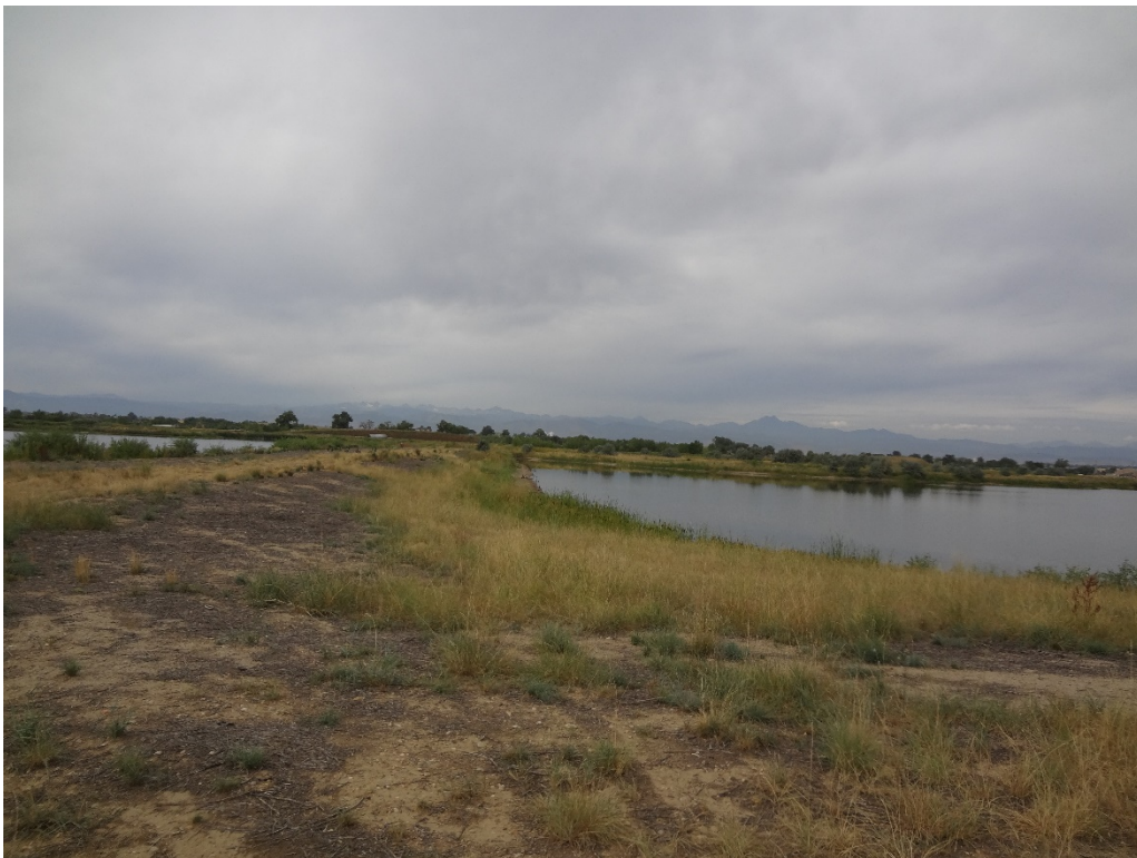
View of CW2 south shoreline from SE corner looking west