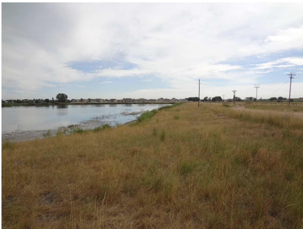
View of CW3 south shoreline from SW corner looking east