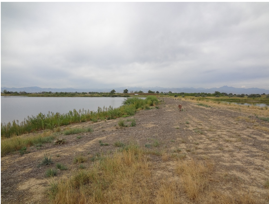
View of CW1 north shoreline from NE corner looking west