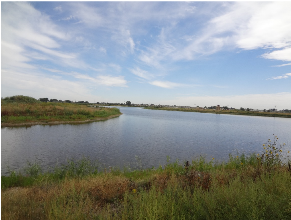
View of CW1 from south shoreline looking north