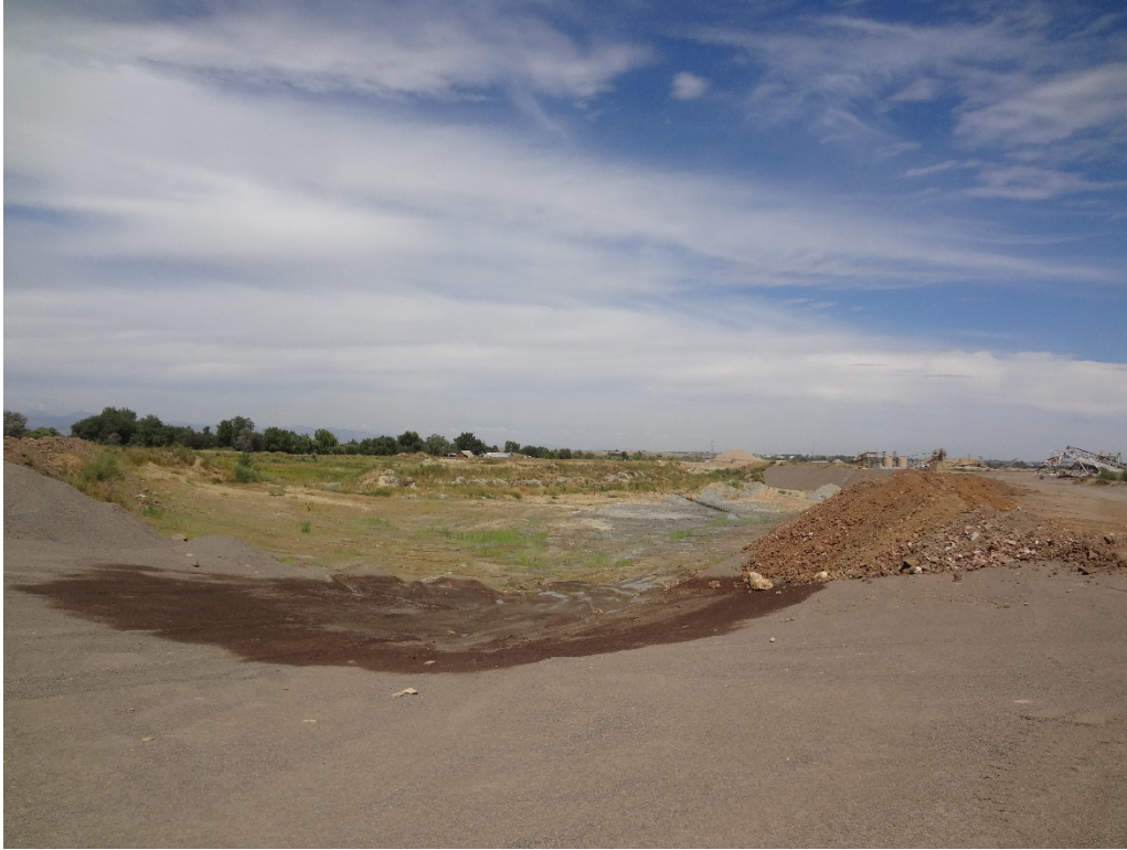
View of SE corner of CW5 looking at slope backfill with imported material