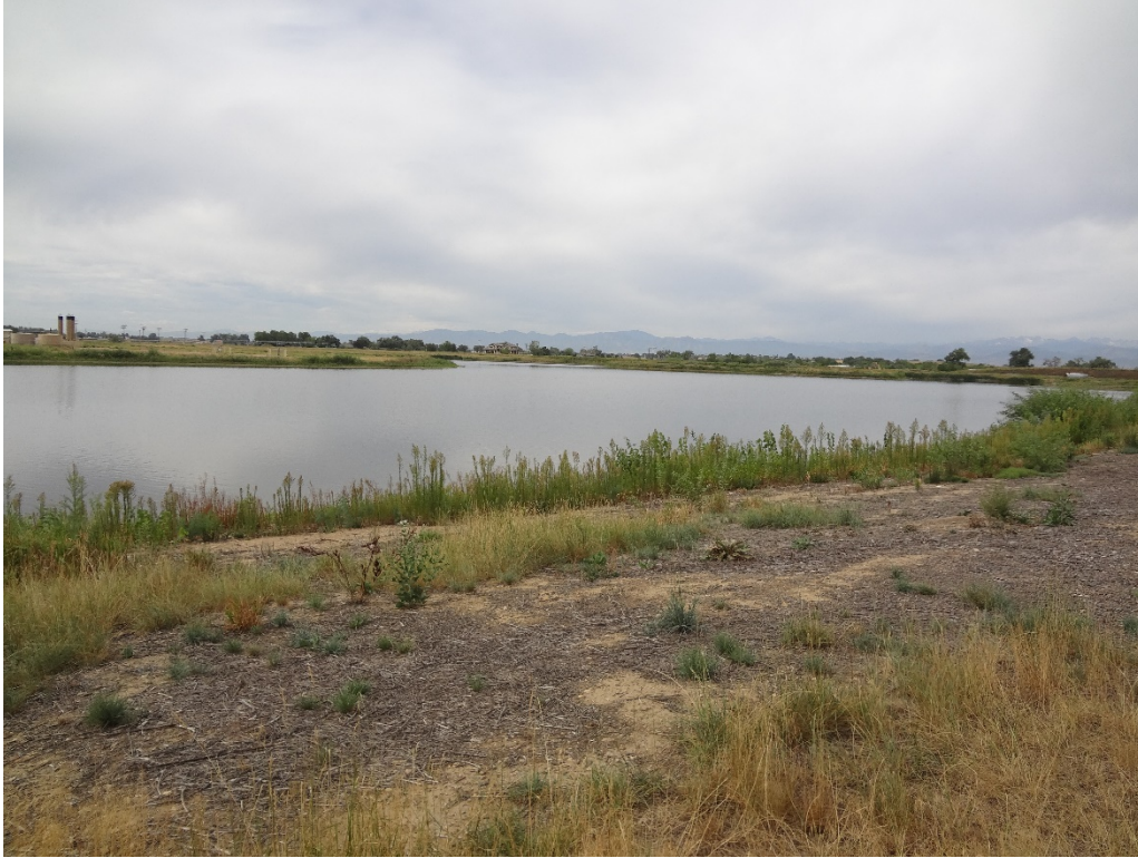
View of CW1 from NE corner looking SW