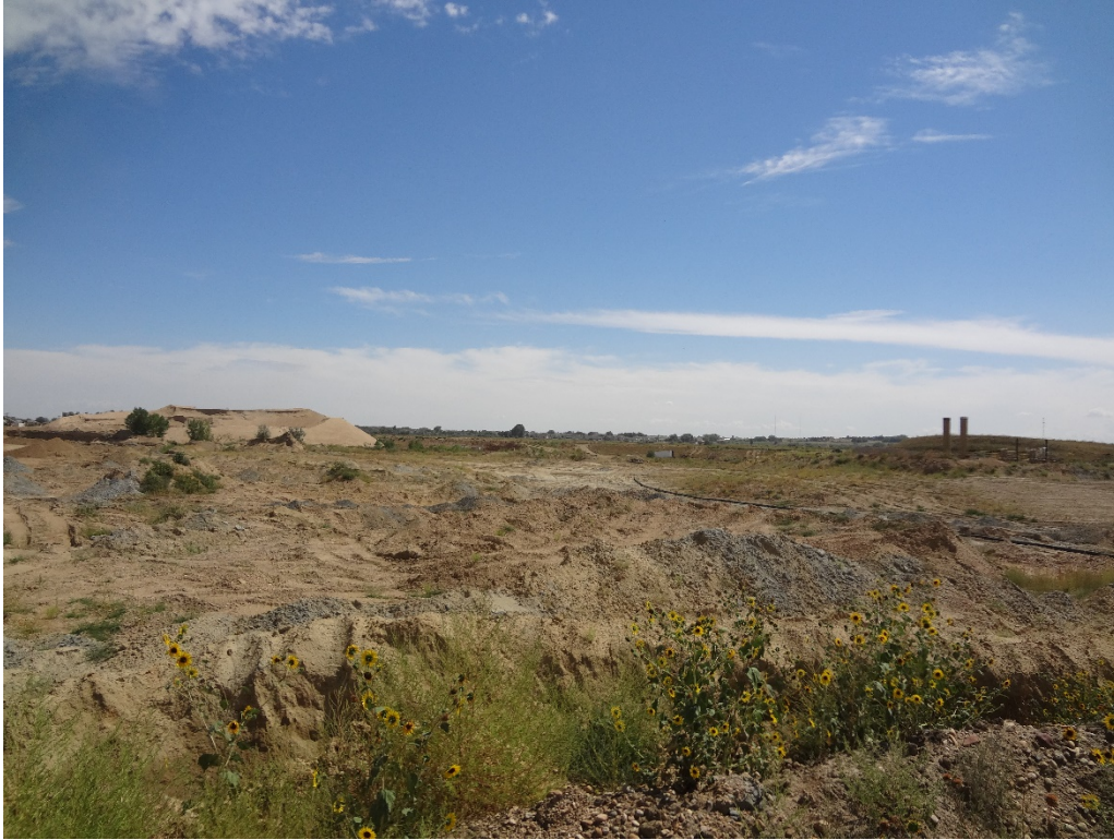
View from NW corner of CW1 looking east