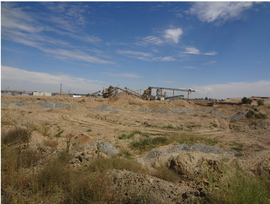
View from NW corner of CW1 looking NE