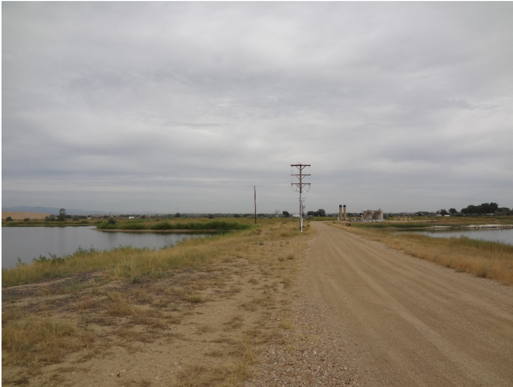
View of CW2 west shoreline from SE corner looking north