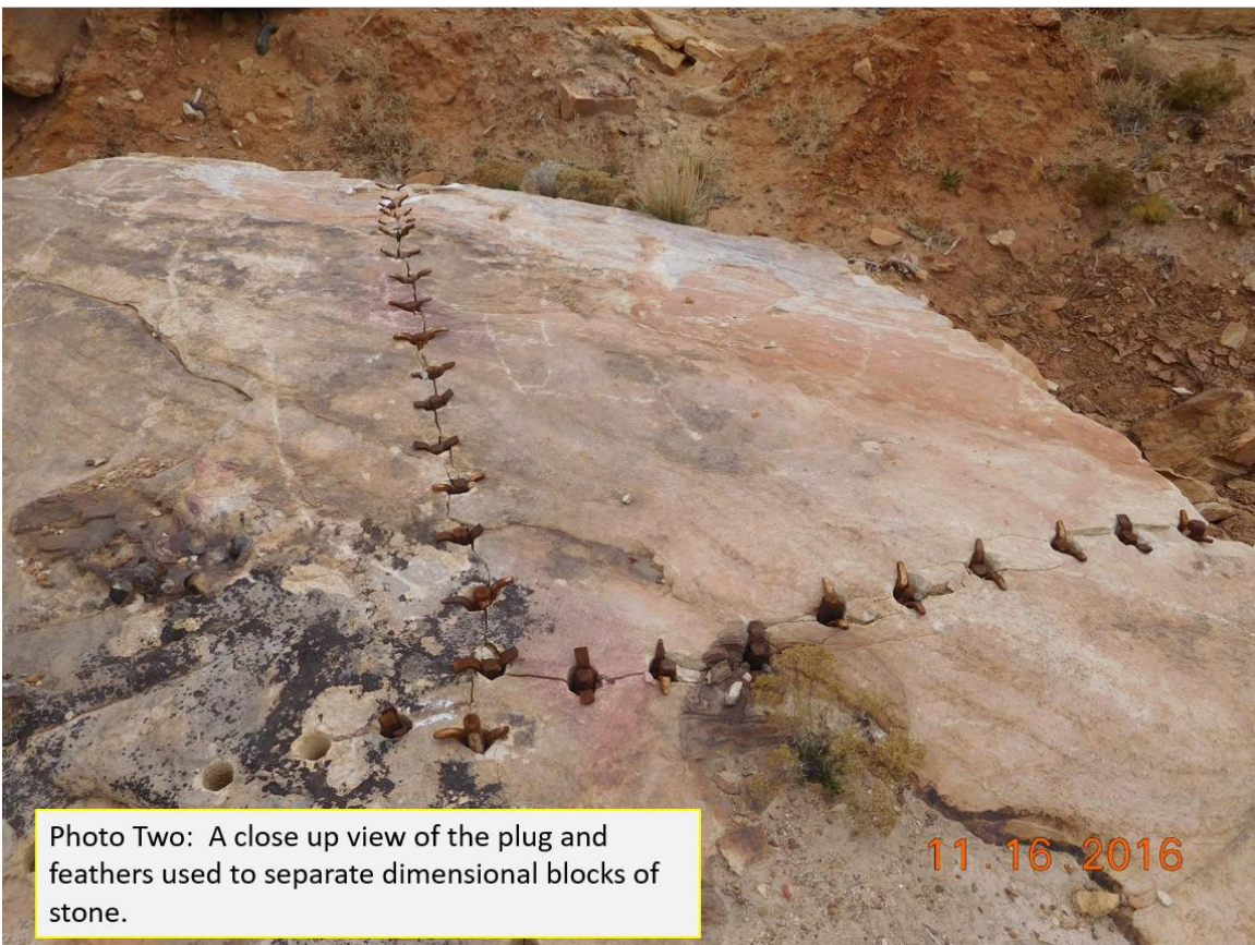
Photo Two: A close up view of the plug and feathers used to separate dimensional blocks of stone.