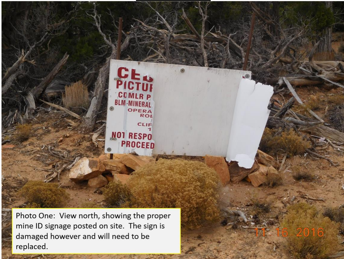
Photo One: View north, showing the proper mine ID signage posted on site. The sign is damaged however and will need to be replaced.