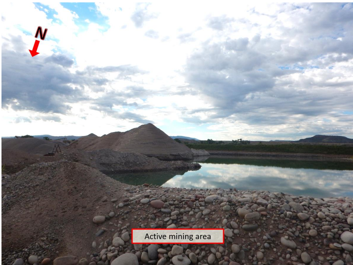
Active mining area