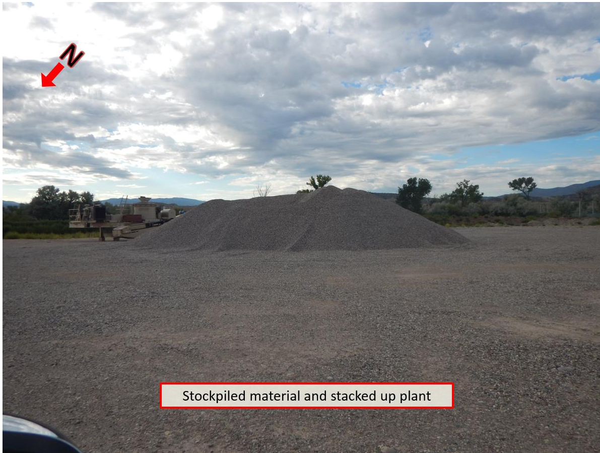
Stockpiled material and stacked up plant