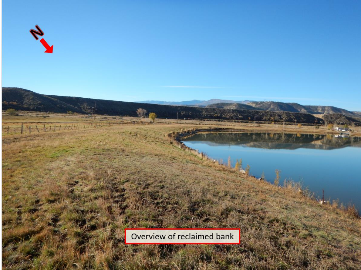
Overview of reclaimed bank