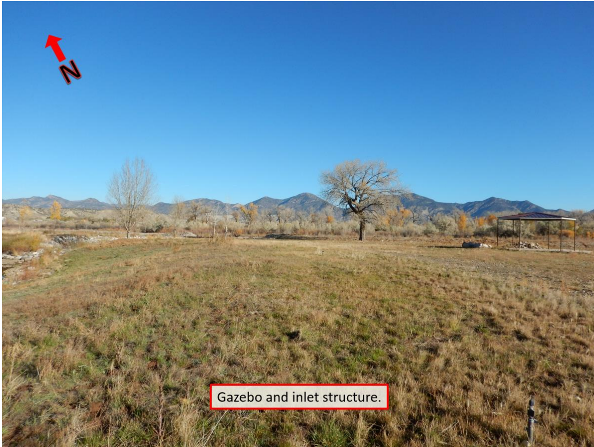
Gazebo and inlet structure.