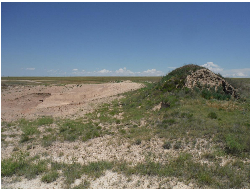
Mining face (left) and topsoil stockpile (right); looking east.