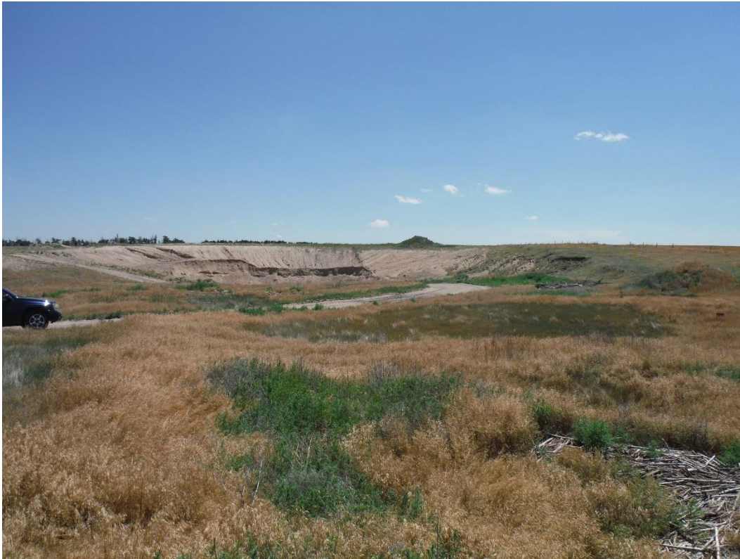
Site overview; looking south.