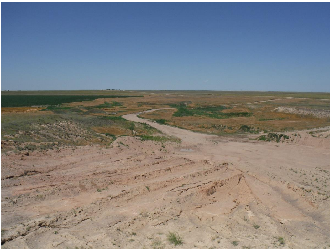
Site overview; looking north.