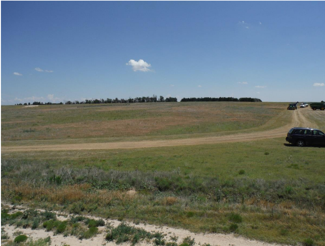
Approximately 4 acreage of undisturbed lands located south of the pit.

Dave Hornung Kit Carson County 249 16th St Burlington, CO 80807