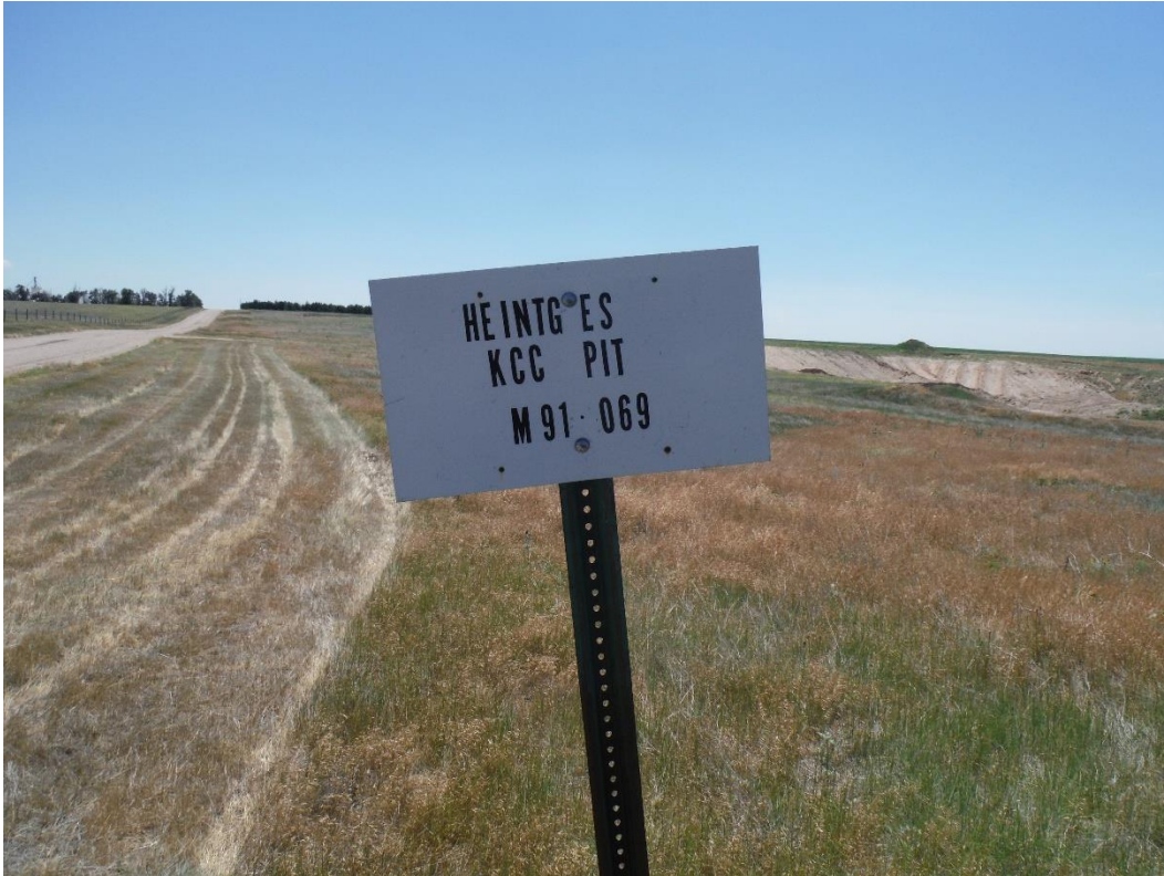
Mine identification sign posted at the northern entrance to the site; looking south.