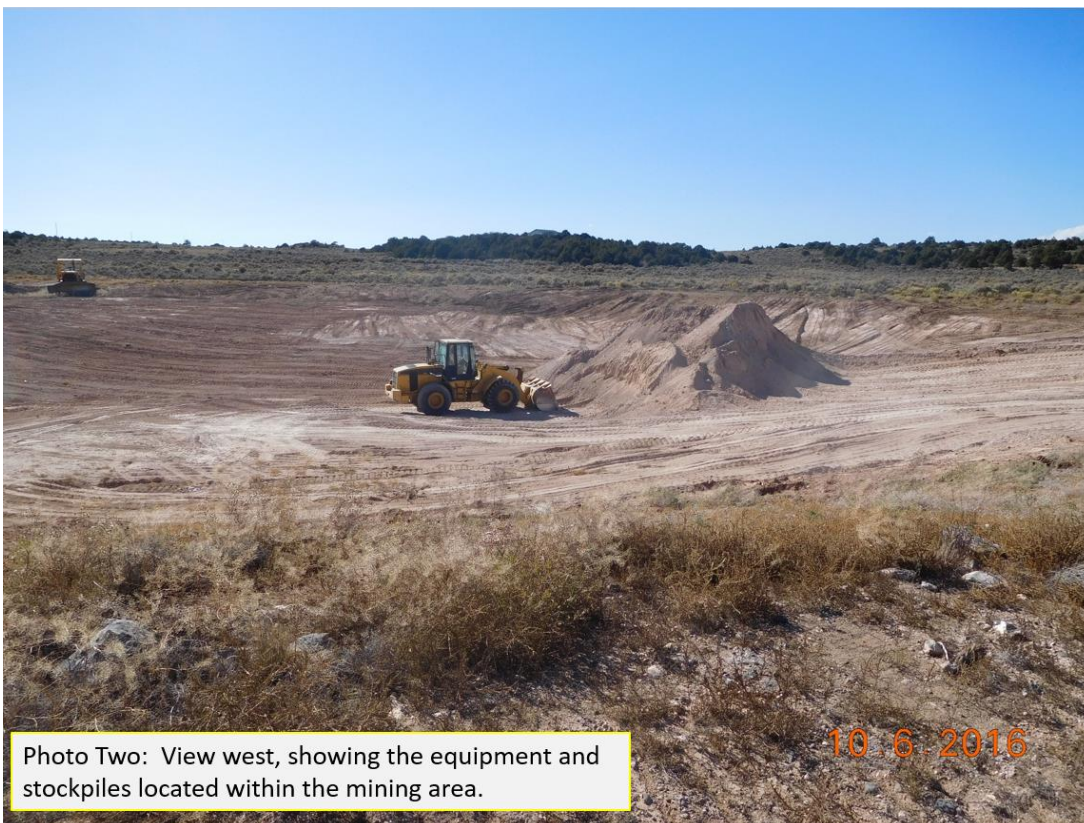
Photo Two: View west, showing the equipment and stockpiles located within the mining area.