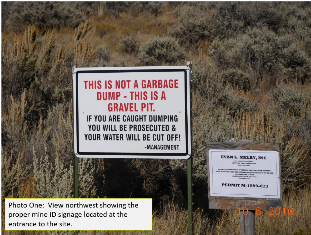
Photo One: View northwest showing the proper mine ID signage located at the entrance to the site.